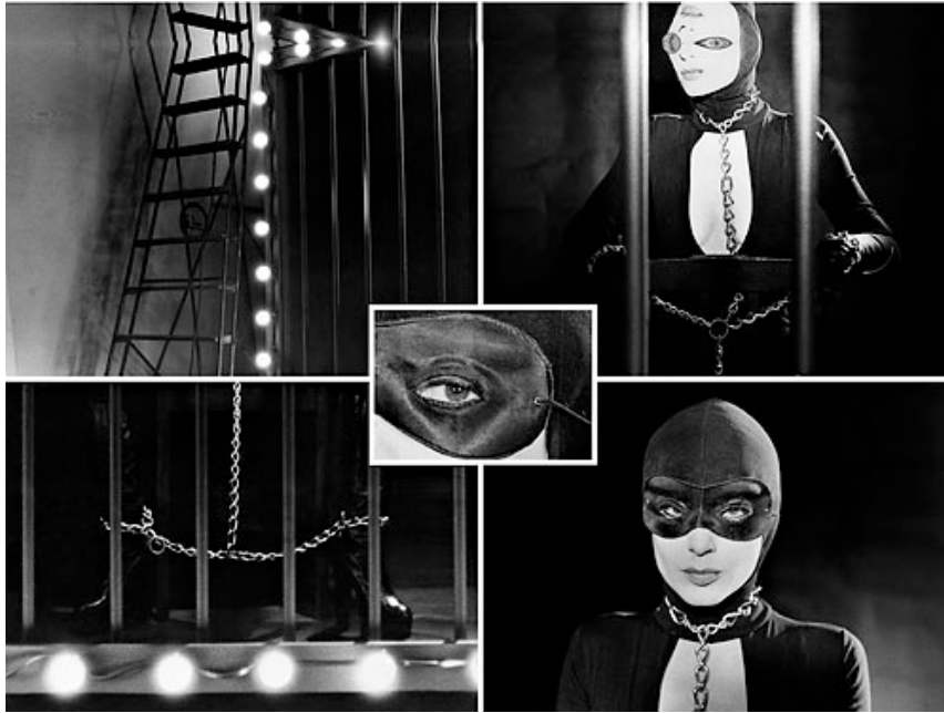
The End of Lola Montez, Performance 1975

After a break between 1983 and 1990 Manon pursued her artistic work to date. Her newest work adds to the visual vocabulary of the last decades and touches the topics of seduction, youth and vanity. In Borderline (2007) the artist shows the potential of colored self-portrayal. She uses blurry views in vivid colors oscillating between lady and vamp, beauty and pathology. In the recent series She Was Once Miss Rimini (2003) the artist enacts the fictitious story of an aging beauty queen. Manon takes on a variety of gender roles, alternating between male and female as she represents potential biographies of one and the same person.