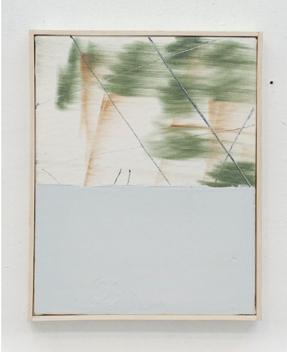
twin boat songs #6 2020 oil on canvas, wood 24 × 19 cm