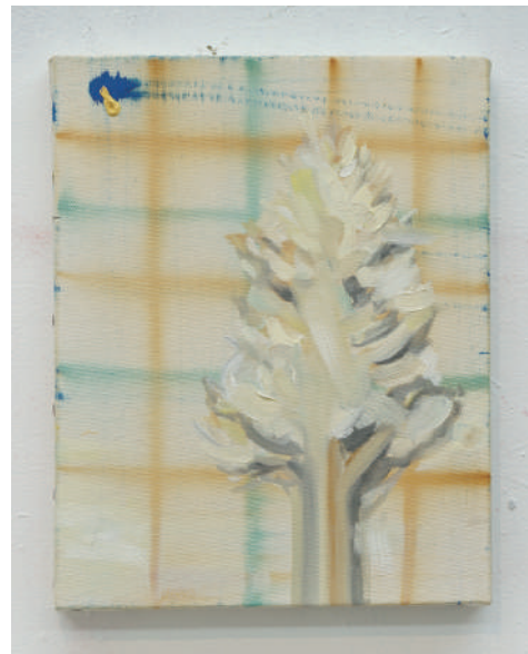
twin boat songs #10 2020, oil on canvas, 24 × 19 cm