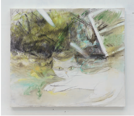
twin boat songs #3 2020, oil, color pencil on canvas, 45.7 × 53.2 cm