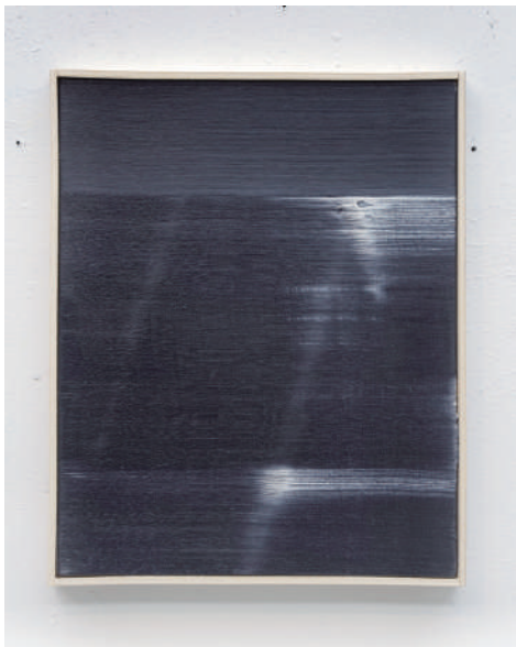
twin boat songs #7 2020, oil on canvas, wood, 27.3 × 22 cm