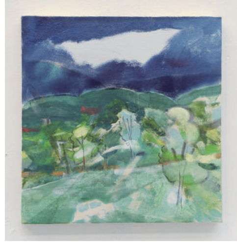
twin boat songs #4 2020, oil on canvas, 21.8 × 21 cm