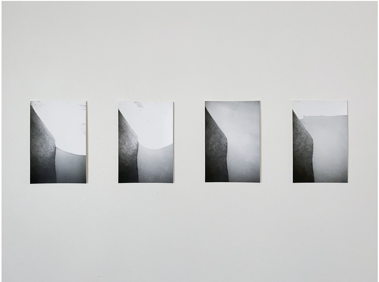
Untitled (Atlantic Ocean), 2019. Set of four photographs, silver gelatin prints, 9.25 x 6 in each (23.5 x 15.5 cm each). Ed. 5/5