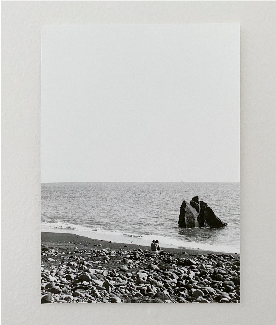
Untitled, 2020. Silver gelatin print, 8.3 x 6 in (21 x 15 cm). Ed. 5/5