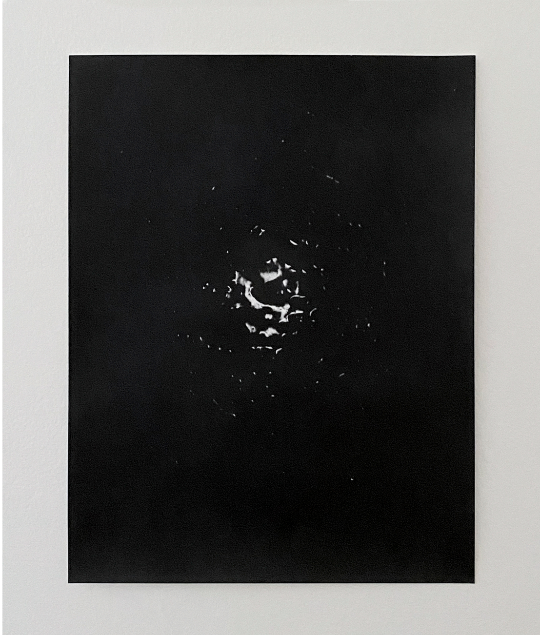
Full Moon, 2020. Silver gelatin print, 14.8 x 11.2 in (37.5 x 28.5 cm). Ed. 5/5