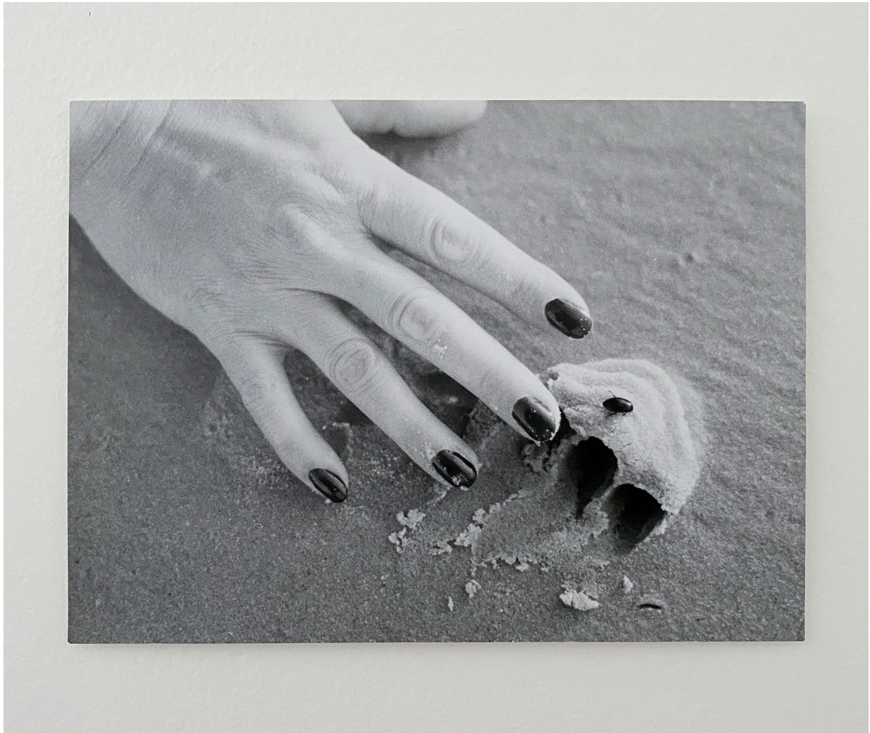
Untitled (Beetle/Hand), 2020. Silver gelatin print, 7.5 x 10.2 in (19 x 26 cm). Ed. 5/5