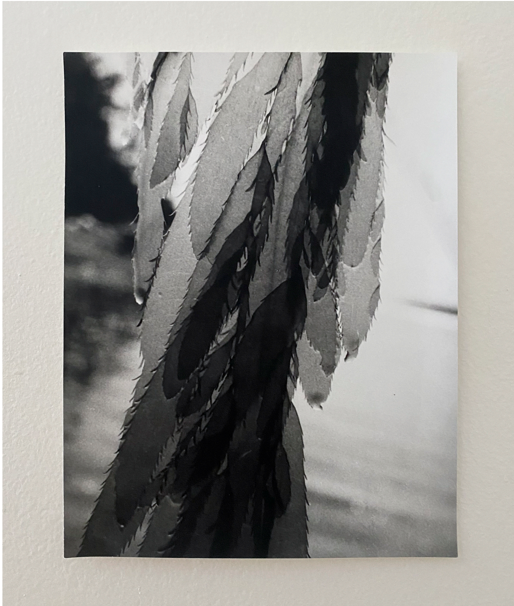
Untitled (Botany Bay), 2019. Silver gelatin print, 8.7 x 6.7 in (22 x 17 cm). Ed. 5/5