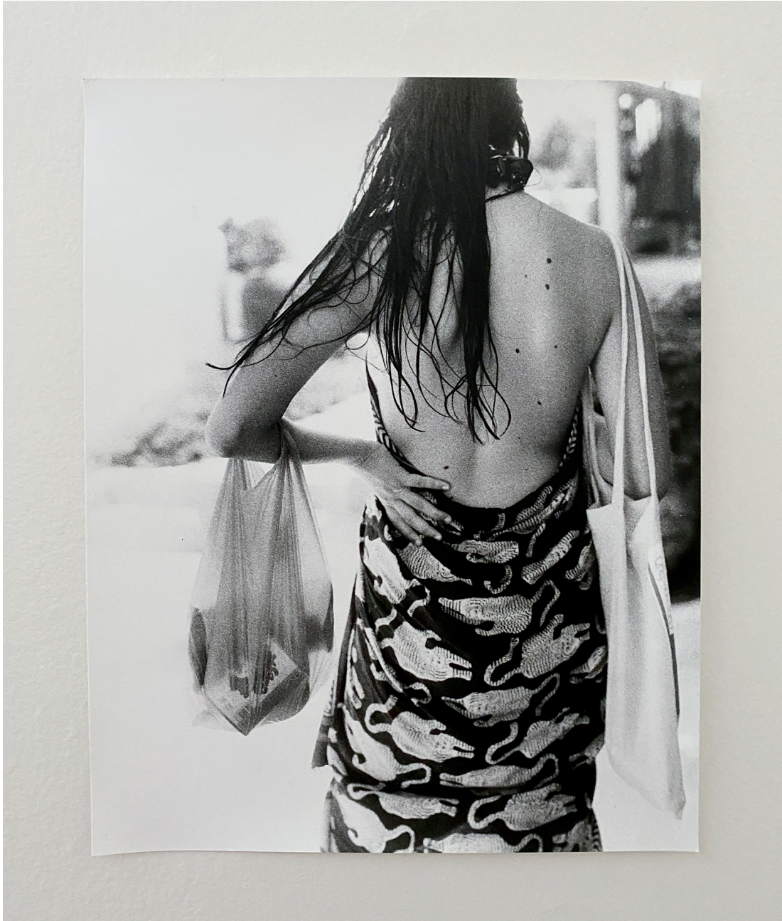
Untitled, 2020. Silver gelatin print, 11.4 x 9 in (29 x 23 cm). Ed. 5/5