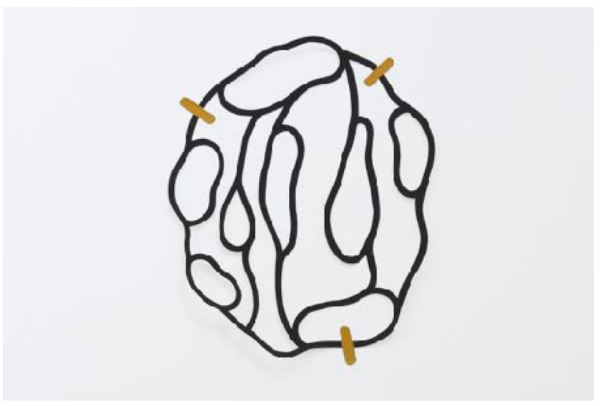
Maija Kurševa Black Lines , 2019, Kim? Contemporary Art Centre, Riga, Latvia.

Installation shots are available for download <u>here.</u>