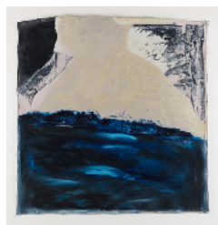
Like Dreaming of Angels and Leaving Without Them 2016 oil on canvas 60 x 60 in.