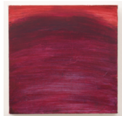
Love Beach 2018-2019 oil on canvas 14 x 14 in

2923 NORTH CICERO AVE CHICAGO ILLINOIS 60641 312-455-1015 SOCCERCLUBCLUB.COM