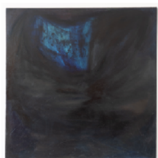
Anoyo 2015-2019 oil on canvas 54 x 54 in