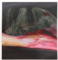
Blood Rainbow 2016 oil on canvas 75.5 x 79.5 in.