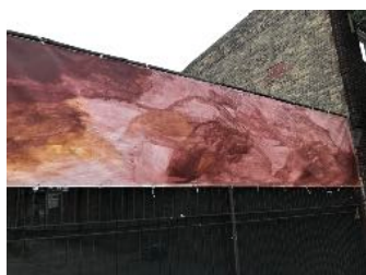
Desert Dust 2020 Flashe and UV protected waterproof vinyl-covered poly tarp 60 x 300 in.