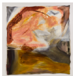
In Hopes of Seeing a Sunset Over the Goldfield 2017 oil on canvas 60 x 60 in.