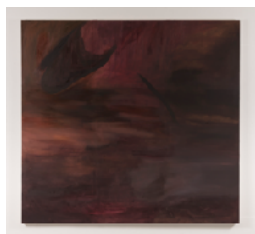
Your Bones Breathe Warmth 2017 oil on canvas 78 x 84 in