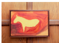
Dala Horse 2018 casein on panel 11.5 x 17.5 in