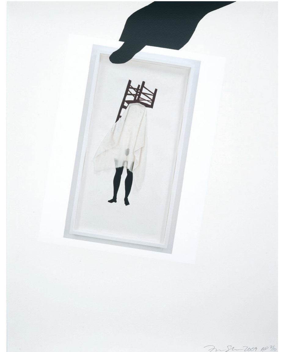
Untitled (Print for Die Freunde der Secession), 2009, screenprint, 18.8 x 14.8 inches