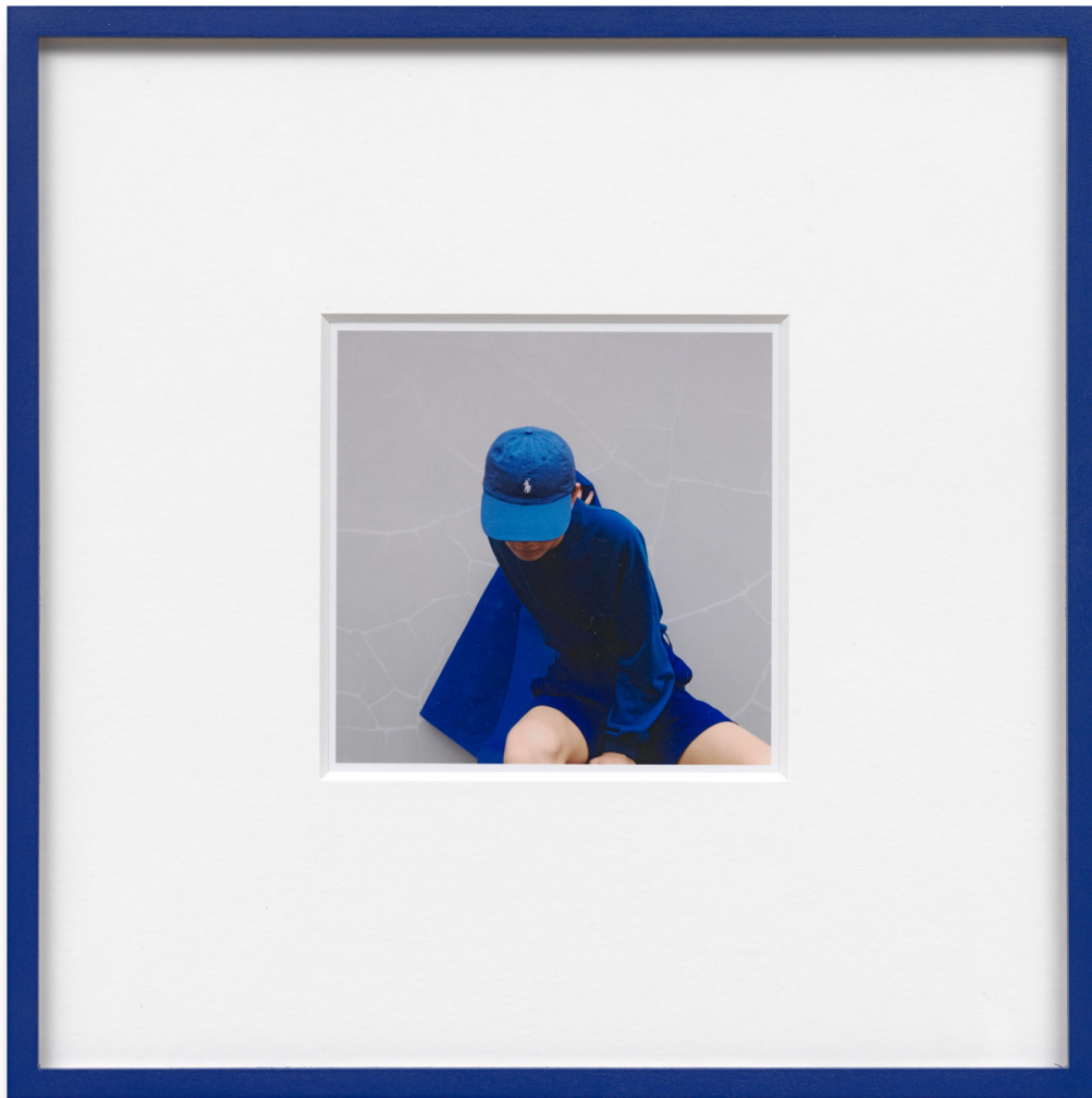
Ryan Wei Untitled , 2015 Inkjet print 27.5 x 27.5 cm (10 7/8" x 10 7/8") (framed)