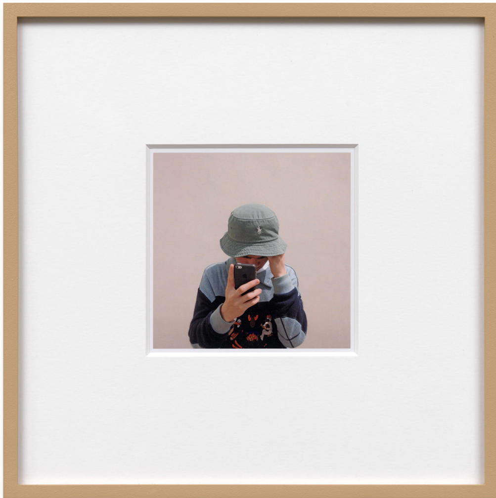
Ryan Wei Untitled , 2015 Inkjet print 27.5 x 27.5 cm (10 7/8" x 10 7/8") (framed)