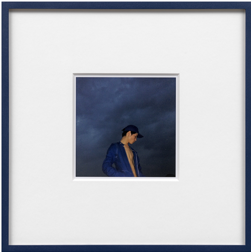
Ryan Wei Untitled , 2015 Inkjet print 27.5 x 27.5 cm (10 7/8" x 10 7/8") (framed)