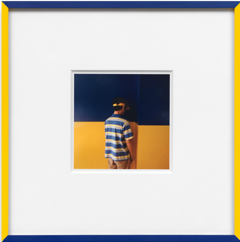
Ryan Wei Untitled , 2015 Inkjet print 27.5 x 27.5 cm (10 7/8" x 10 7/8") (framed)