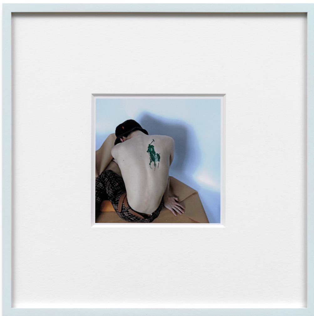
Ryan Wei Untitled , 2015 Inkjet print 27.5 x 27.5 cm (10 7/8" x 10 7/8") (framed)