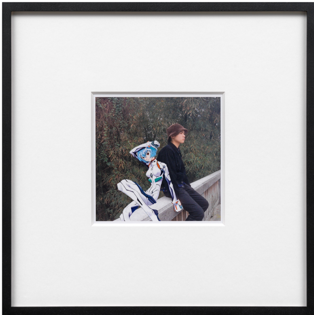
Ryan Wei Untitled , 2015 Inkjet print 27.5 x 27.5 cm (10 7/8" x 10 7/8") (framed)