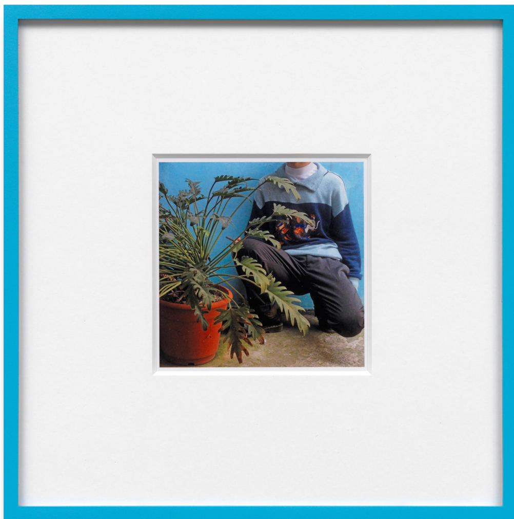
Ryan Wei Untitled , 2015 Inkjet print 27.5 x 27.5 cm (10 7/8" x 10 7/8") (framed)