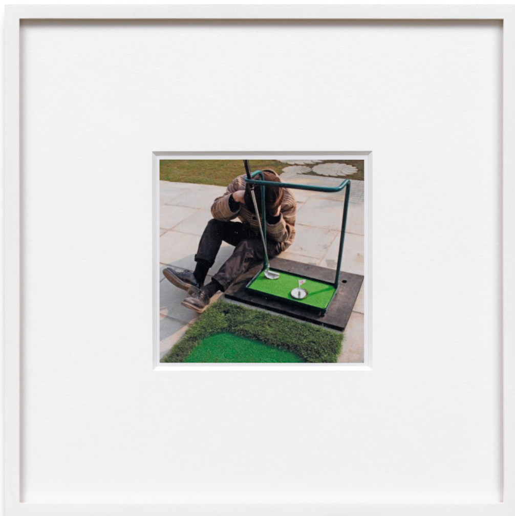
Ryan Wei Untitled, 2015 Inkjet print 27.5 x 27.5 cm (10 7/8" x 10 7/8") (framed)