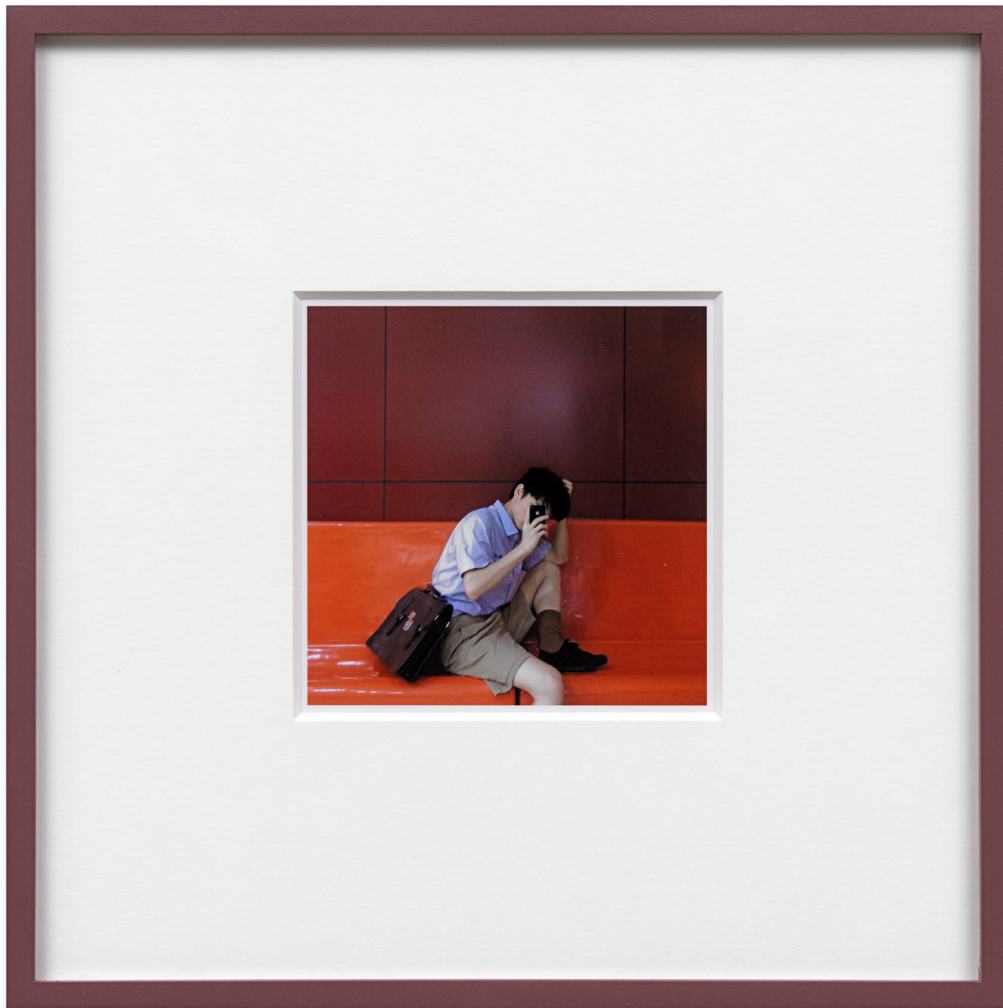
Ryan Wei Untitled , 2015 Inkjet print 27.5 x 27.5 cm (10 7/8" x 10 7/8") (framed)