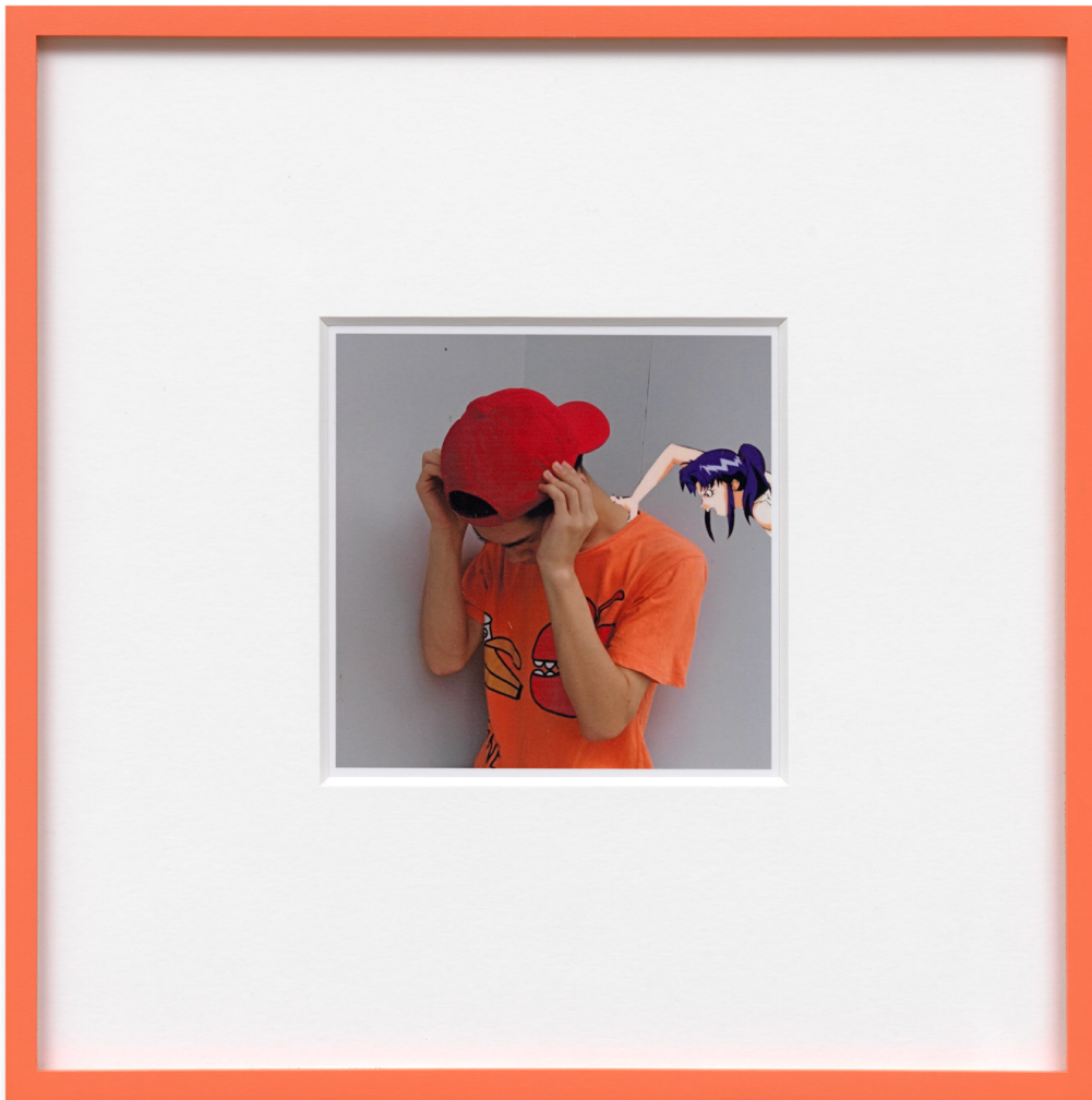
Ryan Wei Untitled , 2015 Inkjet print 27.5 x 27.5 cm (10 7/8" x 10 7/8") (framed)