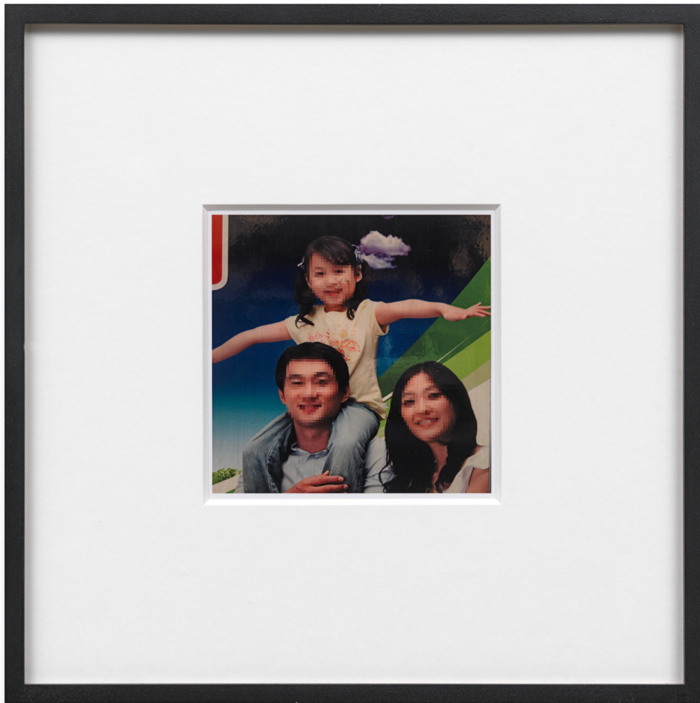
Ryan Wei Untitled , 2015 Inkjet print 27.5 x 27.5 cm (10 7/8" x 10 7/8") (framed)