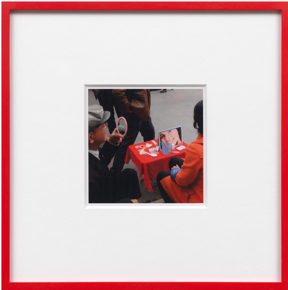
Ryan Wei Untitled , 2015 Inkjet print 27.5 x 27.5 cm (10 7/8" x 10 7/8") (framed)