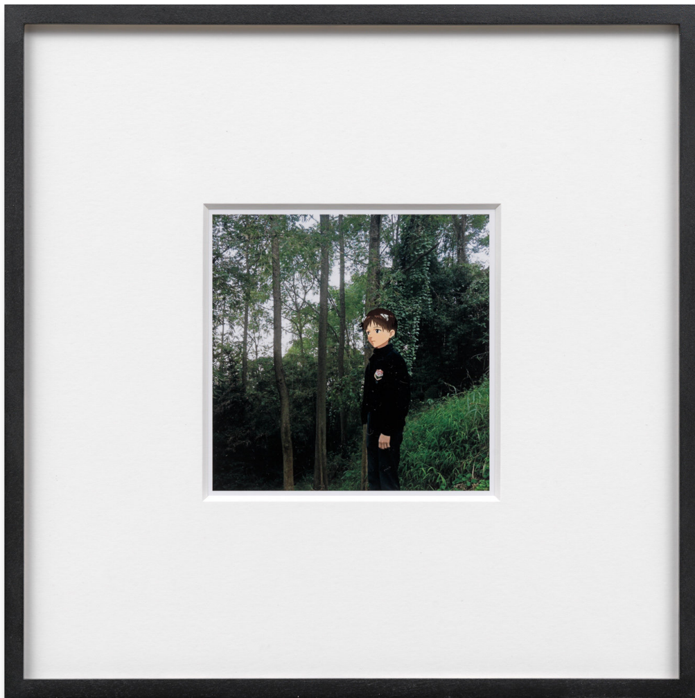
Ryan Wei Untitled , 2015 Inkjet print 27.5 x 27.5 cm (10 7/8" x 10 7/8") (framed)