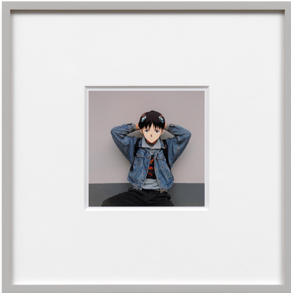
Ryan Wei Untitled , 2015 Inkjet print 27.5 x 27.5 cm (10 7/8" x 10 7/8") (framed)