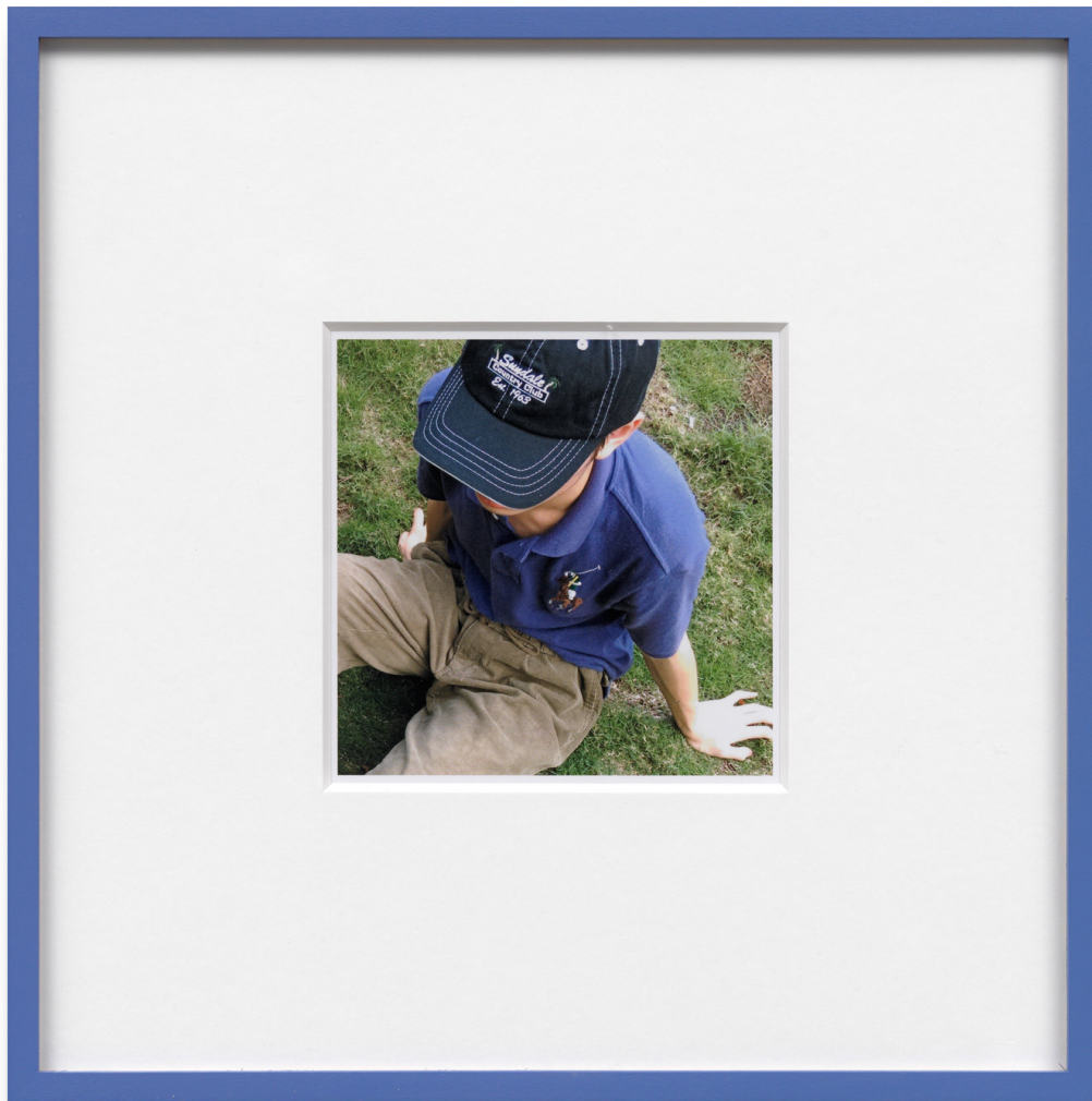
Ryan Wei Untitled, 2015 Inkjet print 27.5 x 27.5 cm (10 7/8" x 10 7/8") (framed)