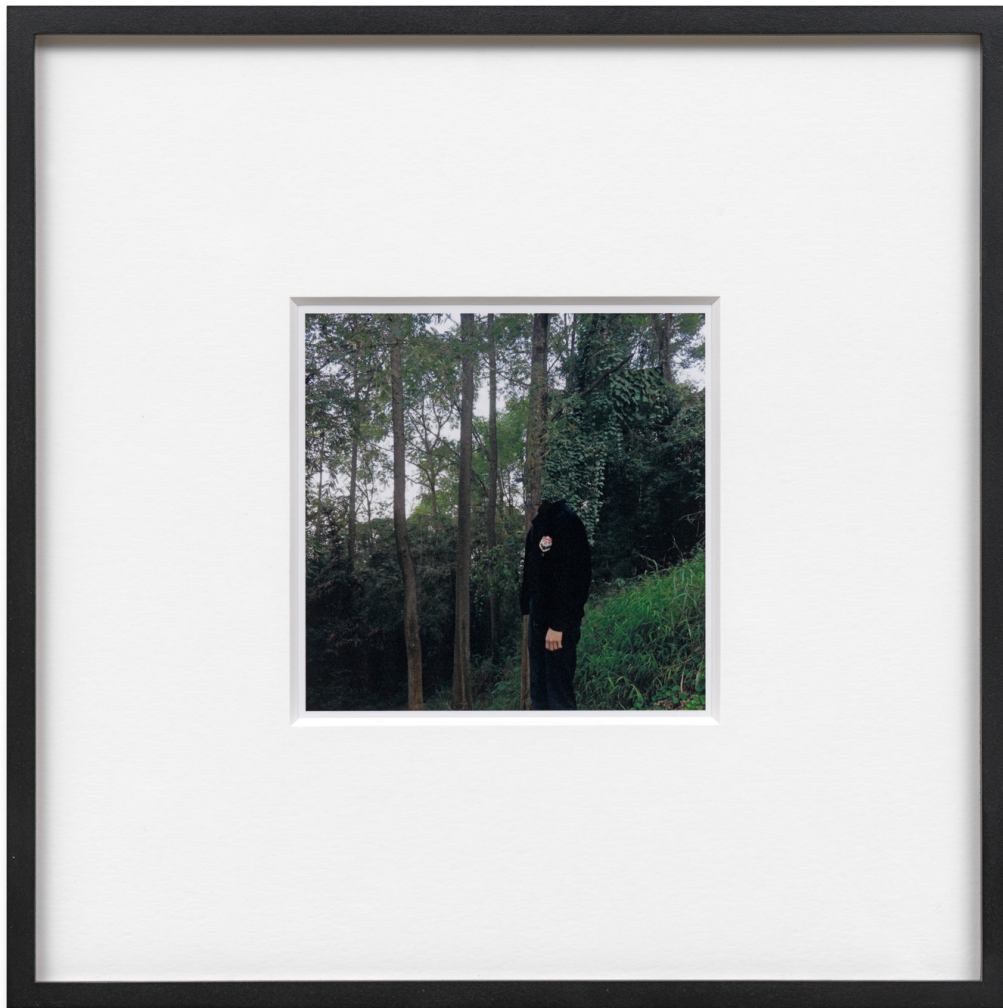
Ryan Wei Untitled , 2015 Inkjet print 27.5 x 27.5 cm (10 7/8" x 10 7/8") (framed)