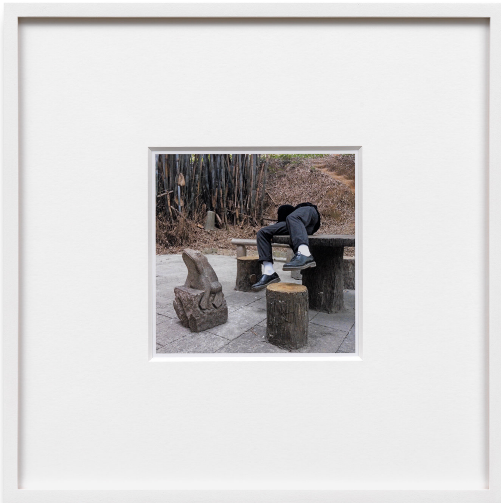
Ryan Wei Untitled , 2015 Inkjet print 27.5 x 27.5 cm (10 7/8" x 10 7/8") (framed)