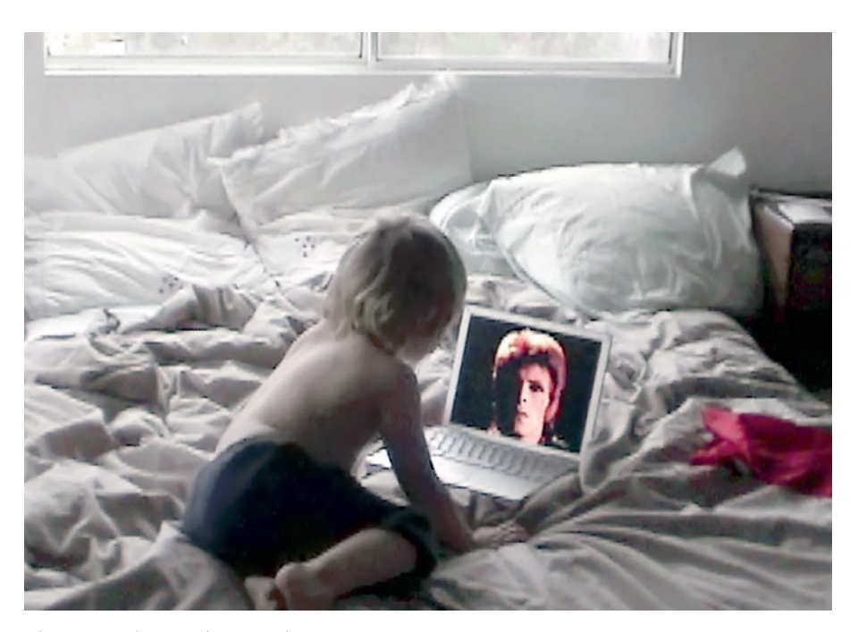
This Is Not Exactly a Cat Video: w/ David Bowie's "Starman," 2007

feed, operate as punctuation marks throughout, occasions for pausing, elaborating, or lingering, like so many commas, dashes, or ellipses. In more than one case, arrows seem to point the way, though not without also seeming to rebut one another; the Clever/ Stupid Pirouettes, ten large paired drawings, feature a distinctly polar ambigram: the same set of shapely characters, when reversed, effects the opposite message. These contradictory word-arrows are signposts that both taunt and self-mock, but that also serve to orient us with remarkable precision. In keeping, a brochure like this one might constitute a vade mecum—a handy, step-by-step guide—and yet within the exhibition visitors will find instances of indication meaningfully coupled with, when not flatly outnumbered by, instances of intimation.