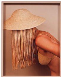
ELAD LASSRY Blond Girl 2 , 2010 C-print, painted frame 14.5 x 11.5 x 1.5 inches Edition API of 5, with 2AP