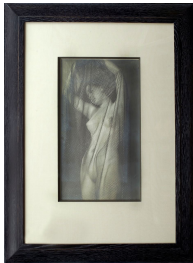
PAUL OUTERBRIDGE Descending Night , 1935 Vintage gelatin silver photograph 16.5 x 9.47 inches