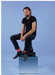
Figure Study (Chad) , 2011