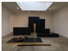
ISABELLE CORNARO Landscape , 2016 Baltic Birch, water-based acrylic paint, brass, brass screws, velvet fabric, dried fungus, tree root, agate, glass shaped as crystals, metal chains and jewelry, coins, scientific model 240 x 211 x 105 inches 609.6 x 535.9 x 266.7 cm (Inv# ICO0060)