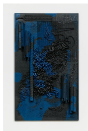
ISABELLE CORNARO Orgon Doors I (black and blue) , 2013 Tinted Elastomer and MDF 51.97 x 31.1 x 4.72 inches 132 x 79 x 12 cm (Inv# ICO0062)

ISABELLE CORNARO JANUARY 23 - MARCH 19, 2016