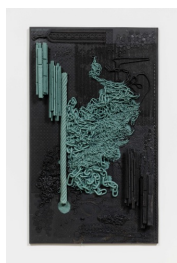
ISABELLE CORNARO Orgon Doors I (black and green) , 2016 Tinted Elastomer and MDF 51.97 x 31.1 x 4.72 inches 132 x 79 x 12 cm (Inv# ICO0058)