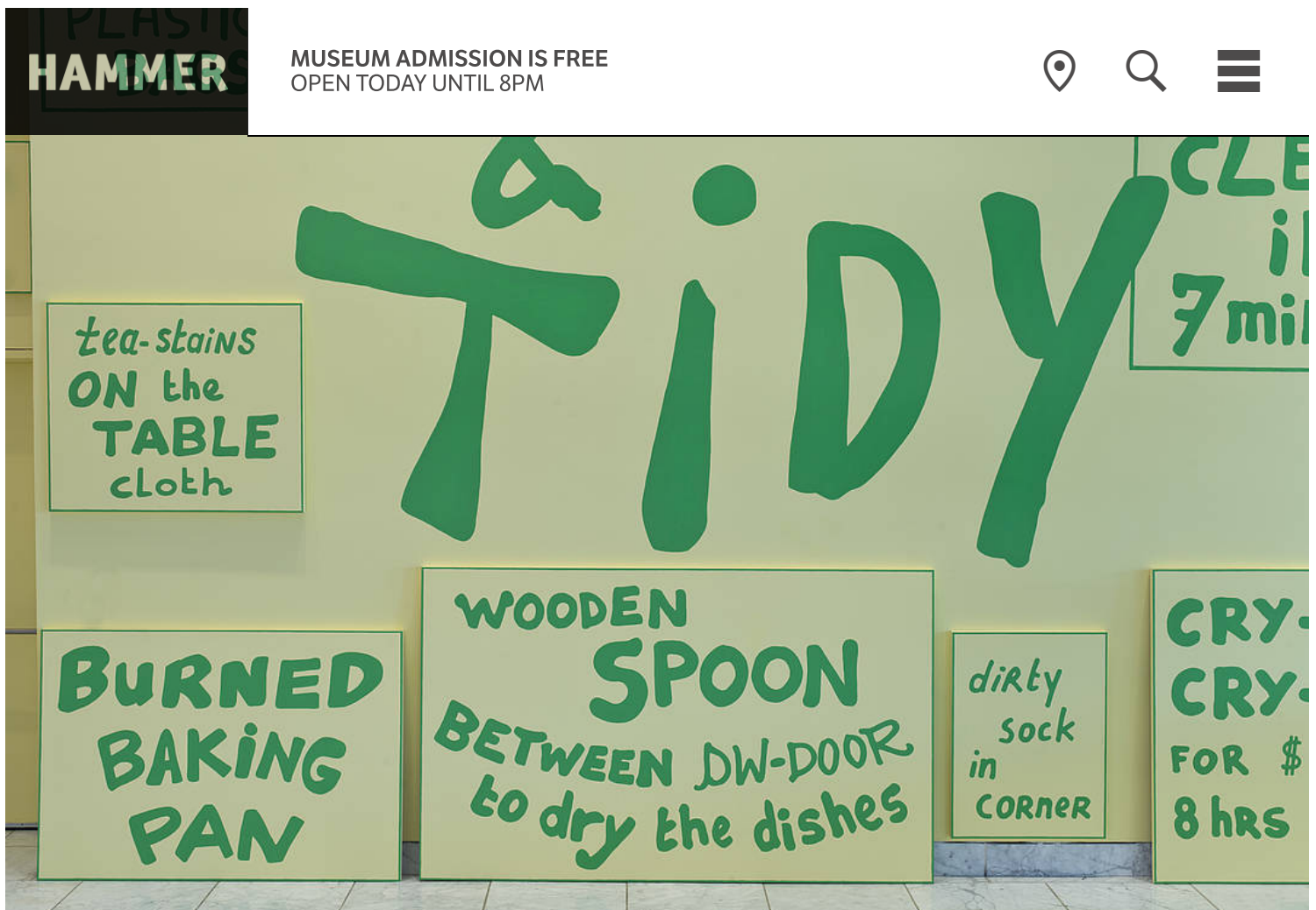
Hammer Projects: Lily van der Stokker

LCR: In a similar vein, how does The Tidy Kitchen engage emotion and its expression? I'm thinking of the text "Crying Crying for $320 p day 8 hours a day," in particular.