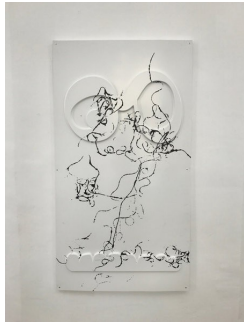
Benjamin Hirte Untitled, 2017 UV print on PVC, vacuum formed, aluminum frame 170 x 92 cm BH/O 109

T +43 1 945 1791 GALLERY@EMANUELLAYR.COM WWW.EMANUELLAYR.COM