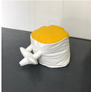
Benjamin Hirte Backbone, 2017 synthetic leather, felt, foam 45 x 70 x 50 cm BH/O 113

T +43 1 945 1791 GALLERY@EMANUELLAYR.COM WWW.EMANUELLAYR.COM