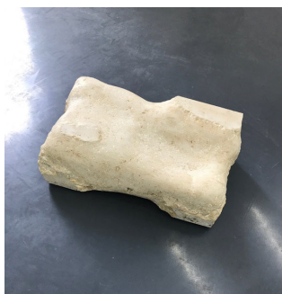
Benjamin Hirte Jaw, 2017 Travertine limestone 65 x 40 x 20 cm BH/S 35