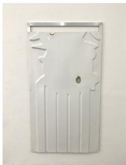
Benjamin Hirte Pecker, 2017 PVC, vacuum formed, aluminum frame 170 x 92 cm BH/O 110