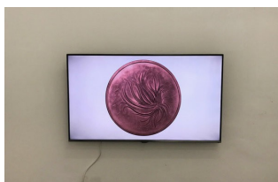
Benjamin Hirte Stay put, 2017 3D Animation, Flatscreen 5 min 3 + 1 AP BH/V 4