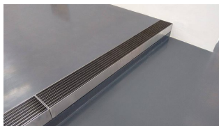
Benjamin Hirte Gutter/Rinne, 2017 Aluminium, steel, various material 18 x 250 x 25 cm BH/O 115