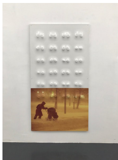
Benjamin Hirte Untitled, 2017 UV print on PVC, vacuum formed, aluminum frame 170 x 92 cm BH/O 111