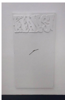
Benjamin Hirte The Post JFK Issue, 2017 PVC, vacuum formed, clockwork, aluminum frame 170 x 92 cm BH/O 112