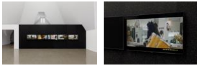
17-18. Alison O'Daniel, The Tuba Thieves: The Drums , 2013-ongoing. Installation view in Nine Lives , 2020.