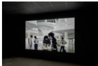
27. Tamar Guimarães, O Ensaio / The Rehearsal , 2018. Installation view in Nine Lives , 2020.