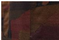
21. Kapwani Kiwanga, detail of Repository , 2020.