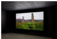
29. Charlotte Prodger, Bridgit , 2016. Installation view in Nine Lives , 2020.