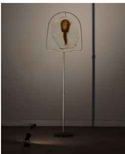
Biting skin off lips, 2019