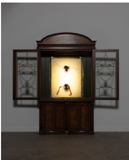
Church Organ, 2020

mardigras masks, steel frame, china cabinet, soap, sharpie