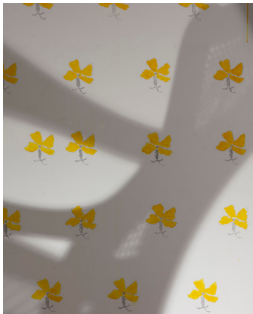
Hand Me Down, 2020