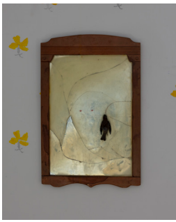
Closer II, 2018

soap, frames mirror, sparrow, beeswax, resin