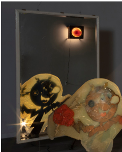
Taylor's Mirror, 2020