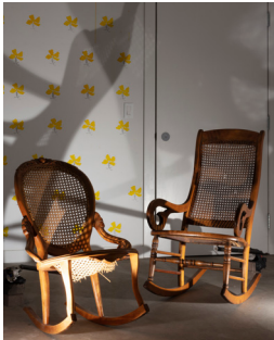
The Conversation, 2020