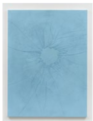
ROBERT BORDO crackup #10 (frost) , 2019 Oil on canvas 75 x 56 in (190.5 x 142.2cm) RB9271