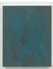
ROBERT BORDO bird/window #4 , 2019 Oil on linen 20 x 16 in (50.8 x 40.6cm) RB9279