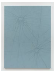
ROBERT BORDO crackup #11 (crackup/crackdown) , 2019 Oil on canvas 80 x 60 in (203.2 x 152.4cm) RB9275