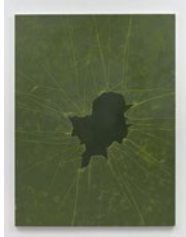
ROBERT BORDO crackup #15 (monster mash) , 2019 Oil on canvas 84 x 63 in (213.4 x 160cm) RB9269