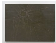
ROBERT BORDO crackup #13 (witch) , 2019 Oil on canvas 63 x 84 in (160 x 213.4cm) RB9270