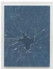
ROBERT BORDO crackup #14 , 2019 Oil on canvas 75 x 56 in (190.5 x 142.2cm) RB9272