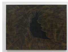
ROBERT BORDO crackup #1 (oil field) , 2019 Oil on canvas 63 x 84 in (160 x 213.4cm) RB9268