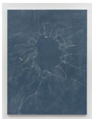
ROBERT BORDO crackup #8 (beast) , 2019 Oil on canvas over panel 84 x 63 in (213.4 x 160cm) RB9266