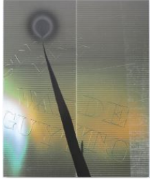
Wade Guyton, Untitled, 2016, Epson UltraChrome HDR on linen Stephen Prina, PUSH COMES TO LOVE , Untitled, 1999 - 2017