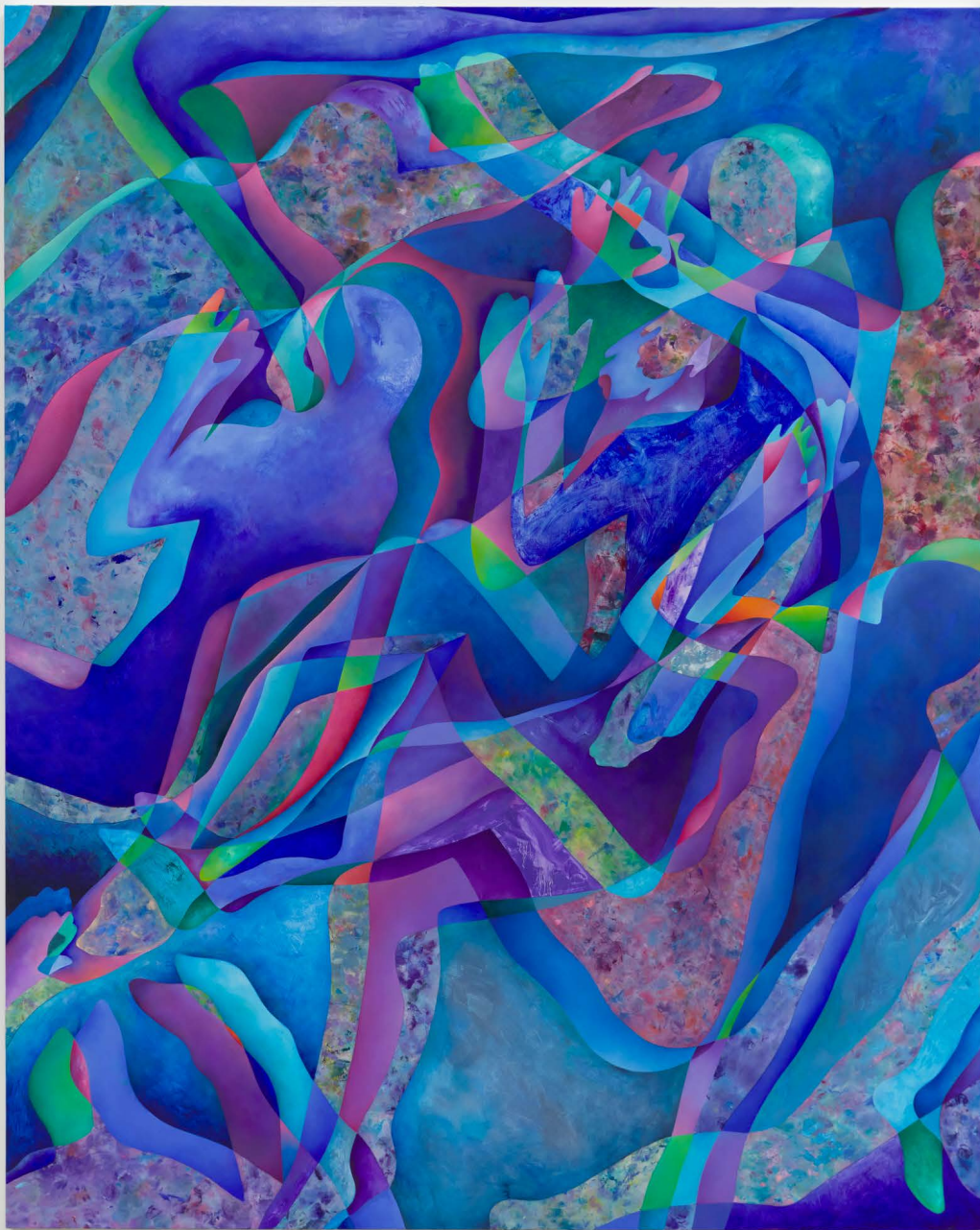
ANNA OSTOYA Float , 2020 Oil and fabric on canvas 75 x 60 in (190.5 x 152.4 cm) AO9571