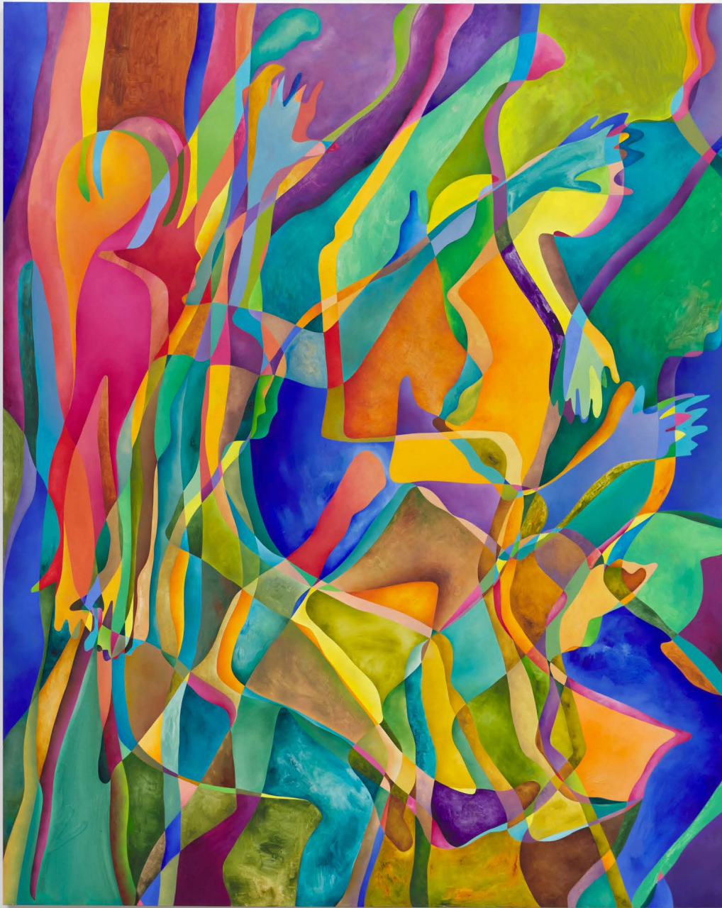
ANNA OSTOYA Jump , 2020 Oil on canvas 75 x 60 in (190.5 x 152.4 cm) AO9576