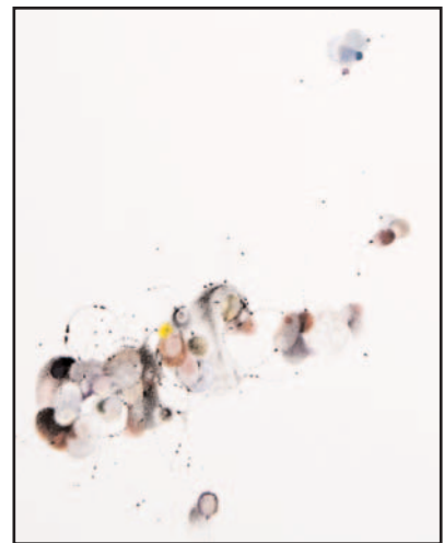
Eduardo Santiere, Detail of SN16 , 2006. Colored pencil and graphite on paper, 30 x 22 1/4 inches.

New York, January 15, 2007 – From February 24 to March 31, 2007, The Drawing Center will present Levity: Selections Spring 2007 , an exhibition exploring lightness in both material and metaphoric terms featuring fourteen emerging artists selected from the Viewing Program. In these drawings, the term “levity” can imply a “light touch” through the use of lightweight or light-colored materials as well as a sense of humor or irreverence. The practice of the artists in Levity ranges from imprinting simple observations of daily life to creating flights of fantasy and visually humorous scenarios. Some generate levity by manipulating the form of lightweight materials while others work with light as a material for drawing. Participating in the exhibition are Esteban Alvarez, Ingólfur Arnarsson, Norma-Jean Bothmer, Anne Daems, Ivana Franke, Bill Gerhard, Kate Joranson, Irene Kopelman, Jiha Moon, Mio Olsson, Michelle Oosterbaan, Lisa Perez, Eduardo Santiere, and Rachel Perry Welty.