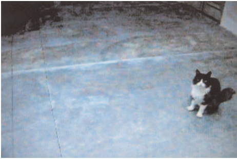
Esteban Alvarez, video still from Brus (wool drawing) , 2005. DVD, 40 seconds.

draws inspiration from the large collection of stuffed animals and dolls in her studio, registering a wide variety of views of a teddy bear. With just a few strokes of colored pencil, Anne Daems (Brussels, Belgium) comments insightfully on everyday situations and objects in her multiple small-scale pencil