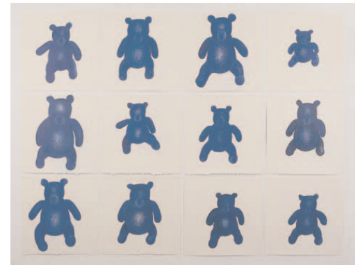
Norma-Jean Bothmer, Pooh Bear I-XII , 2006. Caran d'Ache pencil on paper, 12 drawings, 22 x 22 inches each.

drawings illuminated by humorous captions, exploring both inexplicable and overlooked moments. Ivana Franke (Zagreb, Croatia) has long experimented with transparent materials such as clear tape and luminous fabric, relating them to human psychology and the physicality of the body. For Levity , she will create a new installation invoking these concerns through drawing with light. Bill Gerhard (Brooklyn, NY) creates photogenic drawings by exposing dark sheets of construction paper to sunlight. By using light itself as a medium, Gerhard has created a subtle visual language that balances scientific experimentation and chance. The art of Kate Joranson (Pittsburgh, PA) deals with drawing by unconventional means. In Levity , she will drag a cinder block through powder, leaving a trail as delicate as the block is crude. From this disproportionate action, a sense of absurdity will emerge. Irene Kopelman (Amsterdam, the Netherlands) explores the act of copying by imitating stray marks on a wall and delving into research archives. Her finely rendered pencil drawings of microfossils make particles visible that otherwise would never be seen by the naked eye. Jiha Moon (Atlanta, GA) provides sly observations on traditional art genres through a skillful drawing practice that combines the styles and imagery of Western Pop art and Asian landscapes. Here she presents four new drawings from her “Mythscape” series. Mio Olsson (Brooklyn, NY) gathers