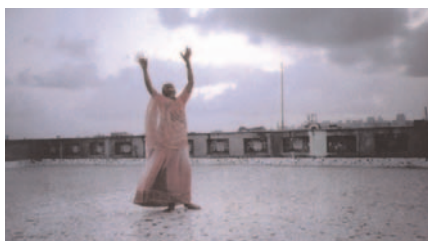
Video still from The Laughing Club of India , 2000.

On Saturday, February 24 at 2 pm , The Drawing Center will present a free gallery talk with several artists from the Levity exhibition and curator Katherine Carl.