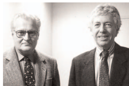
John Ashbery and Kenneth Koch, 1994.

In anticipation of National Poetry Month, The Drawing Center will host a poetry reading on Tuesday, March 27 at 6:30 pm featuring the works of two important Americans known for revitalizing poetry as a ground for serious play: John Ashbery and the late Kenneth Koch . Ashbery will read from his new collection, A Worldly Country . Ron Padgett , Koch's friend and fellow teacher, will read from a new selection of Koch's work, which he edited. This event is co-presented with the Academy of American Poets. Admission is $5/free for members.