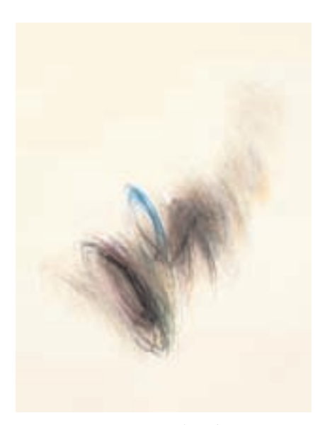
ALAN SARET, Sana Whir Will (detail), 1983. Colored pencil on paper.

to focus on site-specific and architectural projects. Saret's work has been exhibited at museums throughout the U.S. including the Whitney Museum of American Art, NY; Modern Art Pavilion in Seattle, WA; Fine Arts Gallery, Irvine, CA; and the Albright-Knox Art Gallery in Buffalo, NY. His most recent solo exhibition took place in 1990 at P.S. 1 Contemporary Art Center, a MoMA affiliate, in Long Island City, NY. Saret's work is included in numerous public and private collections including The Museum of Modern Art, New York, NY; the Whitney Museum of American Art, New York, NY; The Detroit Institute of Arts, Detroit, MI; and the Art Gallery of Ontario, Toronto, Canada.