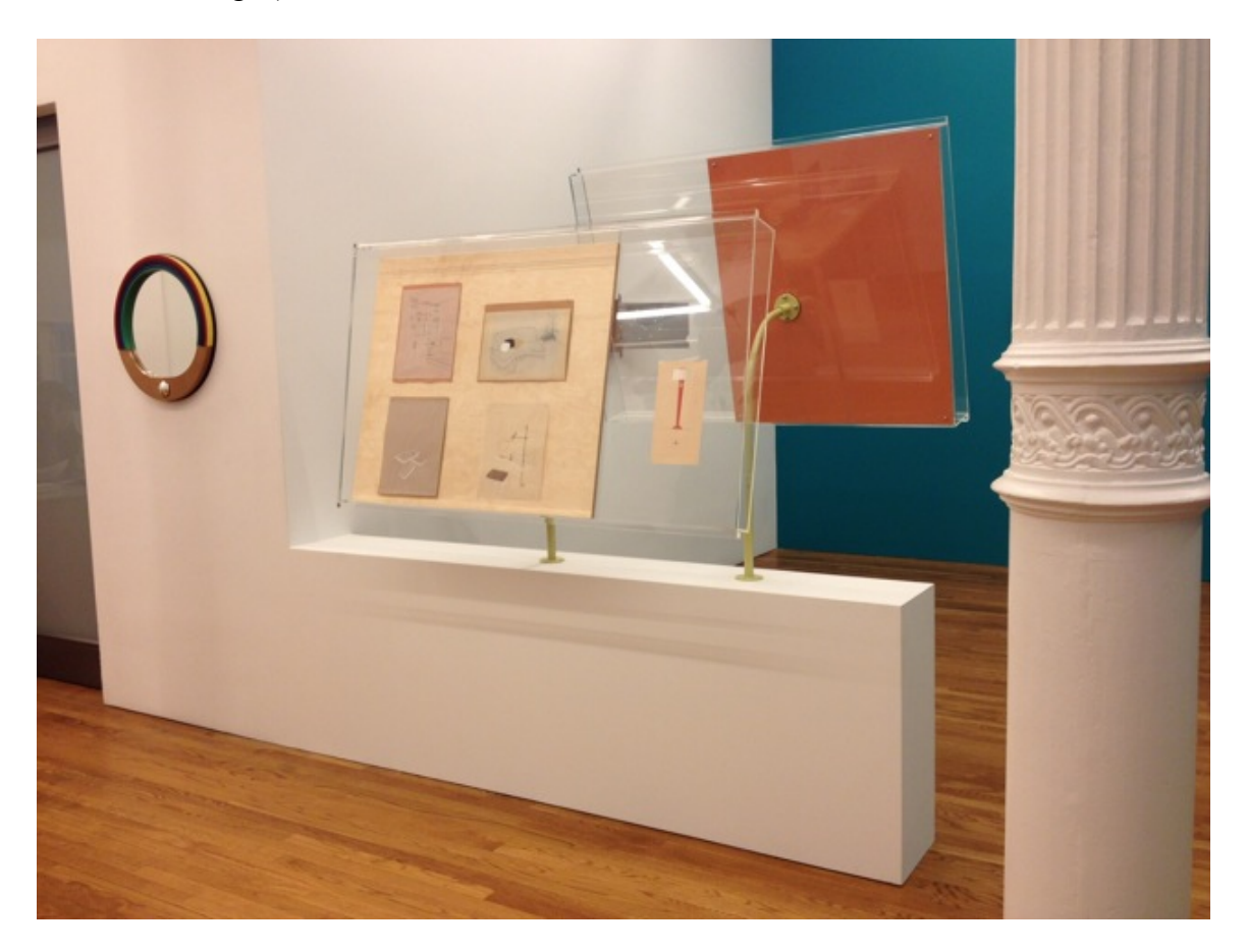
18. Adam Linder (1) framed contract

(2) vitrines designed by Nairy with drawings by Janette (the gallery mentioned a plinth has to be built in situ, but perhaps the vitrines can just be connected to one of the raised areas of the stage?)