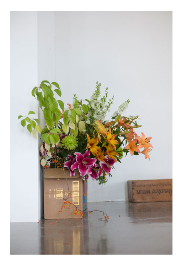
20. Paulina Olowska "Dancing" 2007 white and red neon 35 ½ x 45 ½ inches

"For Susanne" 2012 dimensions variable gold, cardboard, and 40 flower stems