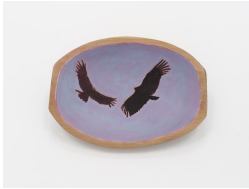
Patricia Leite Urubus 2017 oil on wood 25 x 18 cm