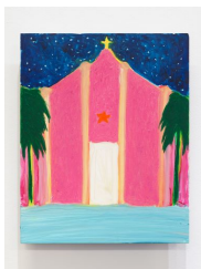
Patrícia Leite Igreja Rosa 2017 oil and oily pastel on wood 50 x 40 cm