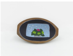
Patrícia Leite Para Oliveira Leite 2017 oil on wood 13 x 21 cm