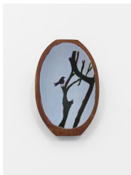
Patricia Leite Sabiá 2017 oil on wood 23 x 15 cm