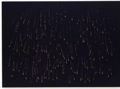
Patrícia Leite Chuva 2017 oil on wood 160 x 220 cm

Patrícia Leite Olha pro céu, meu amor 19/01 – 07/04 2018