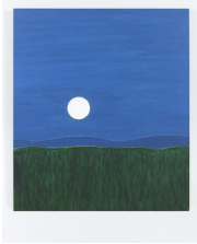
Patricia Leite Superlua no céu claro 2017 oil on wood 160 x 140 cm