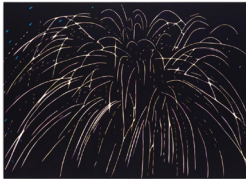
Patrícia Leite Explosão I 2017 oil on wood 160 x 220 cm