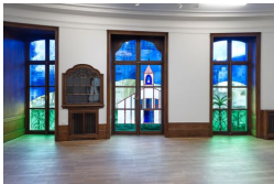
Patricia Leite Ó 2017/2018 stained glass variable dimensions