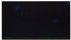
Patricia Leite Olha pro céu, meu amor 2017 oil on wood 160 x 280 cm