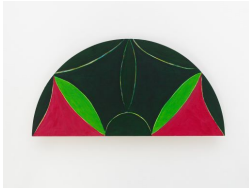
Patricia Leite Vital Brasileiro 2018 oil on wood 51 x 26 cm