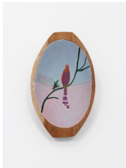
Patricia Leite Alma de gato 2017 oil on wood 26 x 25,5 cm