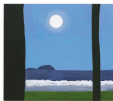
Patricia Leite Copacabana II 2017 oil on wood 130 x 160 cm