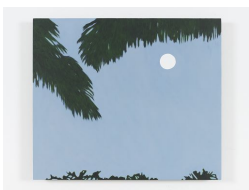
Patricia Leite Superlua no céu claro II 2017 oil on wood 60 x 70 cm