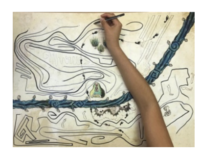
Guadalupe Maravilla, Requiem for my border crossing and my undocumented father's #5 (work in progress) , 2016. Inkjet Print and hand drawing, 20 x 30 inches, Edition 1 of 5.