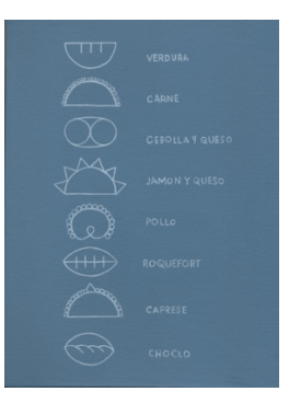
Lux Lindner, Science of Argentinian Destiny , 2013 – ongoing. Acrylic on canvas, 28 drawings, 7 x 9 1/2 inches each.