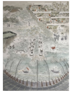
Kunlin He, Hometown Flood A , 2016. Acrylic and ink drawing on three difference layers (bottom: muslin, middle: mylar, top: acrylic), 40 x 30 inches.