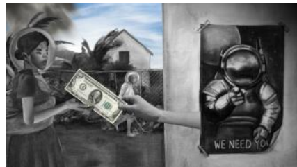
Young Joo Lee Black Snow , 2019 Digital animation 10 minutes 33 seconds

Ink, gouache and powdered bullet shells on paper 17 x 13 inches