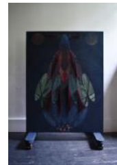
Johanna Unzueta Two Of Us I , 2019 Wood, indigo dye, pastel pencil, gold watercolor, industrial wheels, nails and linen thread 36 x 52 x 19 inches