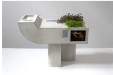
Katarina Burin Planter for Creeping Time, July or August, probably 1978 , 2019 Cement, Thyme plants, plexiglass, masonite, 2 minutes, 54 seconds digital image 23 x 17 1/2 x 11 13/16 inches