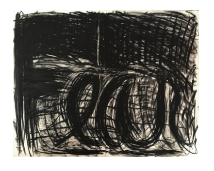
Judith Bernstein, Fear , 1995. Charcoal on paper, 47 1/2 x 63 inches. Courtesy of the artist.