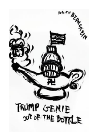
Judith Bernstein, Trump Genie , 2016. Acrylic on paper, 29 x 41 inches.

New York – Judith Bernstein presents a new body of work, specifically commissioned by The Drawing Center, for her exhibition Cabinet of Horrors in the Main Gallery. Focusing on work made since Donald J. Trump was elected president in November 2016, the exhibition includes approximately eighteen new drawings, four large-scale paper panel murals, a series of drawn "dollar bills", vintage piggy banks in a vitrine, and a free political campaign pin designed by Bernstein. As well, the exhibition features one of Bernstein's earliest political drawings from 1969 and a selection of five "Word Drawings" from 1995, including: Liberty, Justice, Equality, Evil , and Fear .