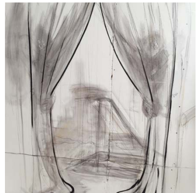
Inka Essenhigh, Sketches for Manhattanhenge at The Drawing Center, 2017.