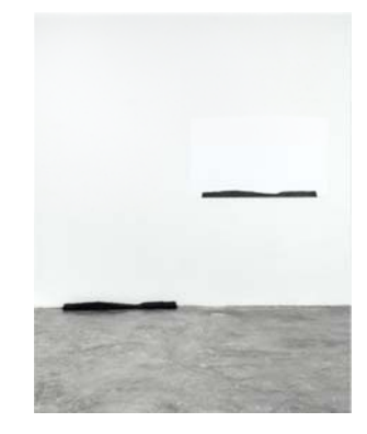
LEFT: Installation view of Foundation I , 2017. Solid graphite, 44 x 3 3/4 x 2 3/4 inches. RIGHT: Installation view of 1:1 Foundation I, No. 1 (rear profile) @The Drawing Center, 2017. Graphite pencil on paper, 32 1/8 x 42 inches.