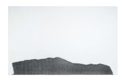
1:1 Foundation II, No. 1 (rear profile) @The Drawing Center, 2017. Graphite pencil on paper, 32 1/8 x 42 inches.

All works are by Susan York and courtesy of Del Deo & Barzune, New York and Exhibitions 2d – Marfa.