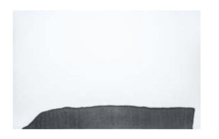
1:1 Foundation III, No.1 (rear profile) @The Drawing Center, 2017. Graphite pencil on paper, 32 1/8 x 42 inches.