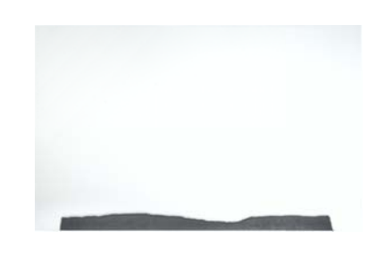
1:1 Foundation I, No. 1 (rear profile) @The Drawing Center, 2017. Graphite pencil on paper, 32 1/8 x 42 inches.