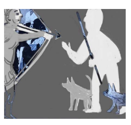
Amy Sillman, Still from After Metamorphoses , 2015–16. Video animation with iPad drawings, 5 minutes, looped. Music by Wibke Tiarks.