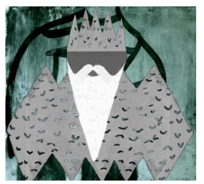
Amy Sillman, Still from AfterMetamorphoses , 2015–16. Video animation with iPad drawings, 5 minutes, looped. Music by Wibke Tiarks. (film still)