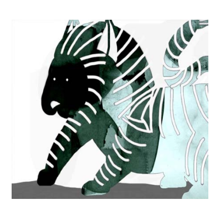
Amy Sillman, Still from After Metamorphoses , 2015–16. Video animation with iPad drawings, 5 minutes, looped. Music by Wibke Tiarks. Courtesy of the artist.