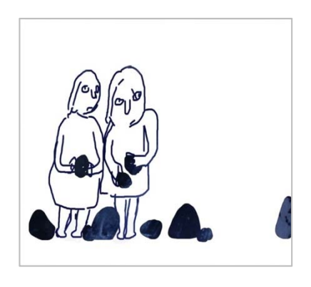
Amy Sillman, Still from After Metamorphoses , 2015–16. Video animation with iPad drawings, 5 minutes, looped. Music by Wibke Tiarks.