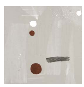
Sara Chang Yan, Sequence/Time-quality , 2016. Pencil, watercolor and gouache on paper, 17 3/4 x 11 2/5 inches.