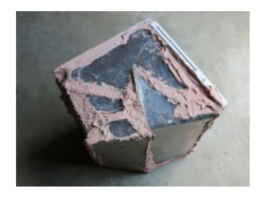
Rafael Kelman, Homunculus / Patsy / Infernal Machine , 2016. Computer, plastic, body filler, Dallas Police Department horse manure, human genetic material, 10 x 10 x 13 inches.