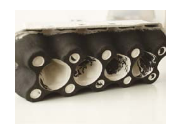
Sun Moqing, Neighbor No. 1 , 2016. Ink on object, 4 x 2 ¾ inches. Courtesy of the artist.