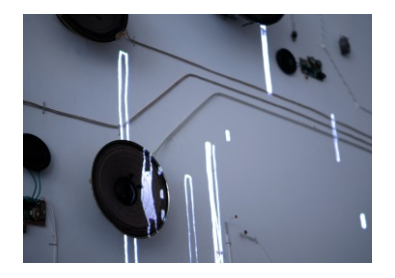
Thessia Machado, photosonic fields , 2016. Modified greetingcard sound modules, harvested speakers and motors, custom electronics, video projection. Dimensions variable. Courtesy of the artist.