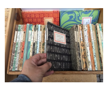
Lei Lei, Books on Books , 2013-16. Video, collage on paper. Dimensions variable.