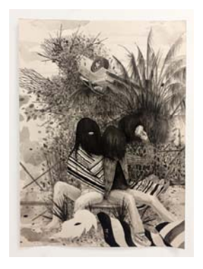
Eric Ramos Guerrero, Lean Like a Camaro , 2016. Graphite and ink on paper. 14 x 20 inches.