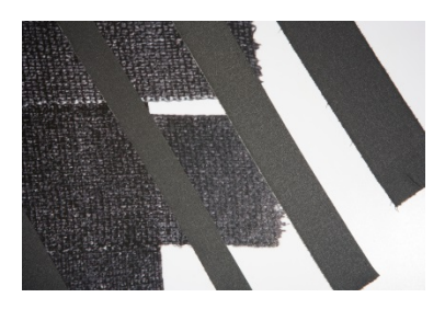
Nsenga Knight, Untitled (Plateau #1) , 2016. Archival inkjet print. 32 X 40 inches.