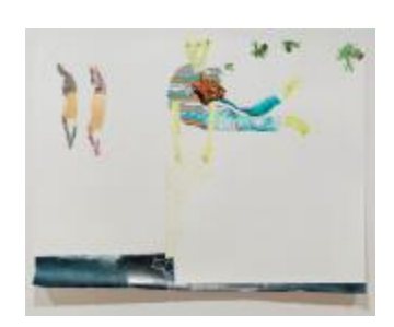
ruby onyinyechi amanze, The Divers , 2016. Graphite, ink, photo transfers, fluorescent acrylic, colored pencils. 38 x 50 inches. Courtesy of the artist.

For further information and images, please contact Molly Gross, Communications Director , The Drawing Center 212 219 2166 x119 | mgross@drawingcenter.org