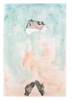
Heather Hart, Oracle of Generosity: Hatim's Rooftop , 2014, 30" x 22", Watercolor monoprint, etching, aquatint, chine-collé, gold, participation, courtesy the artist.