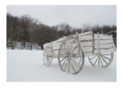
Jimbo Blachly, Drawing Wagon , 2015, Paper, ink, wood, Dimensions variable.