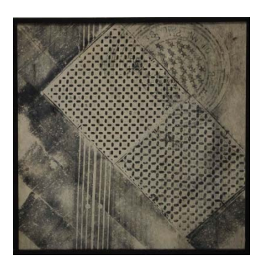
Sari Dienes, Tred Squares , c. 1953–1955, Ink on webril, 36 x 36 inches.