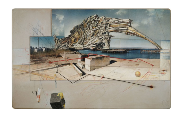
Lebbeus Woods, San Francisco Project: Inhabiting the Quake, Quake City, 1995. Graphite and pastel on paper, 14 1/2 in. x 23 in. x 3/4 in. (36.83 cm x 58.42 cm x 1.91 cm). Collection SFMOMA, Accessions Committee Fund purchase; © Estate of Lebbeus Woods