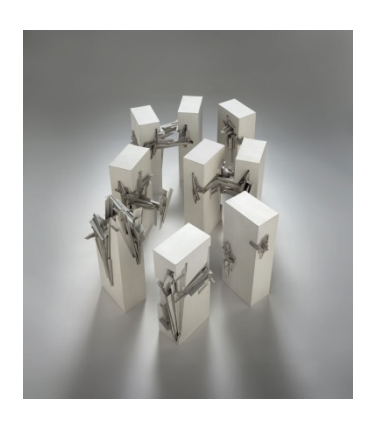
Lebbeus Woods, Nine Reconstructed Boxes , 1999. Plastic models and ten sketches, 11 in. x 8 1/2 in. (27.94 cm x 21.59 cm). Collection SFMOMA, Accessions Committee Fund purchase; © Estate of Lebbeus Woods; photo: Ben Blackwell