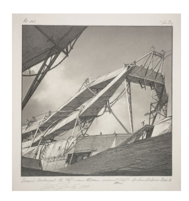
Lebbeus Woods, Unified Urban Field , from the series Centricity [no. 37], 1987. Graphite on paper, 24 in. x 23 in. (60.96 cm x 58.42 cm). Collection SFMOMA, purchase through a gift of Ned and Catherine Topham and the Accessions Committee Fund; © Estate of Lebbeus Woods