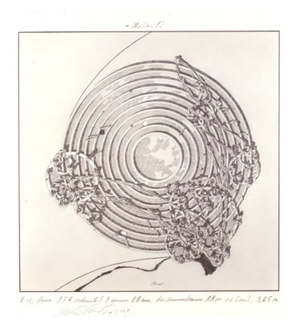
Lebbeus Woods, Concentric Field , from the series Centricity , 1987. Graphite on paper, 23 in. x 24 in. (58.42 cm x 60.96 cm). Collection SFMOMA, purchase through a gift of the Members of the Architecture + Design Forum, SFMOMA Architecture and Design Accessions Committee, and the architecture and design community in honor of Aaron Betsky, Curator of Architecture, Design and Digital Projects, 1995–2001; © Estate of Lebbeus Woods

For further information and images, please contact Molly Gross, Communications Director , The Drawing Center 212 219 2166 x119 | mgross@drawingcenter.org