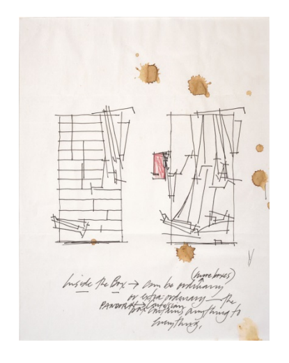
Lebbeus Woods, Untitled , sketch for the series Nine Reconstructed Boxes , 1999. Ink on paper, 8 1/2 in. x 11 in. (21.59 cm x 27.94 cm); Collection SFMOMA, Accessions Committee Fund purchase; © Estate of Lebbeus Woods