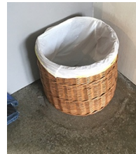
Drip fountain Medical dosing pump, vinyl tubing, basket, garbage bag Dimensions variable Basket: 15 x 16" (dia.)