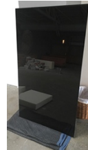
Ebony mirror 62 x 36"