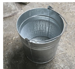
Metal bucket 11 x 12" (dia)