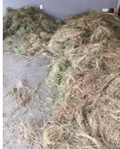
Grass from Presidio decommissioned military site Dimensions variable

All objects in installation exist as single artwork titled cast for a folly , 2019