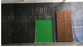
Digitally printed Sharkstooth Scrim fabric wall 14' 6" x 42' 6"