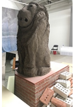
Lion with base Soil, straw, sand, plywood, steel armature, brick, mortar Lion: 59 x 29" (dia.) Base: 30 x 55.5 x 39.5"