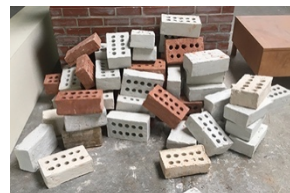
Clay bricks 47 bricks, 11.5 x 7 x 4" each