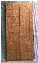
Gate OSB, stain, steel supports 120 x 64"