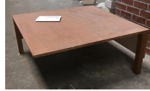
Square table Wood, stain 16 x 36 x 36"