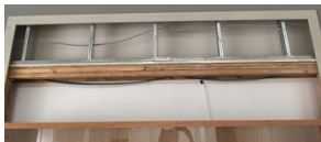
False doorway 122 x 110 x 10"