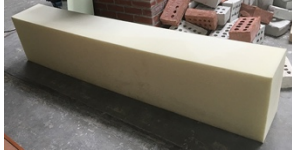
Foam 19 x 13 x 96"