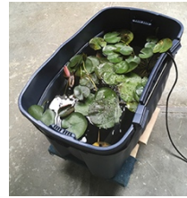
Water lily fountain Carpet end furniture dolly, plastic storage container, submersible pond pump, rubber hose, two water lillies 23 x 34 x 22"