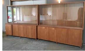
Two museum vitrines 84" x 96 x 24" each