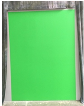
Green screen Paint 98 x 72"