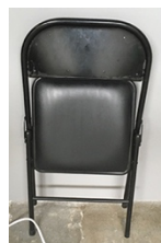
Folding chair 38 x 18"