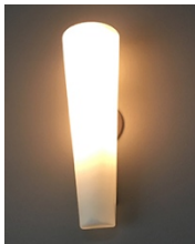
Two sconces 18.5 x 5.75 x 4.875" each