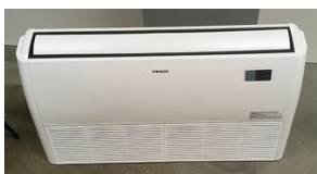
Split air conditioner 27.5 x 51 x 7"