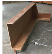
Two benches Wood, stain 32 x 32 x 84" each