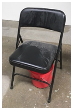
Folding chair with bucket Bucket: 10.5 x 11.5" (dia)