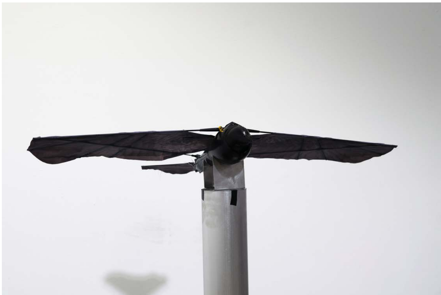
ERIC WESLEY Heseus , 2018 Detail