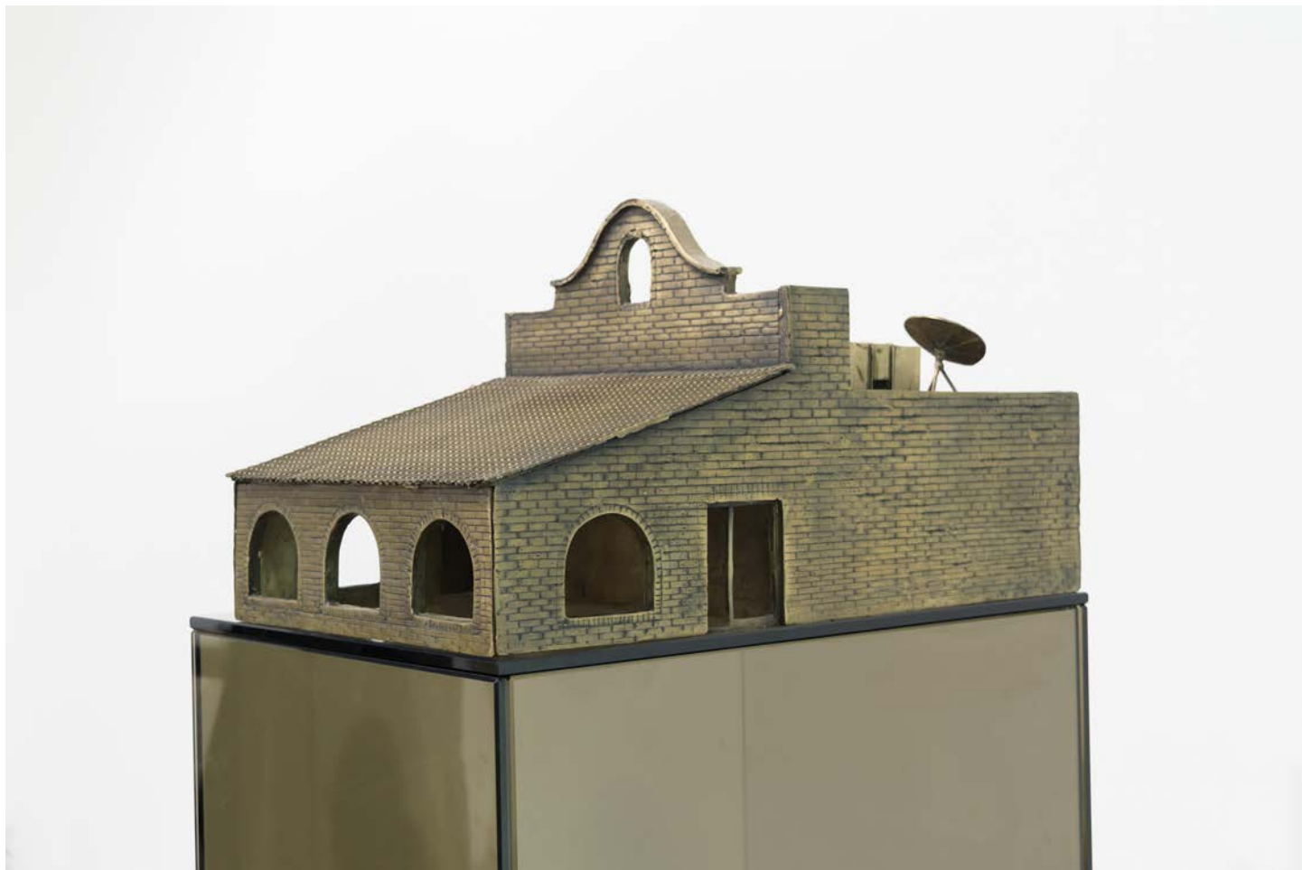
ERIC WESLEY La Belle , 2016 Alternate view