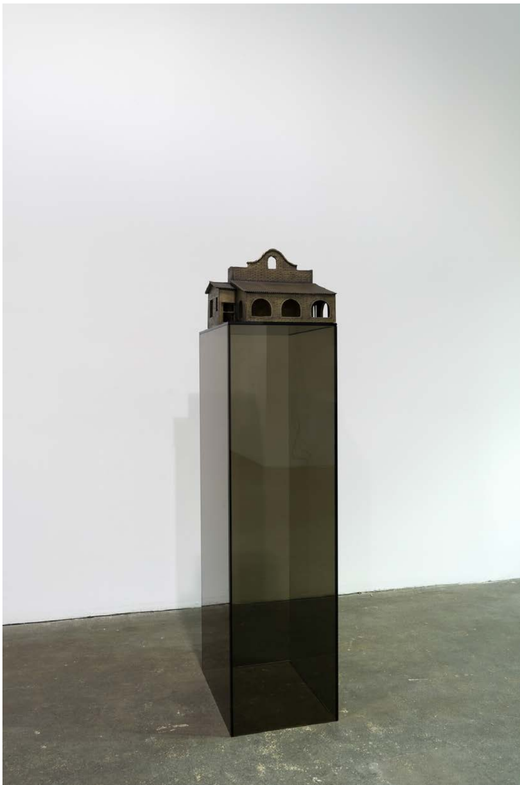
ERIC WESLEY La Belle , 2016 Alternate view