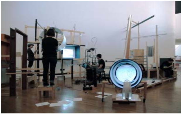
Jewyo Rhii and Jihyun Jung, Dawn Breaks 2015 , 2015 Installation view of Queens Museum, NY