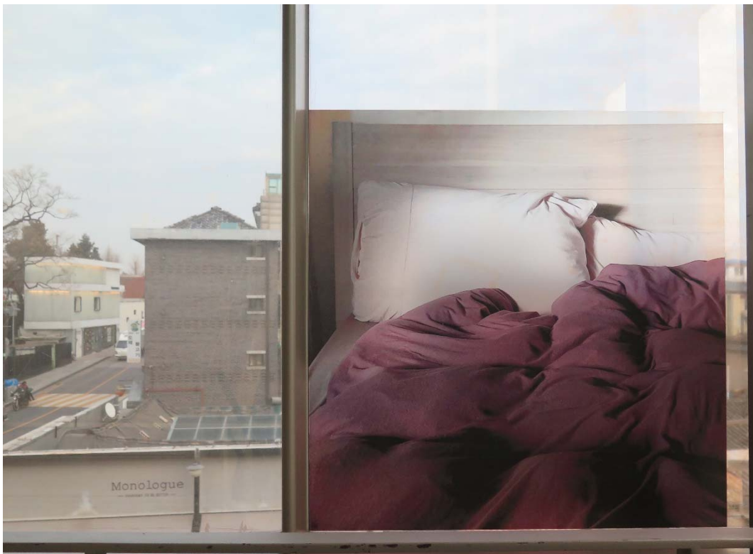
Lee Kit, Resonance of a sad smile , 2019, installation view.