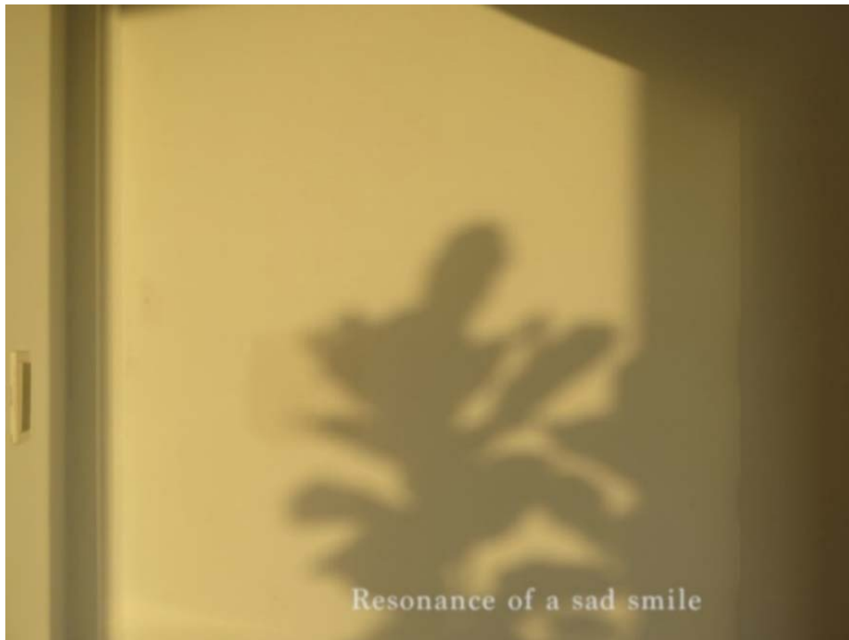
Lee Kit, Resonance of a sad smile , 2019.

Supported by Arts Council Korea, ISU Group