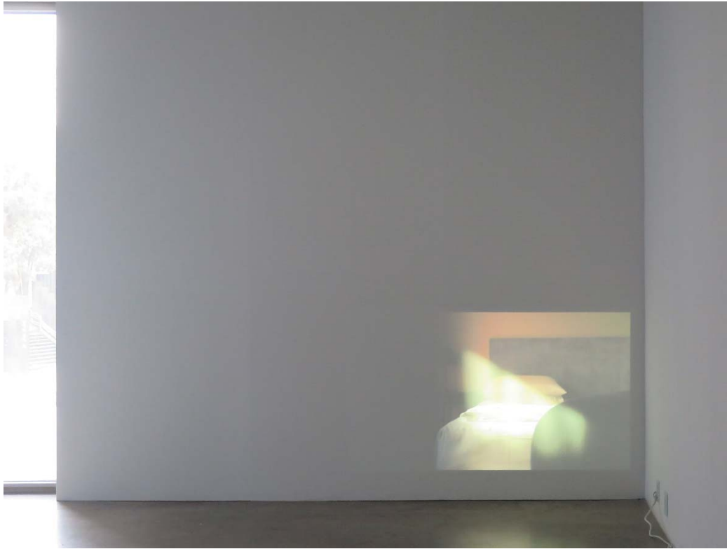
Lee Kit, Untitled (about chewing) , 2019, looped video, dimensions variable.