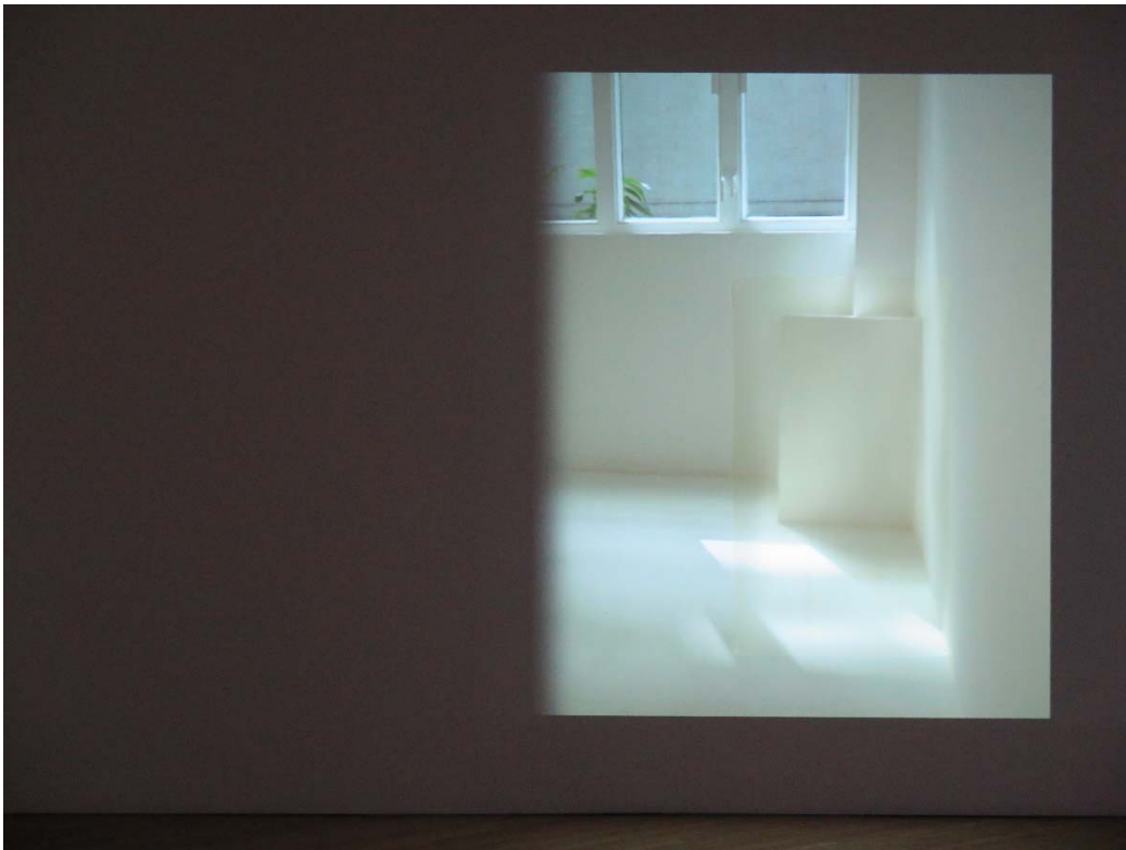
Lee Kit, Resonance of a sad smile , 2019, installation view.