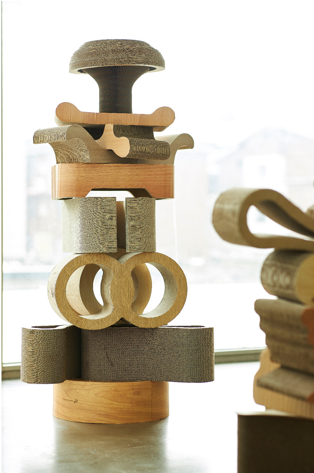
Donghee Koo, Delivery (2019), Installation view, Art Sonje Center.