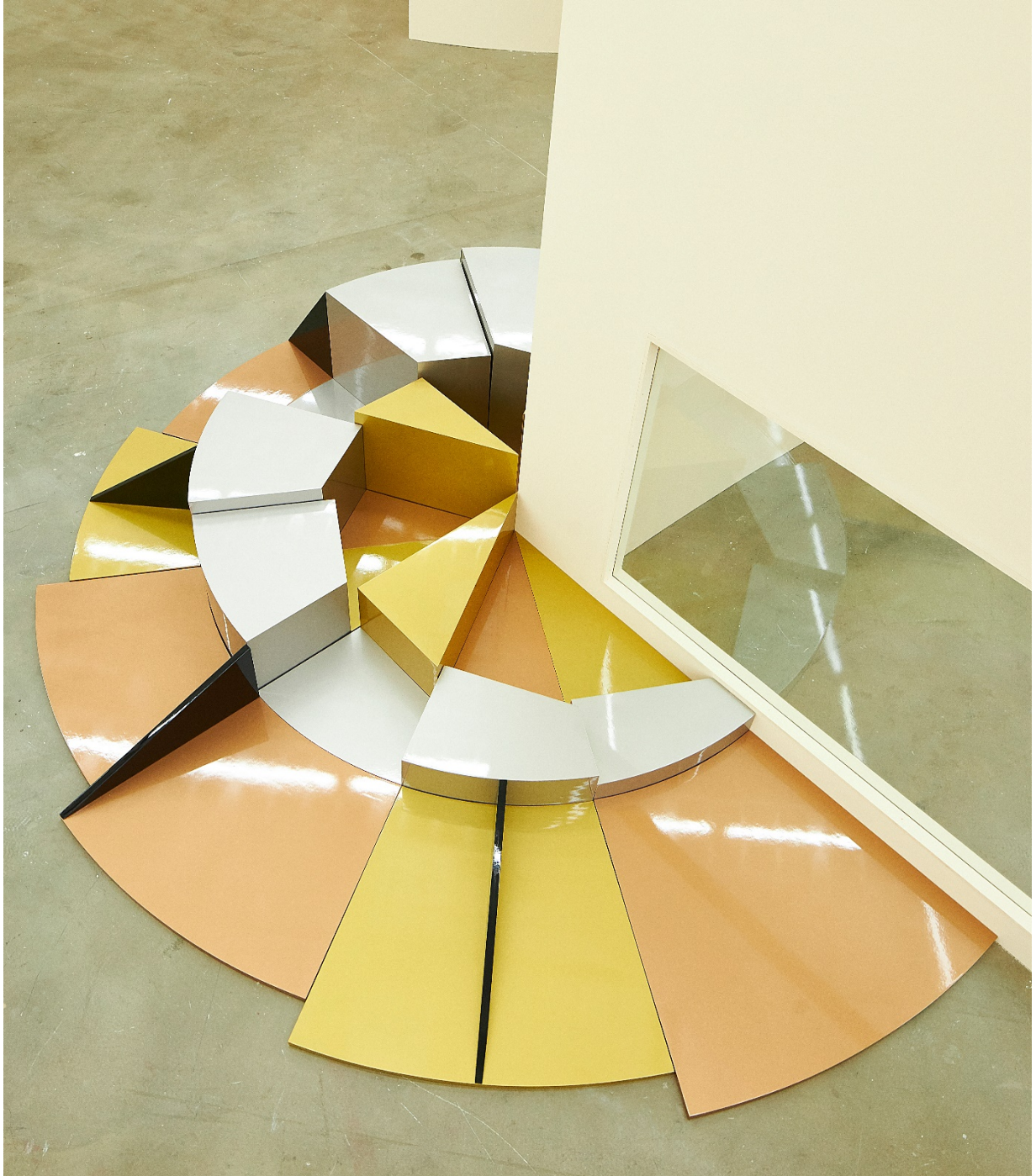
Donghee Koo, Delivery (2019), Installation view, Art Sonje Center.