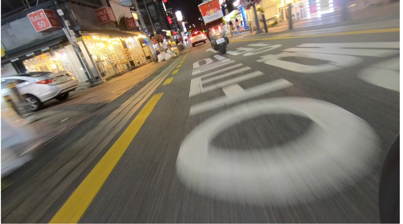
Donghee Koo, Delivery (still), 2019. Video.