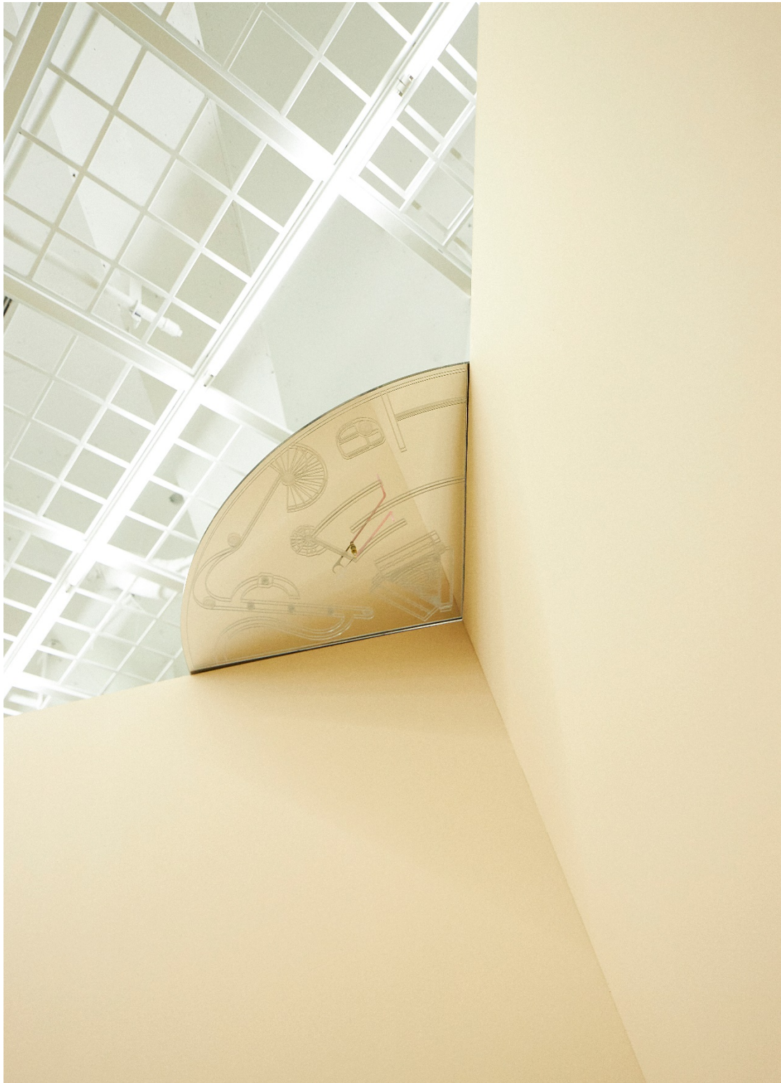
Donghee Koo, Delivery (2019), Installation view, Art Sonje Center.