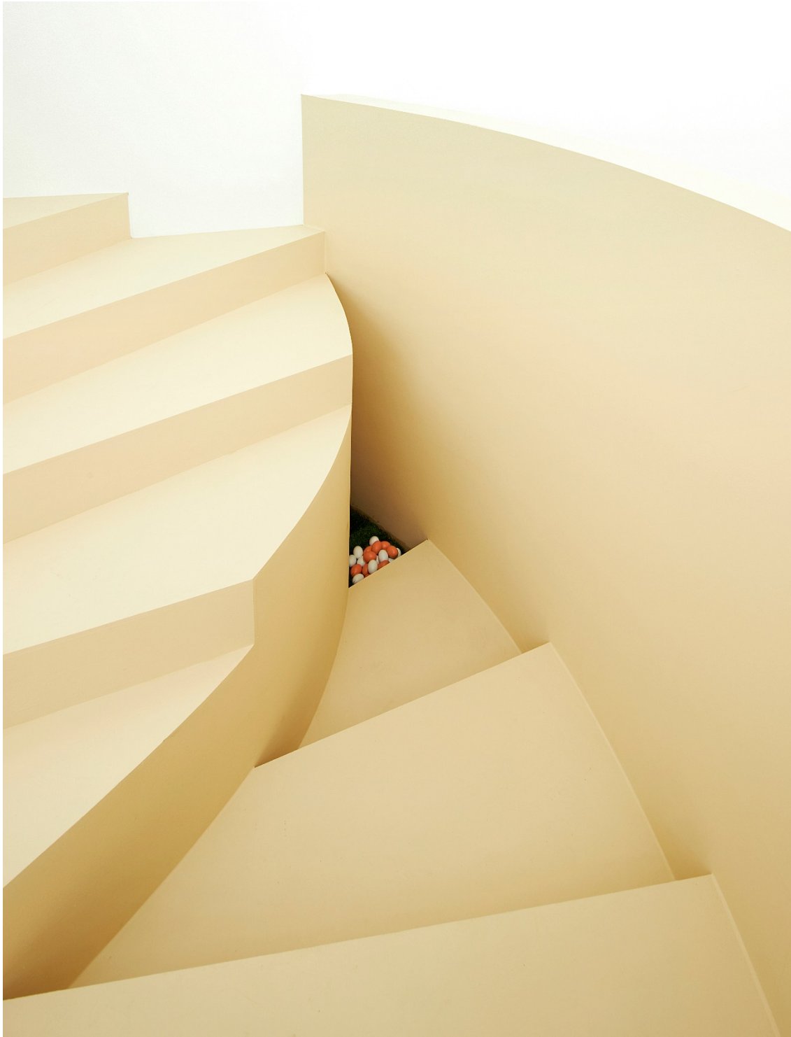
Donghee Koo, Delivery (2019), Installation view, Art Sonje Center.