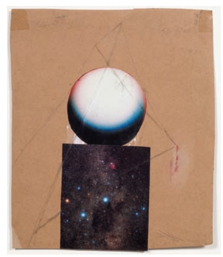
STERLING RUBY, Sphere and Pedestal, 2007. Collage on cardboard, 13 \times 10 1/2 inches.