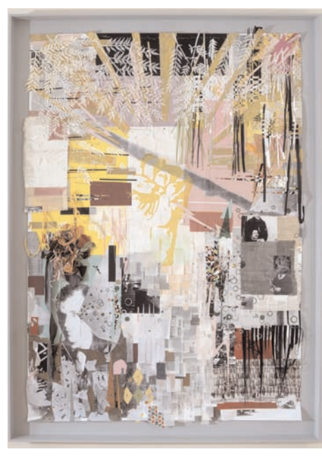
KIRSTINE ROEPSTORFF , Free , 2006. Paper, photocopy, cutouts, pearls, confetti, mylar, fabric, enamel paint, watercolor, and glue, 114 x 77 inches.

Prague Biennale 3, Prague, among others. Her work is included in a number of international collections, including the Judith Rothschild Foundation Collection of Contemporary Drawings, Museum of Modern Art, New York; The Royal Museum of Fine Art, Copenhagen; and the Saatchi Collection, London.