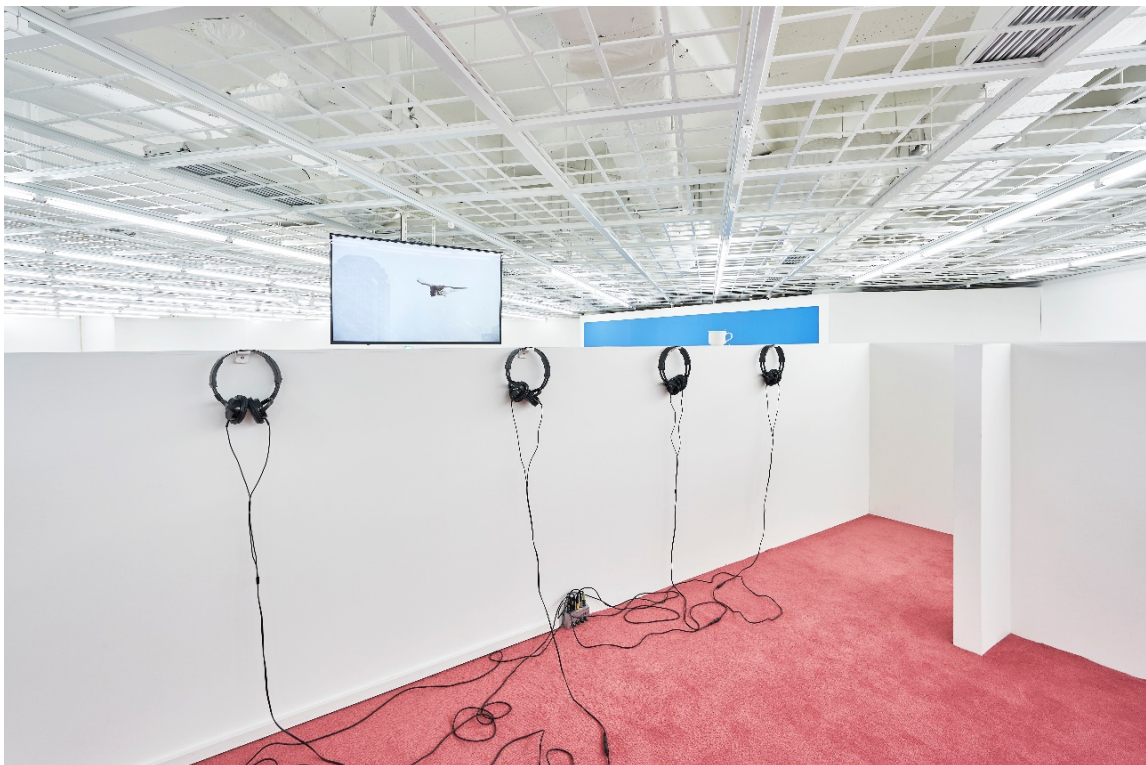
Song Min Jung, Window , Full HD, sound, 18min 16sec, 2019 (Genre : Drama)