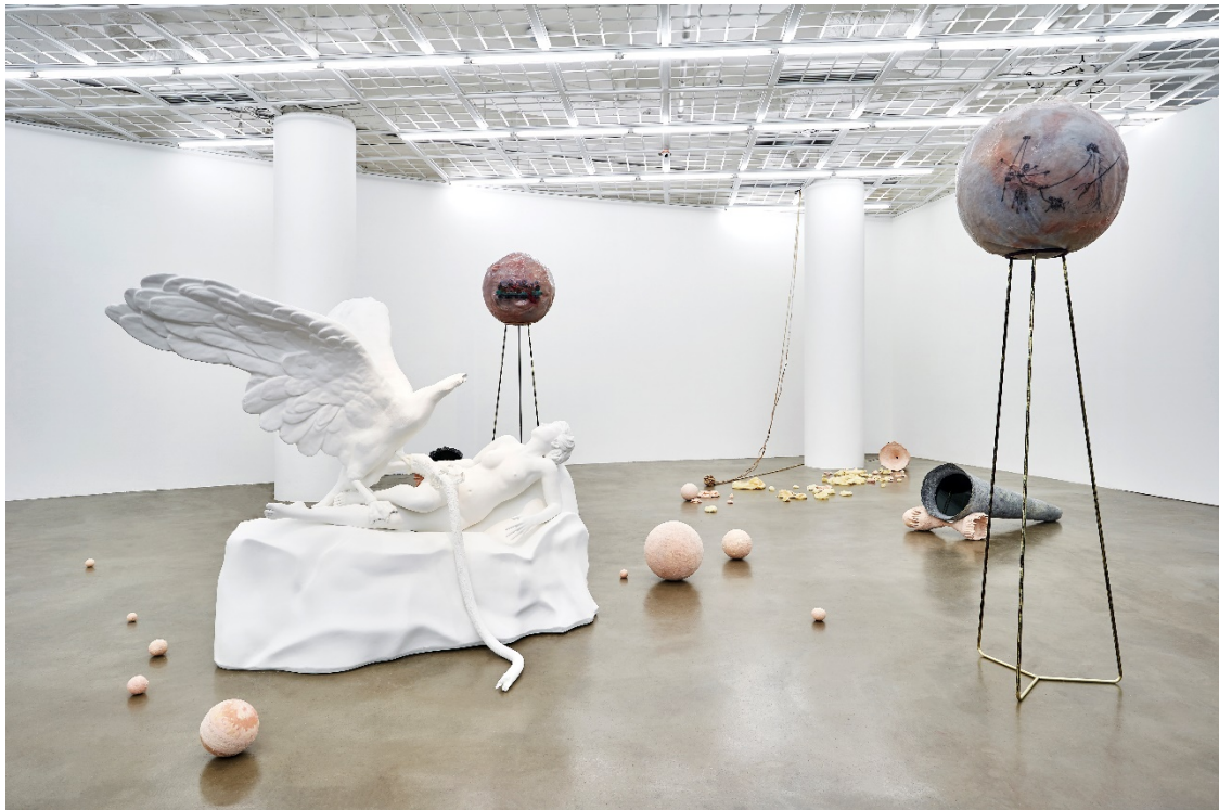
Jiyoung Yoon, Leda and the Swan , mixed media, 170x221x166 cm, 2019