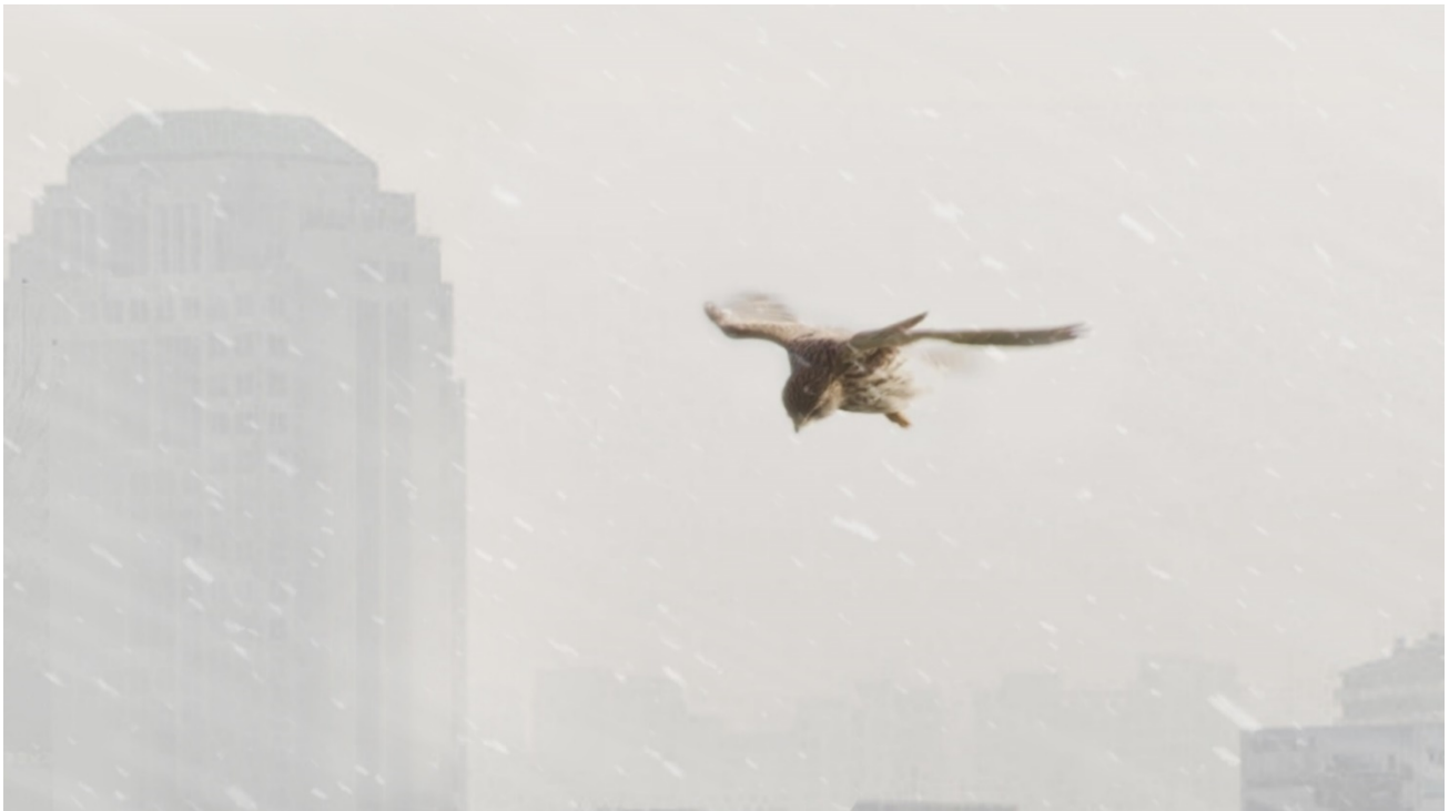
Song Min Jung, Window , 2019, Full HD, sound, color, 18mins 21secs, Image courtesy the artist.

Art Sonje Center is proud to present a new group exhibition Night Turns to Day from December 28, 2019 to February 9, 2020.