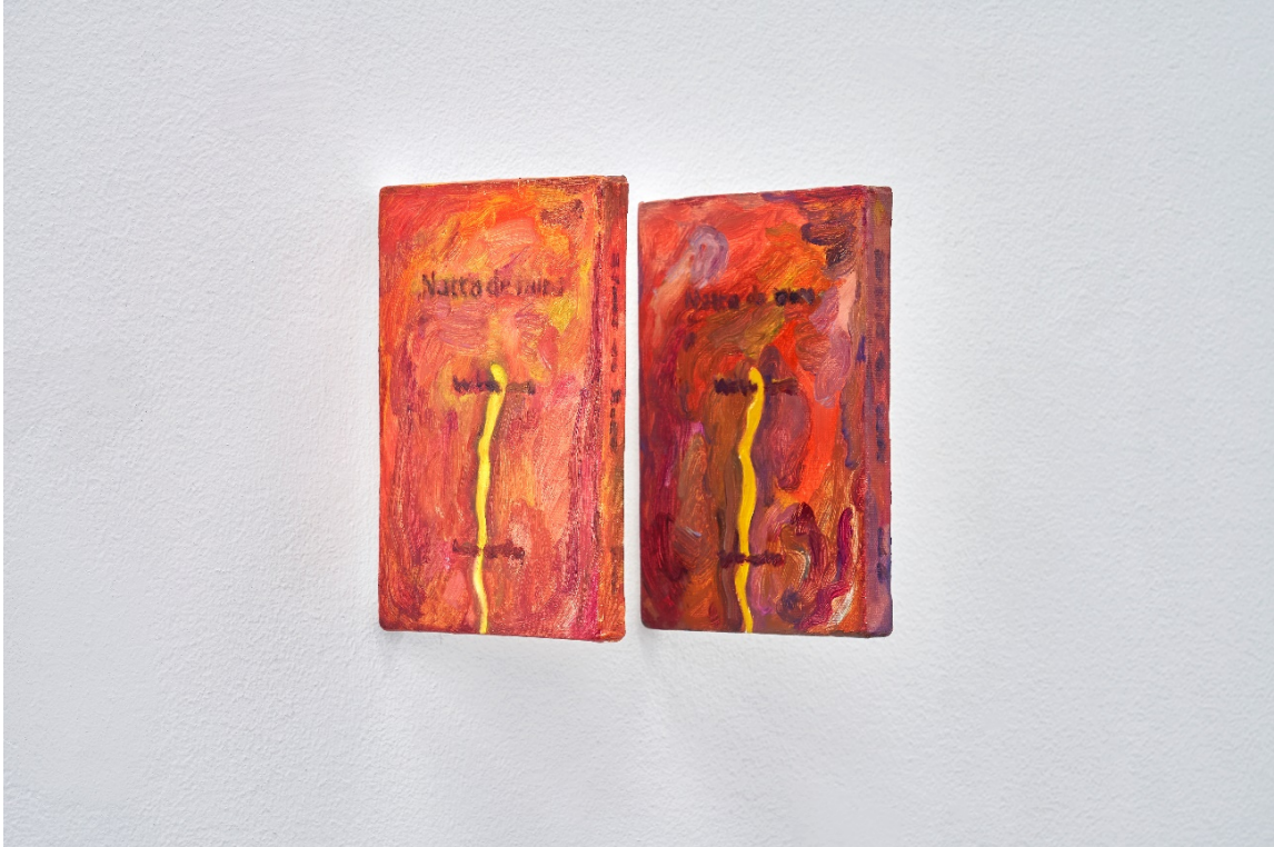
Hyein Lee, Natta de Mina , oil on canvas, 22.7x15.8 cm, 2 pieces, 2019