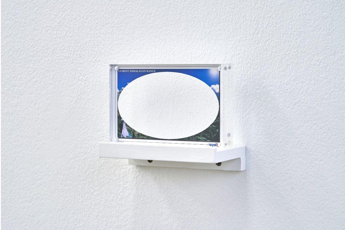
Chorong An, The Lake of Milk from Dew 2011 (Frame Ver.) , drum scan and digital print, 16x10 cm, 2019