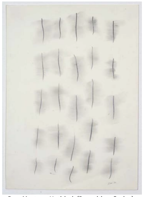
Ree Morton, Untitled (Repetition Series) , 1970. Pencil on paper, 14 x 10 inches. Estate of Ree Morton, Courtesy of Alexander and Bonin, New York and Annemarie Verna Galerie, Zürich.

Opening Reception: Thursday, September 17, 2009 6–8pm