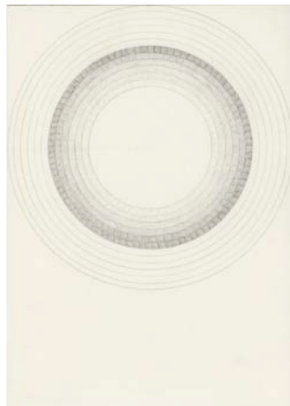
CW12: Claudia Wieser, Untitled , 2010. Pencil on paper, 11 11/16 x 8 1/4 inches (29.7 x 21 cm).