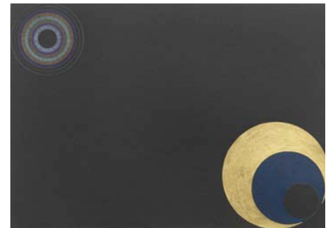
CW6: Claudia Wieser, Untitled , 2010. Colored pencil and gold leaf on colored paper, 8 1/4 x 11 11/16 inches (21 x 29.7 cm). Courtesy of the artist and Sies + Höke.