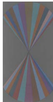
CW1: Claudia Wieser, Untitled , 2010. Colored pencil on colored paper, 27 9/16 x 13 3/4 inches (70 x 35 cm). Courtesy of the artist and Sies + Höke.