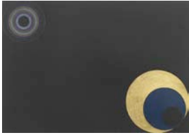
Claudia Wieser, Untitled , 2010. Colored pencil and gold leaf on colored paper, 8 1/4 x 11 11/16 inches (21 x 29.7 cm).