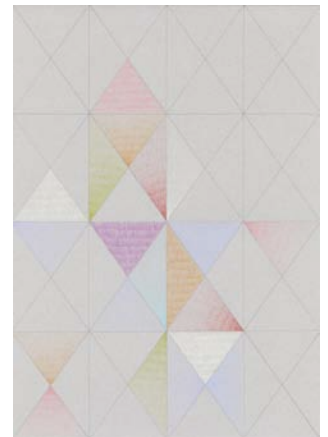
CW13: Claudia Wieser, Untitled , 2010. Colored pencil on colored paper, 11 11/16 x 8 1/4 inches (29.7 x 21 cm).