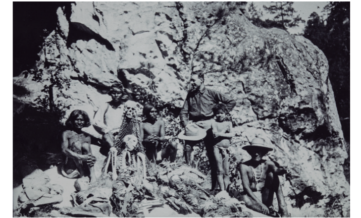
Rudolf Zabel, Photograph of the Tarahumaran Sierra, 1925. Black and white photograph on glass plates.

Up until now I have been an artist, which is to say, I have been a manipulated man. "Lo que vine a hacer a México" (What I Came to Do in Mexico, El Nacional , 1936), Antonin Artaud