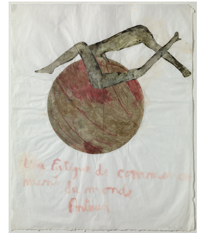
Nancy Spero, Artaud Painting – Une fatigue de commencement du monde , 1970. Gouache, ink and collage on paper. © The Nancy Spero and Leon Golub Foundation for the Arts/Licensed by VAGA, New York, N. Fotografía: Gasull Fotografía. Courtesy of the Museu d’Art Contemporani de Barcelona (MACBA)

Reinforcing in each gallery the idea of a sudden dialog among objects—a Sierra of things—the exhibition’s rhythm is set by the presence, on each space, of an issue of El Nacional newspaper, on which Artaud would regularly write during his stay in Mexico. On this medium, the poet and playwright would capture his reflections on the contrast between European culture and modern-day Mexico, and between the aspirations of the artistic avant-garde and the potential of a past that is equally remote and imminent. Time and time again, poetic time clashes with historical time, drawing filigrees and paradoxical associations. For Artaud, the artwork was a hybrid between the document and the totem. Likewise, the selection of works and objects answers, in part, to a documentary interest on the spread of gestures which bear the sign of Artaud, implicitly or explicitly. On the other hand, the works often project a totemic presence, such as that of ritual emblems. Tracks and symbols, tools and visions cross their gazes within the space of Artaud 1936 .