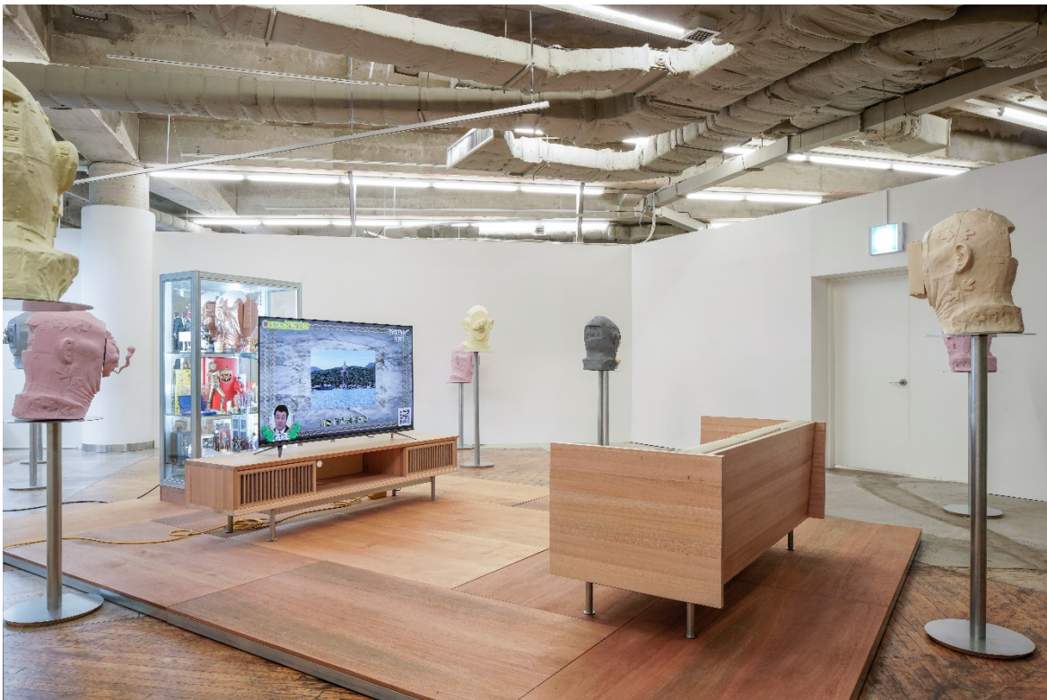
Don Sunpil, Portrait Fist , 2020, installation view, Art Sonje Center, Photo: Hong Chulki.