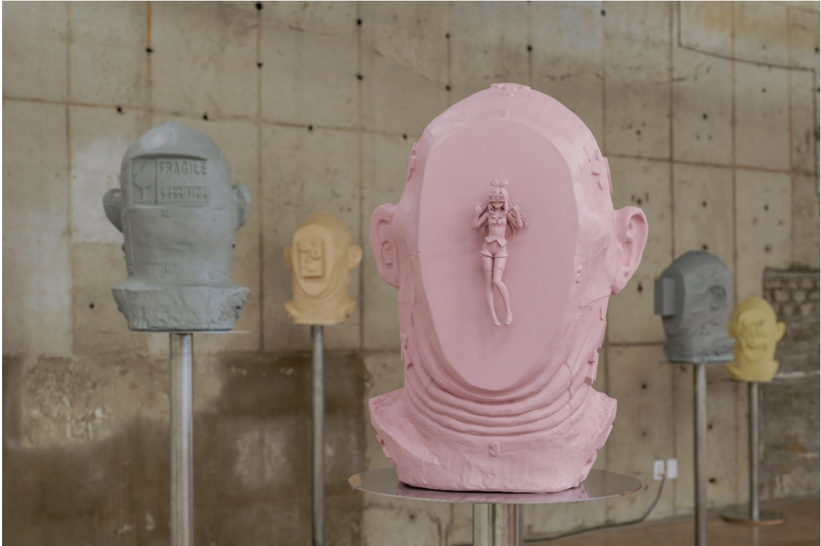
Portrait Fist (no.2) , 2020, ABS, resin, acrylic, figure, Polyurethane Foam, 550x400x450mm, Photo: Hong Chulki.