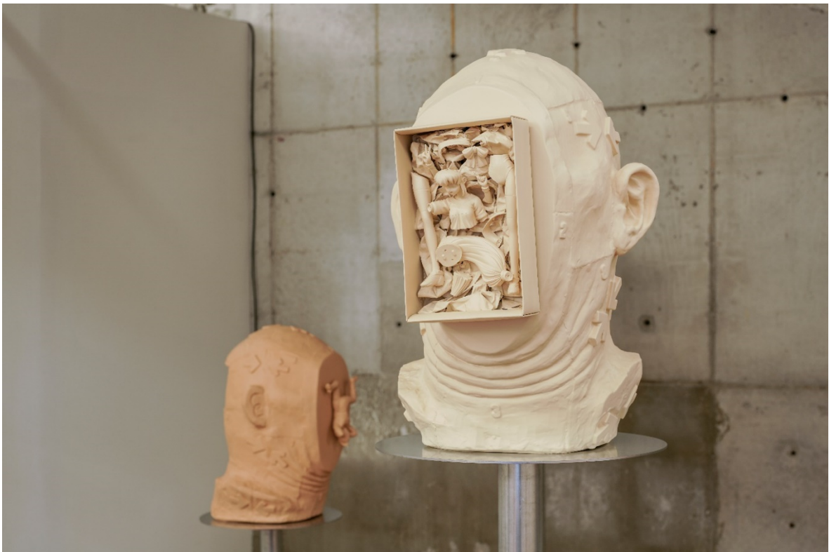
Portrait Fist (no.12) , 2020, ABS, resin, acrylic, figure, Polyurethane Foam, 550x400x450mm, Photo: Hong Chulki.