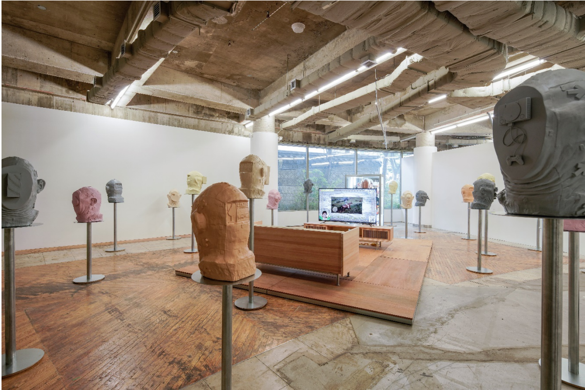
Don Sunpil, Portrait Fist , 2020, installation view, Art Sonje Center, Photo: Hong Chulki.