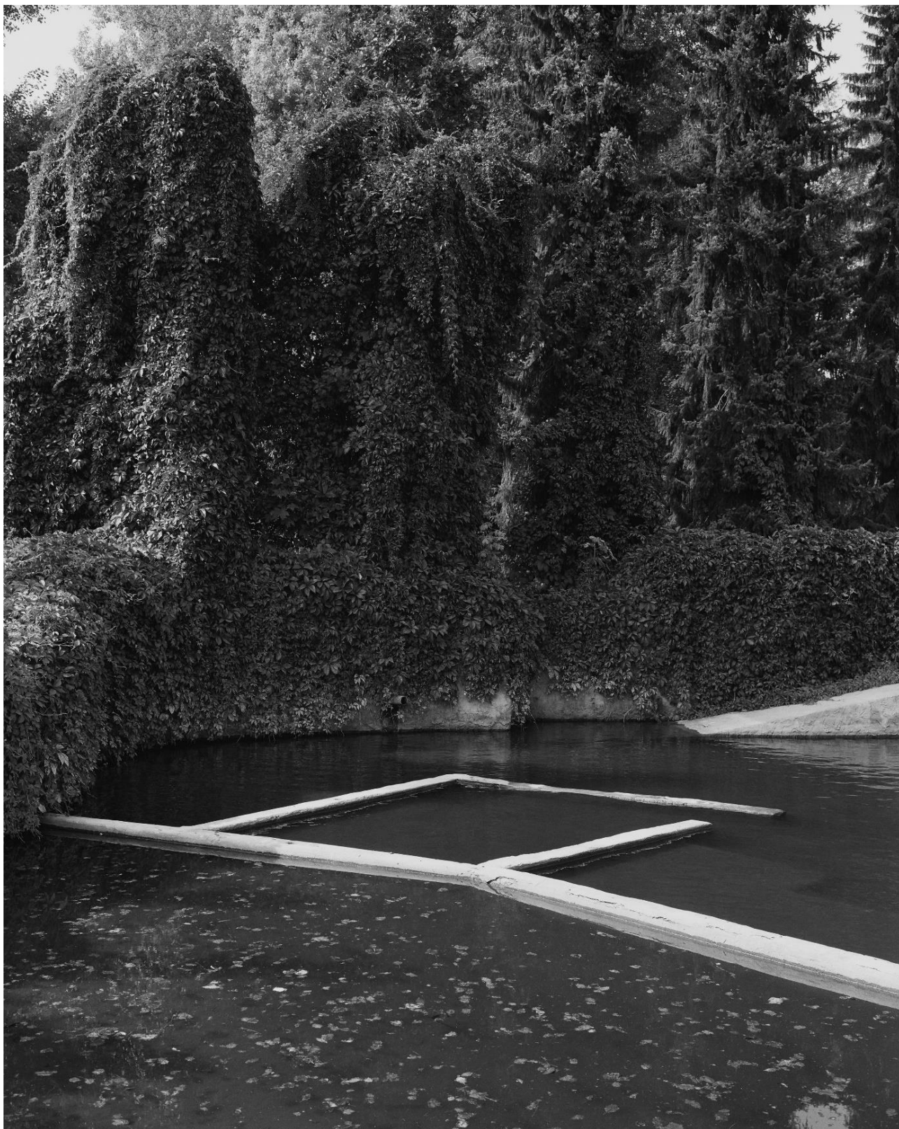
Joanna Piotrowska, Enclosure XXX , 2019.