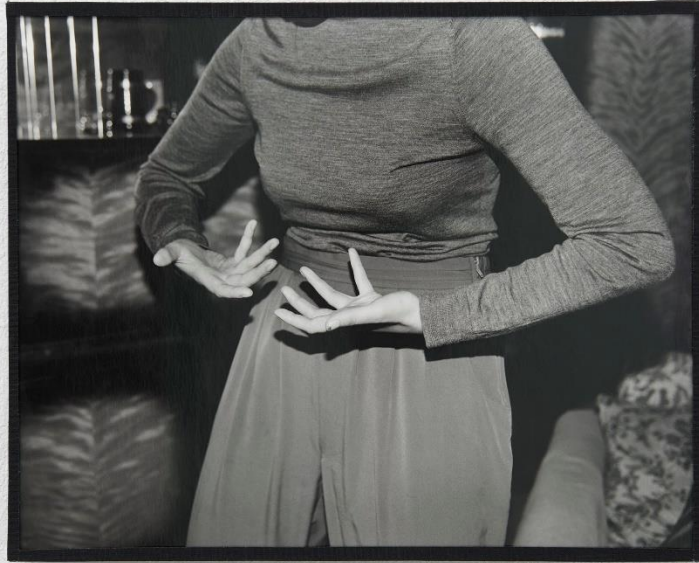
Joanna Piotrowska, Installationsansicht, Stable Vices , Kunsthalle Basel, 2019, Blick auf, Untitled , 2019.