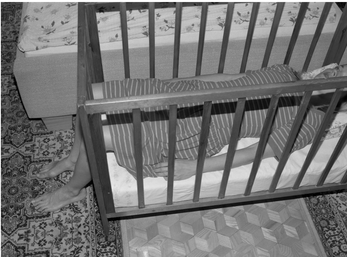
Joanna Piotrowska, Untitled , 2019.