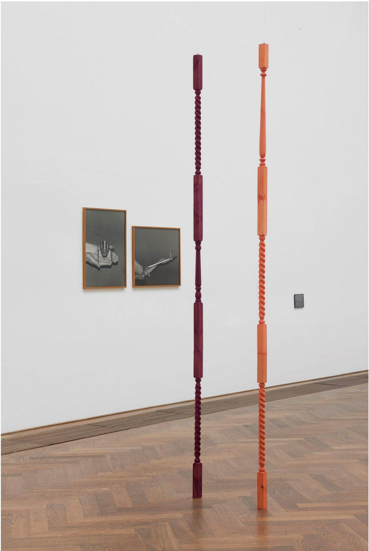
Joanna Piotrowska, Installationsansicht, Stable Vices , Kunsthalle Basel, 2019. Joanna Piotrowska, installation view, Stable Vices , Kunsthalle Basel, 2019.