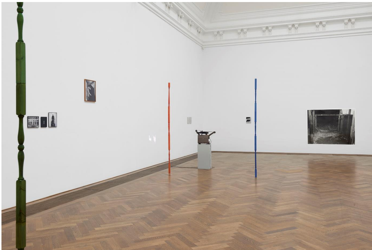
Joanna Piotrowska, Installationsansicht, Stable Vices , Kunsthalle Basel, 2019. Joanna Piotrowska, installation view, Stable Vices , Kunsthalle Basel, 2019.