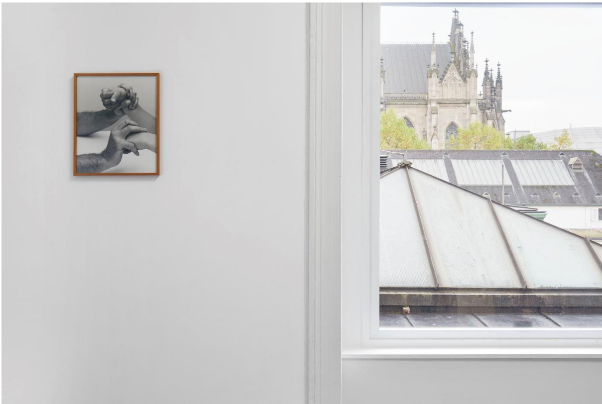
Joanna Piotrowska, Installationsansicht, Stable Vices , Kunsthalle Basel, 2019, Blick auf Untitled , 2014.