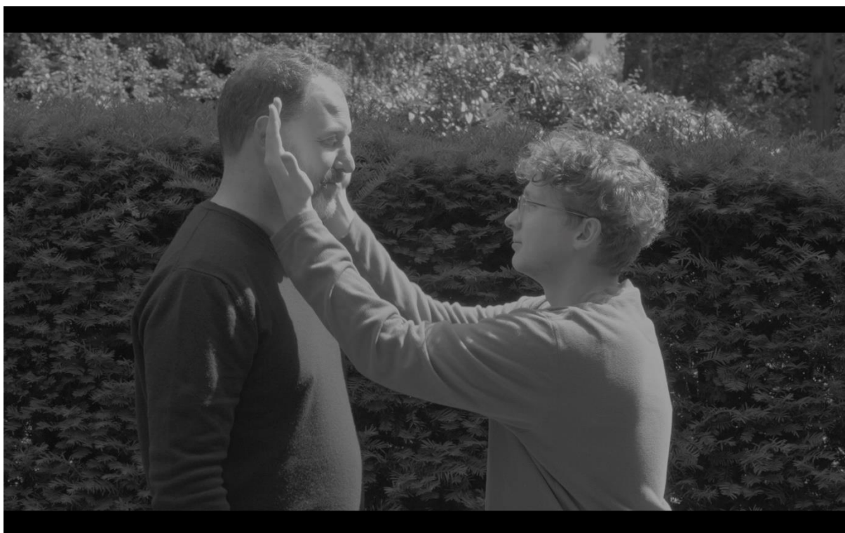
Joanna Piotrowska, Standbild , Little Sunshine , 2019. Joanna Piotrowska, video still, Little Sunshine , 2019.