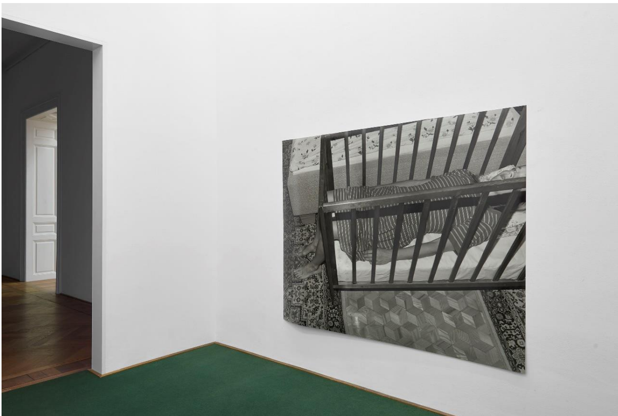
Joanna Piotrowska, Installationsansicht, Stable Vices , Kunsthalle Basel, 2019, Blick auf, Untitled , 2019.