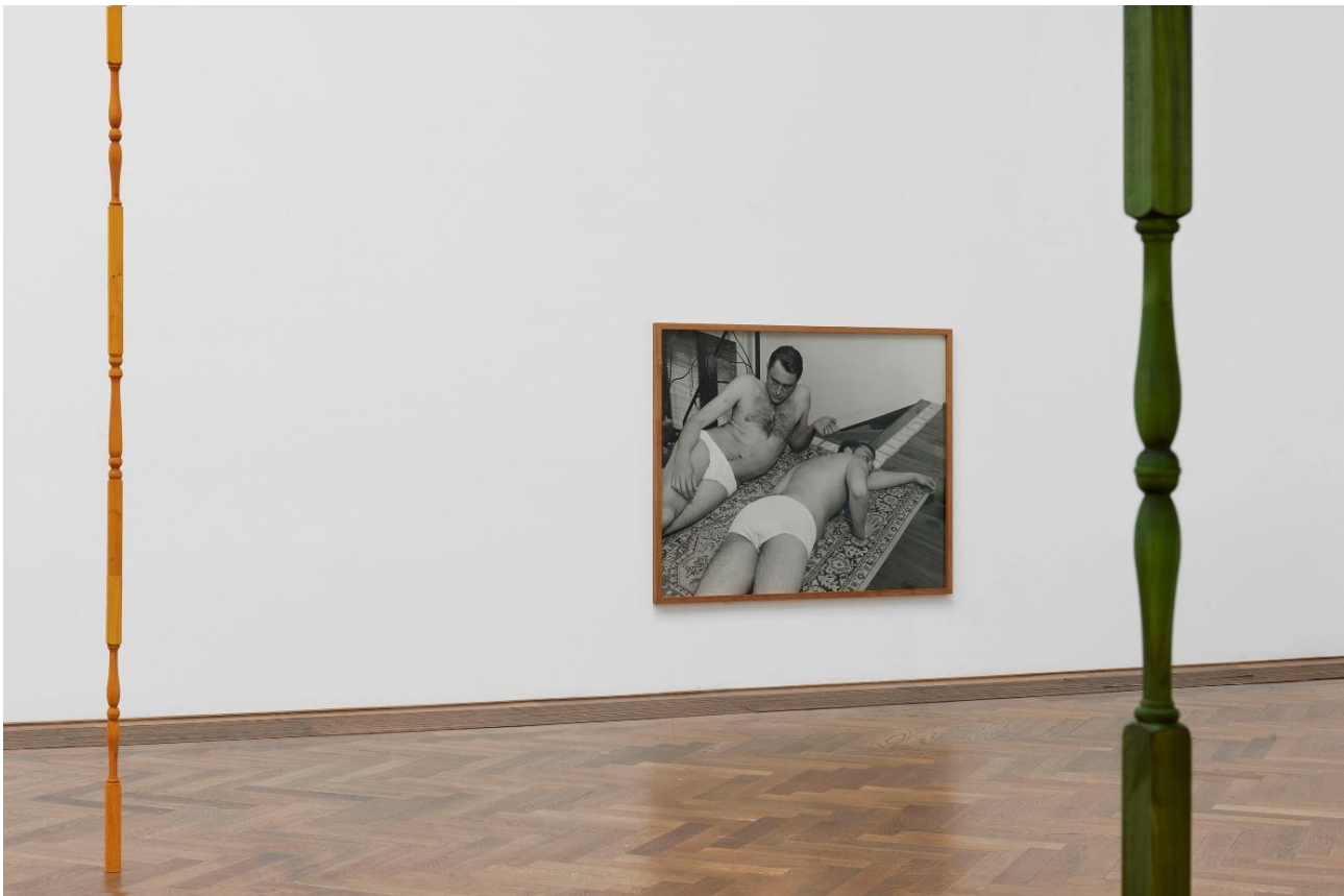
Joanna Piotrowska, Installationsansicht, Stable Vices , Kunsthalle Basel, 2019, Blick auf, Frowst I , 2013–2014. Joanna Piotrowska, installation view, Stable Vices , Kunsthalle Basel, 2019, view on, Frowst I , 2013–2014.