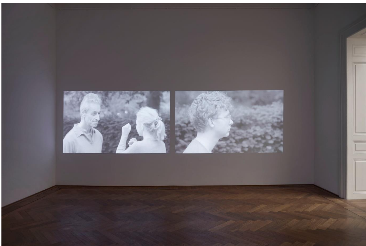
Joanna Piotrowska, Installationsansicht, Stable Vices , Kunsthalle Basel, 2019, Blick auf, Little Sunshine , 2019. Joanna Piotrowska, installation view, Stable Vices , Kunsthalle Basel, 2019, view on, Little Sunshine , 2019.