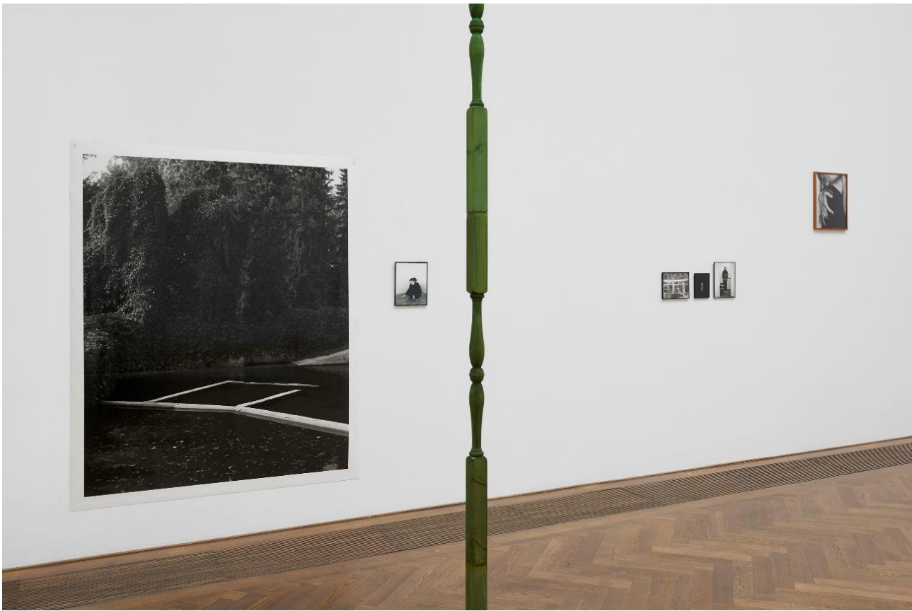
Joanna Piotrowska, Installationsansicht, Stable Vices , Kunsthalle Basel, 2019. Joanna Piotrowska, installation view, Stable Vices , Kunsthalle Basel, 2019.