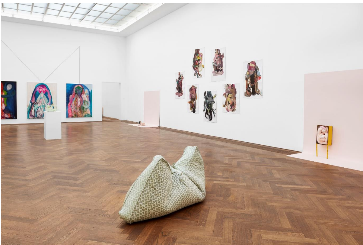
Installationsansicht, A Tooth for an Eye , Blick auf Luggage , 2018, von Dorian Sari (vorne), Kunsthalle Basel, 2018.