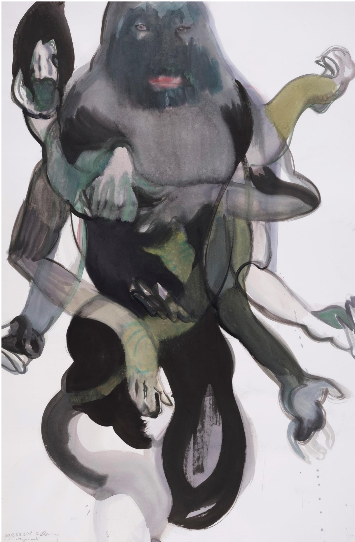
Simona Deflorin, aus der Serie/from the series Kali and the Cat , 2018