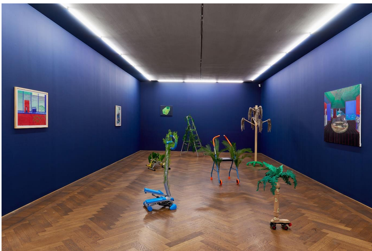
Installationsansicht, A Tooth for an Eye , Kunsthalle Basel, 2018.