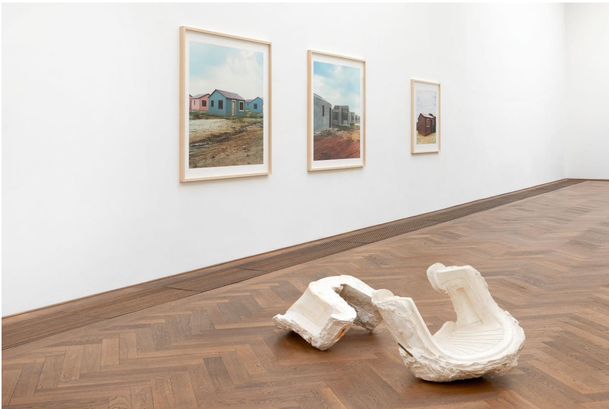
Installationsansicht A Tooth for an Eye , Blick auf Monobloc , 2017, von Jeronim Horvat (vorne) und Everyone lives in the same places like before , 2013–2016, von Claudio Rasano (hinten), Kunsthalle Basel, 2018.