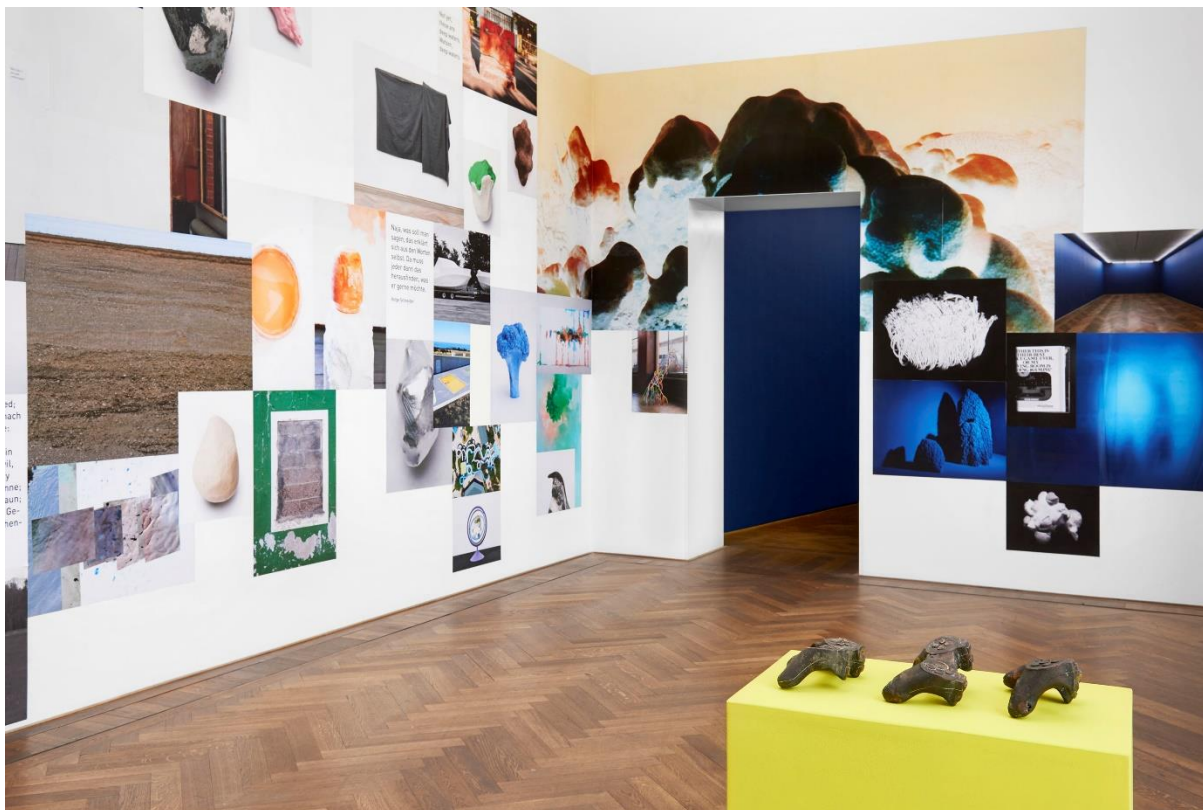
Installationsansicht A Tooth for an Eye, Blick auf PS1 , 2017, von Jeronim Horvat (vorne) und Es gibt NUDE – und es gibt NAKED , 2018-fortlaufend, von Philipp Hänger (hinten), Kunsthalle Basel, 2018.