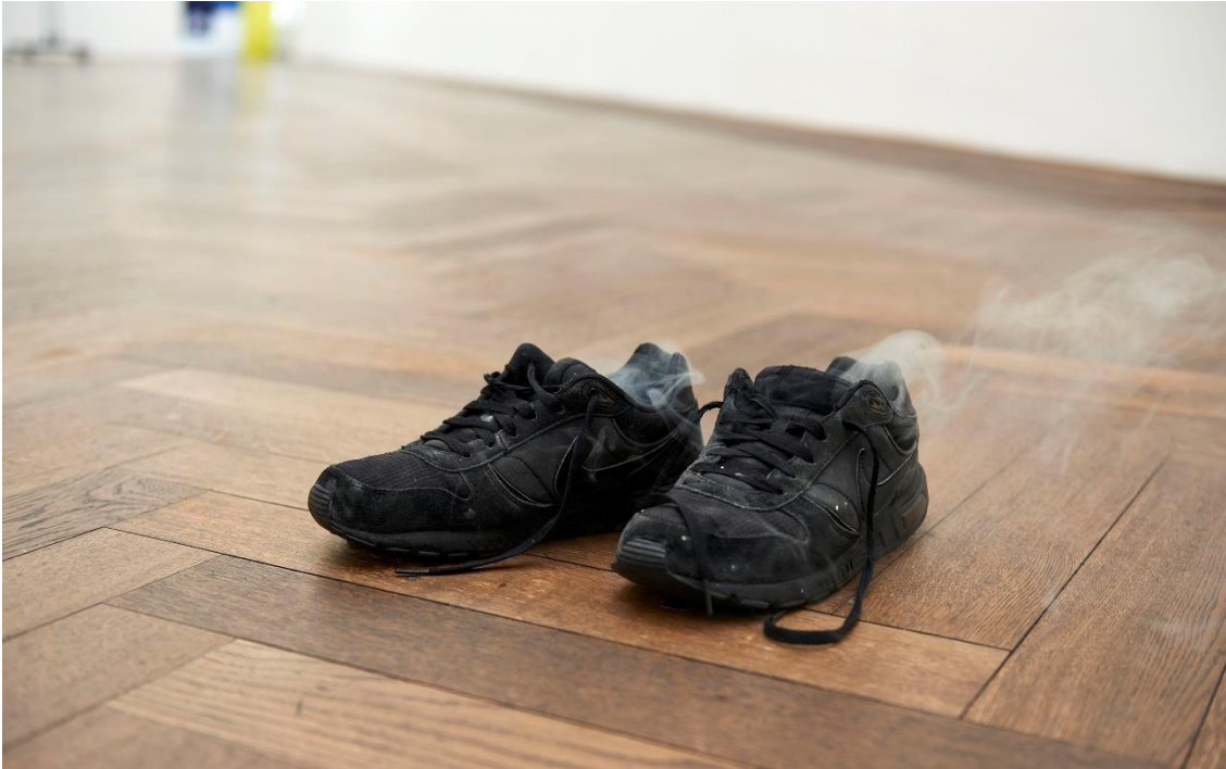
Installationsansicht A Tooth for an Eye , Blick auf Self Portrait , 2017, von Daniel Kurth, Kunsthalle Basel, 2018. Installation view A Tooth for an Eye , view on Self Portrait , 2017, by Daniel Kurth, Kunsthalle Basel, 2018.

Pressebilder / Press Images Download-Link: kunsthallebasel.ch/presse/