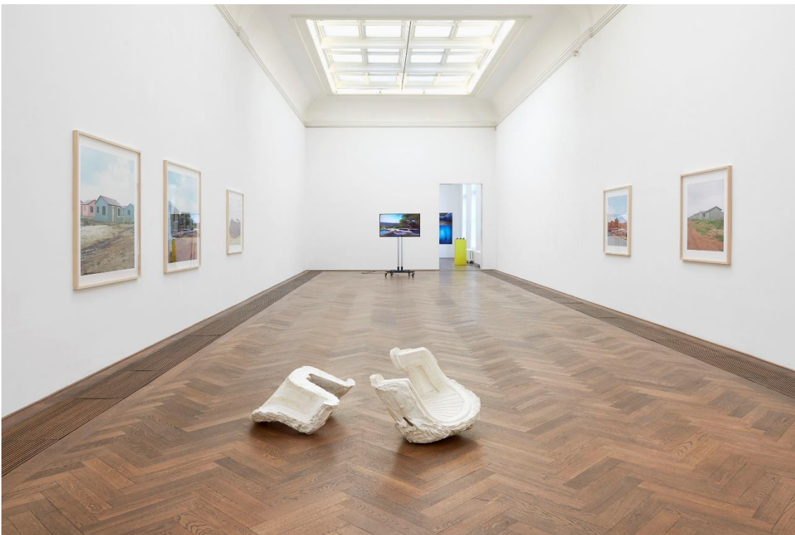
Installationsansicht, A Tooth for an Eye , Kunsthalle Basel, 2018. Installation view, A Tooth for an Eye , Kunsthalle Basel, 2018.