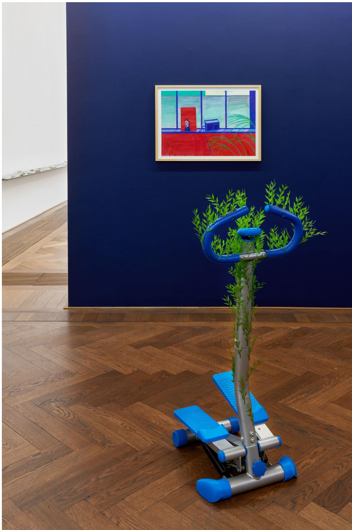
Installationsansicht A Tooth for an Eye , Blick auf Le Grand Tour a.k.a. Steppy , 2018, von Axel Gouala (vorne) und Autoportrait dans l'atelier , 2018, von Camille Brès (hinten), Kunsthalle Basel, 2018.