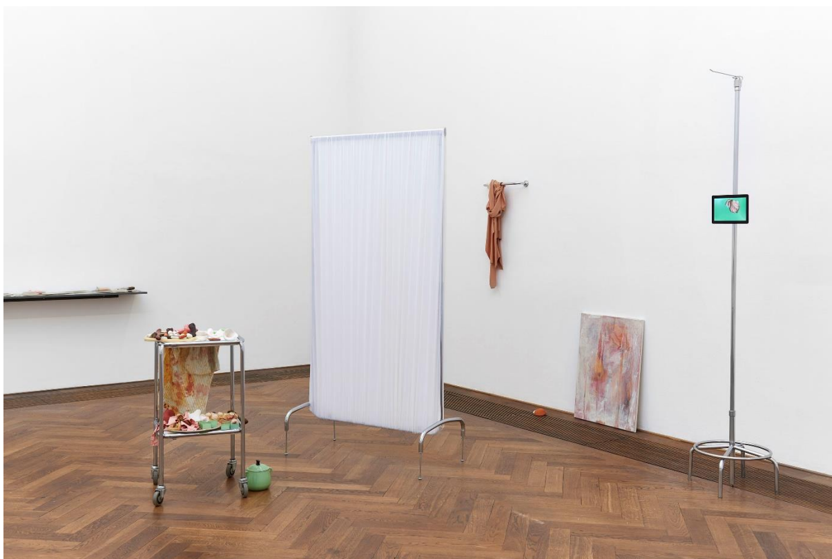
Installationsansicht A Tooth for an Eye , Blick auf Truth or Consequences—and the day, she lost her face , 2017, von Simone Steinegger, Kunsthalle Basel, 2018. Installation view A Tooth for an Eye , view on Truth or Consequences—and the day, she lost her face , 2017, by Simone Steinegger, Kunsthalle Basel, 2018.