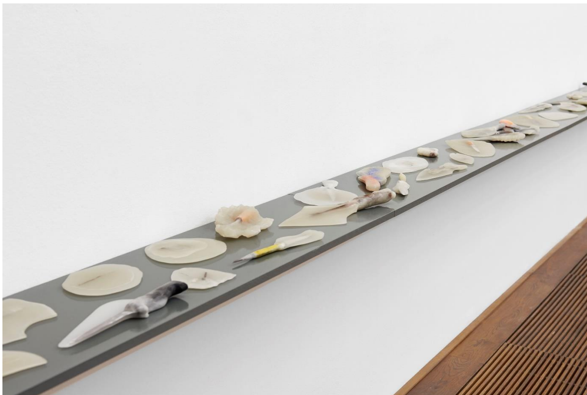
Installationsansicht A Tooth for an Eye , Blick auf Armes Blanches , 2017–2018, von Inès P. Kubler, Kunsthalle Basel, 2018. Installation view A Tooth for an Eye , view on Armes Blanches , 2017–2018, by Inès P. Kubler, Kunsthalle Basel, 2018.