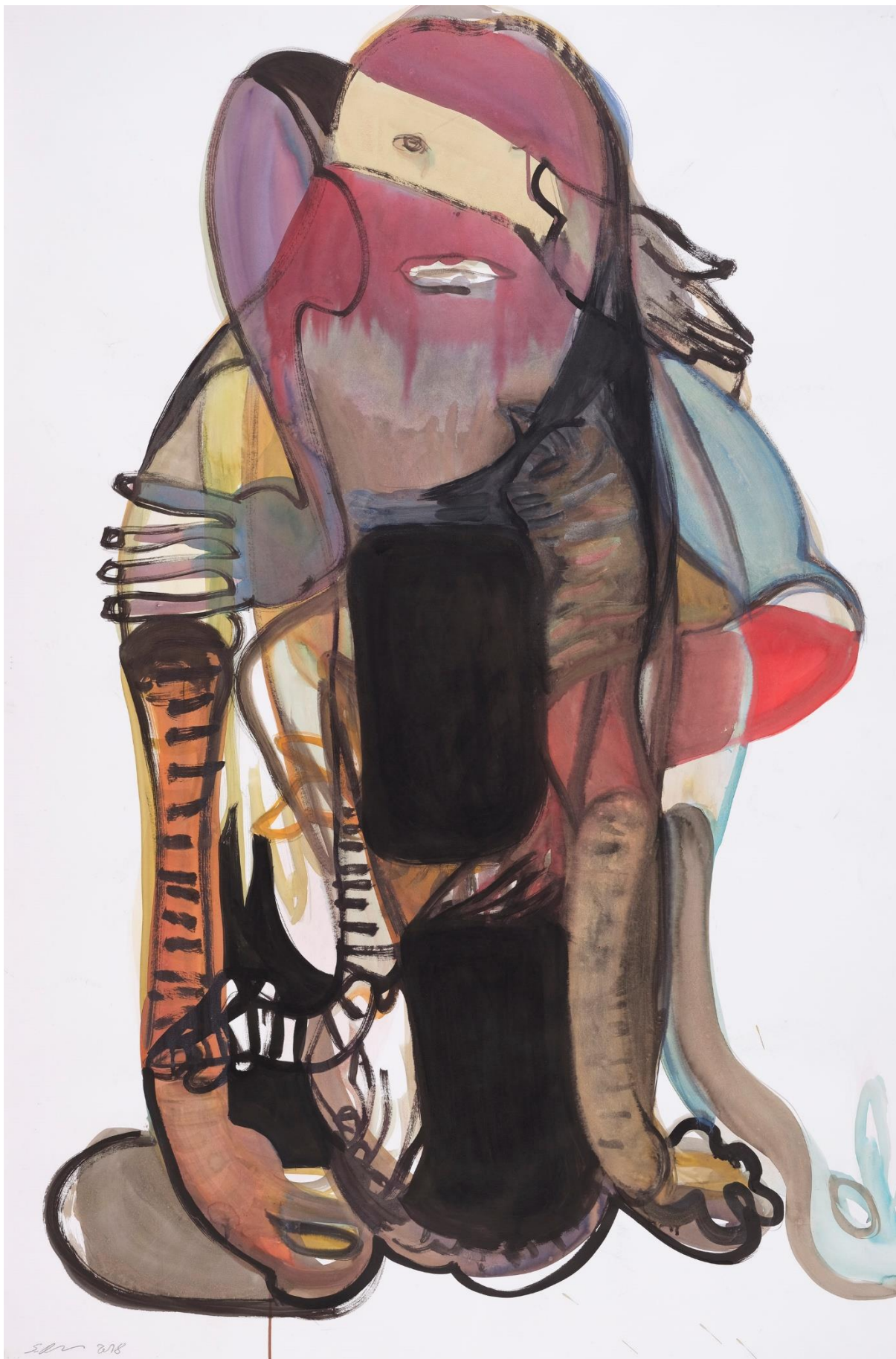
Simona Deflorin, aus der Serie/from the series Kali and the Cat , 2018