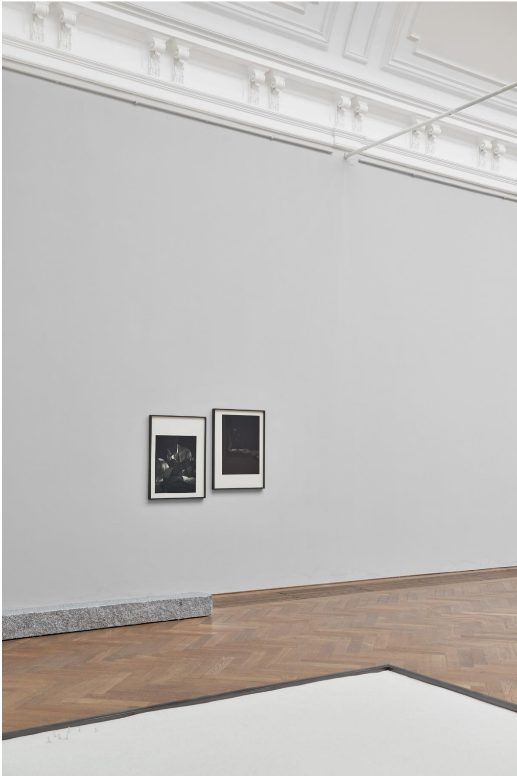
Yan Xing, Installationsansicht Dangerous Afternoon , Kunsthalle Basel, 2017.