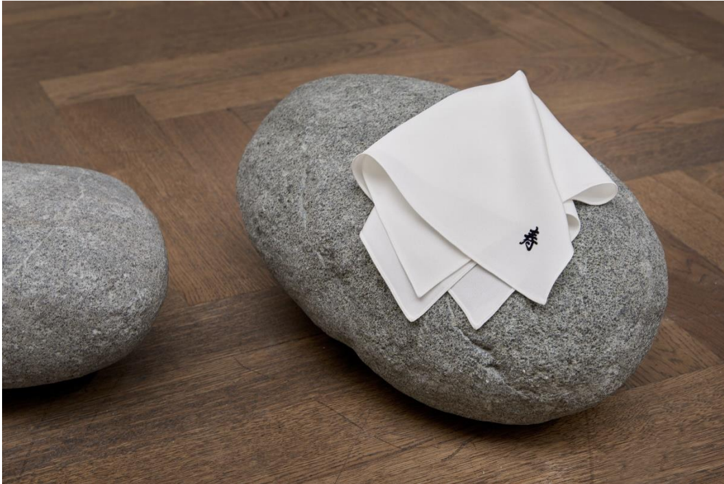
Yan Xing, Installationsansicht Dangerous Afternoon , Kunsthalle Basel, 2017.