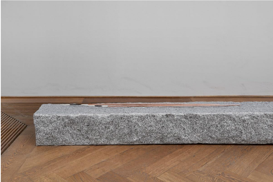
Yan Xing, Installationsansicht Dangerous Afternoon , Kunsthalle Basel, 2017.