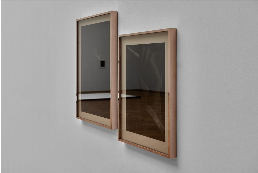
Yan Xing, Installationsansicht Dangerous Afternoon , Kunsthalle Basel, 2017.