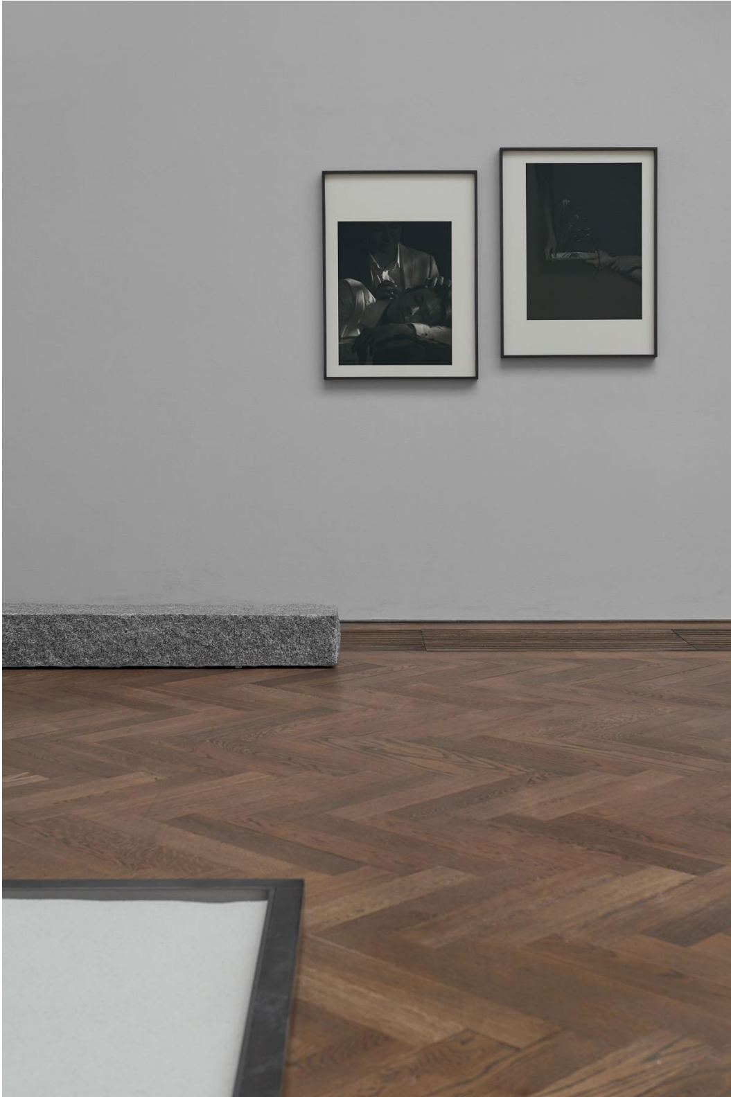
Yan Xing, Installationsansicht Dangerous Afternoon , Kunsthalle Basel, 2017.