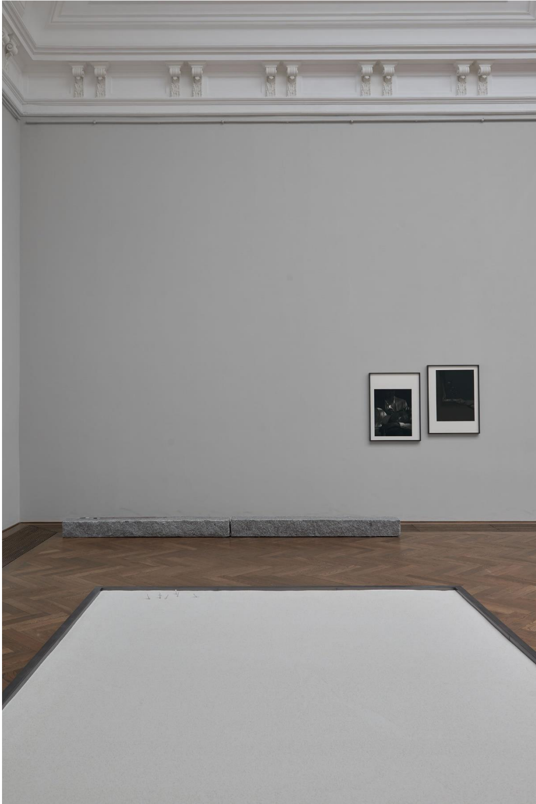
Yan Xing, Installationsansicht Dangerous Afternoon , Kunsthalle Basel, 2017.