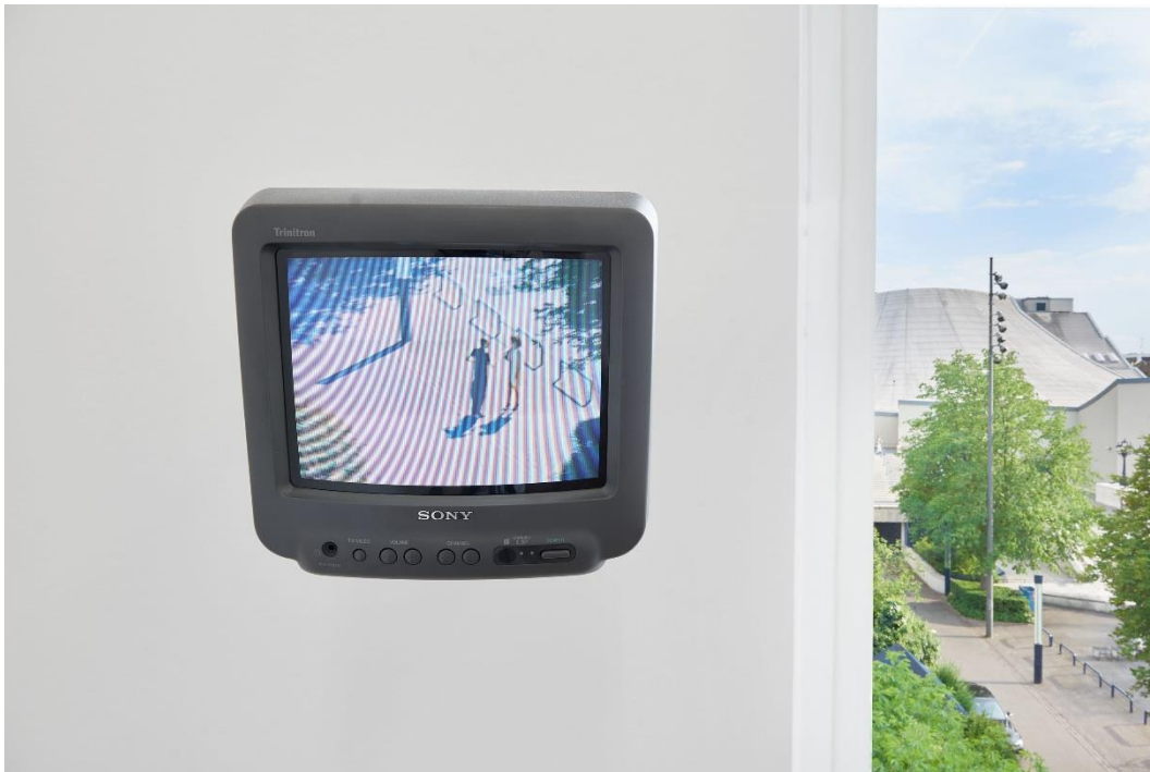
Yan Xing, Installationsansicht Dangerous Afternoon , Kunsthalle Basel, 2017.