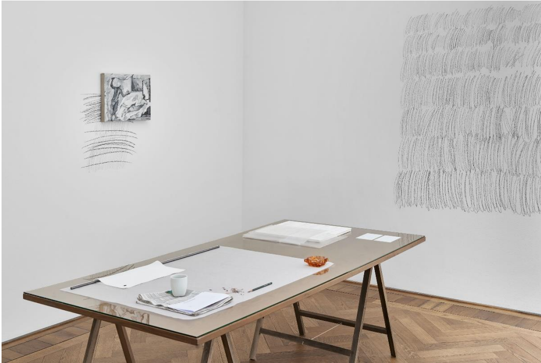
Yan Xing, Installationsansicht Dangerous Afternoon , Kunsthalle Basel, 2017.