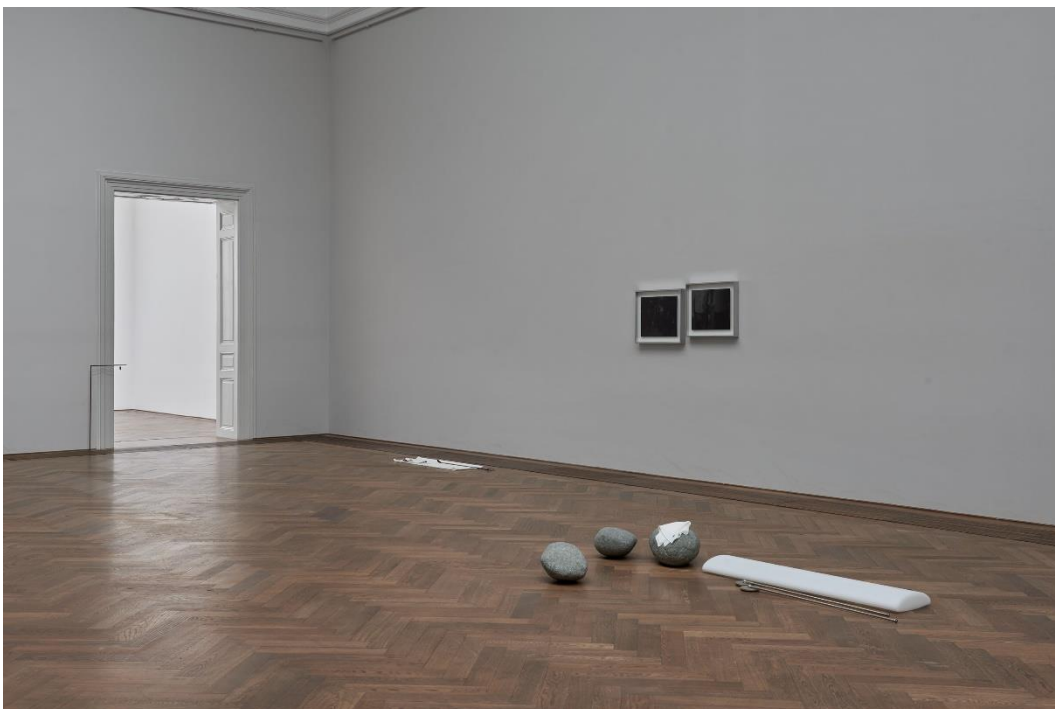
Yan Xing, Installationsansicht Dangerous Afternoon , Kunsthalle Basel, 2017.