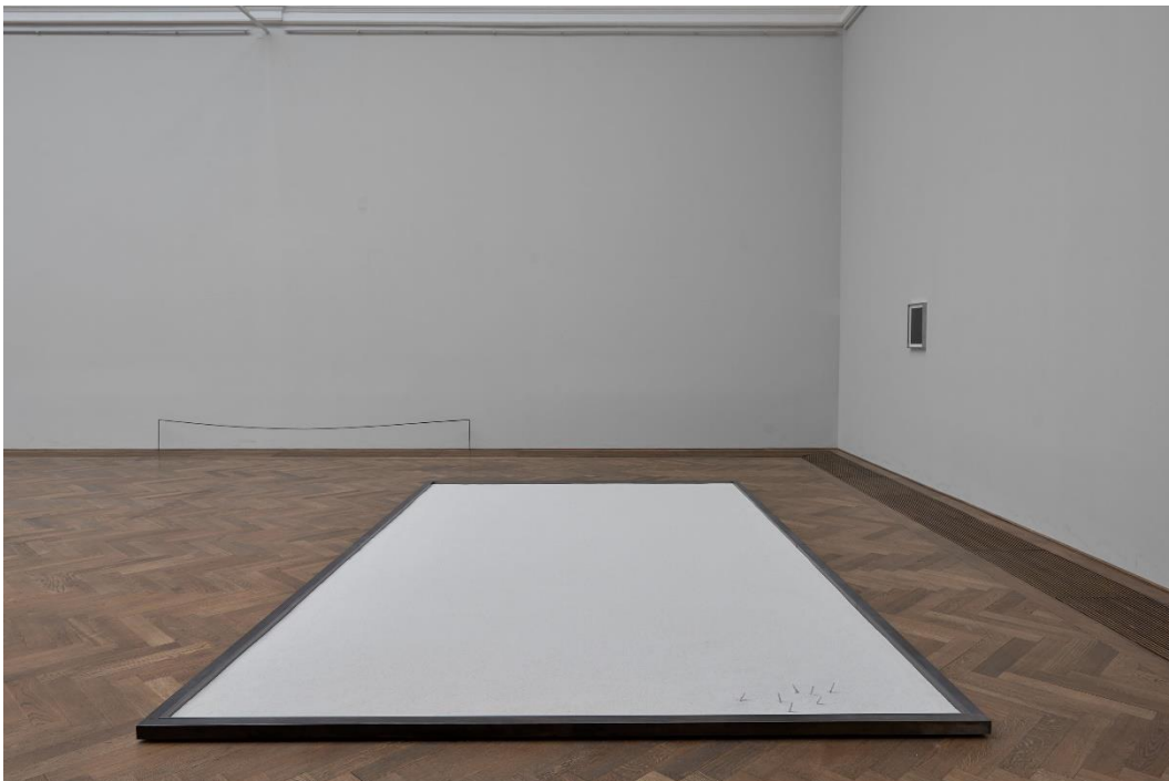
Yan Xing, Installationsansicht Dangerous Afternoon , Kunsthalle Basel, 2017.