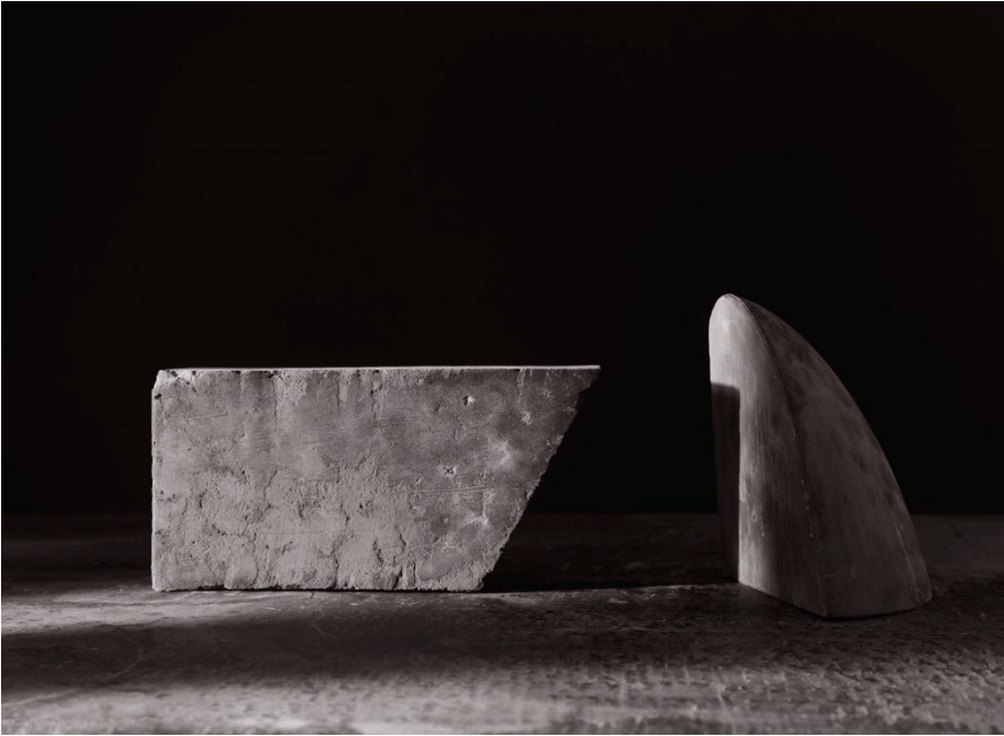
Erin Shirreff, Still (no. 7) , 2016 Archiv Pigmentdruck / archival pigment print