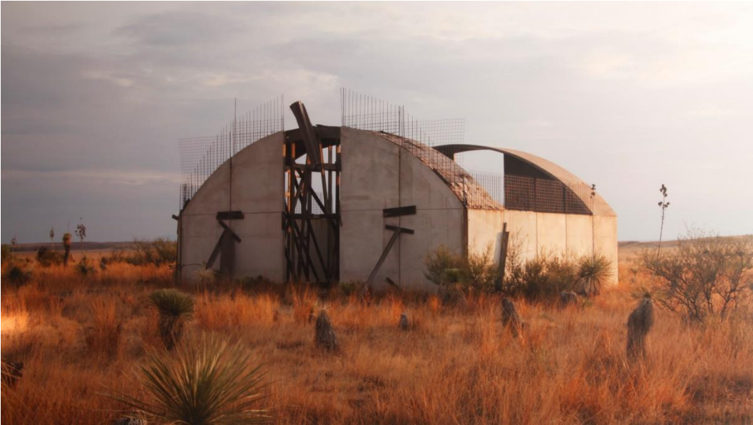
Erin Shirreff, Concrete Buildings , 2013-16 (Video Still)