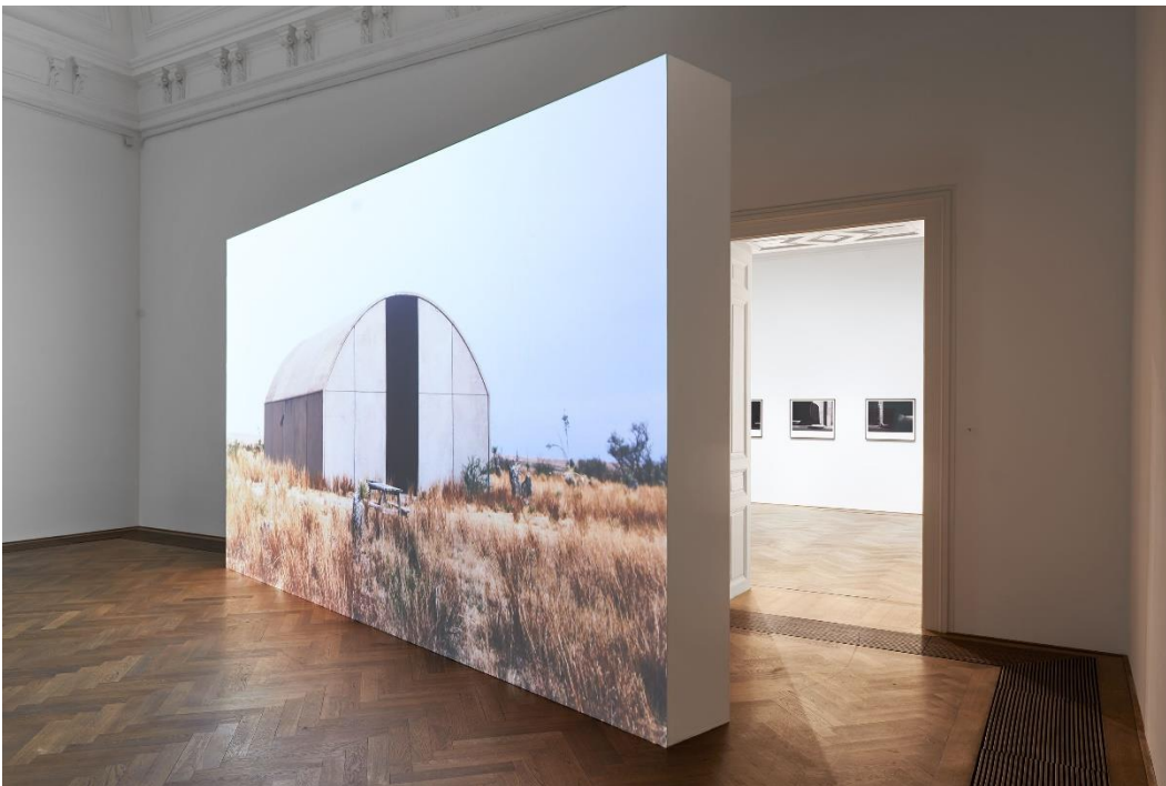
Erin Shirreff, Installationsansicht, Halves and Wholes , Blick auf Concrete Buildings , 2013-16, Kunsthalle Basel, 2016. Foto: Philipp Hänger / Erin Shirreff, installation view, Halves and Wholes , view on Concrete Buildings , 2013-16, Kunsthalle Basel, 2016. Photo: Philipp Hänger