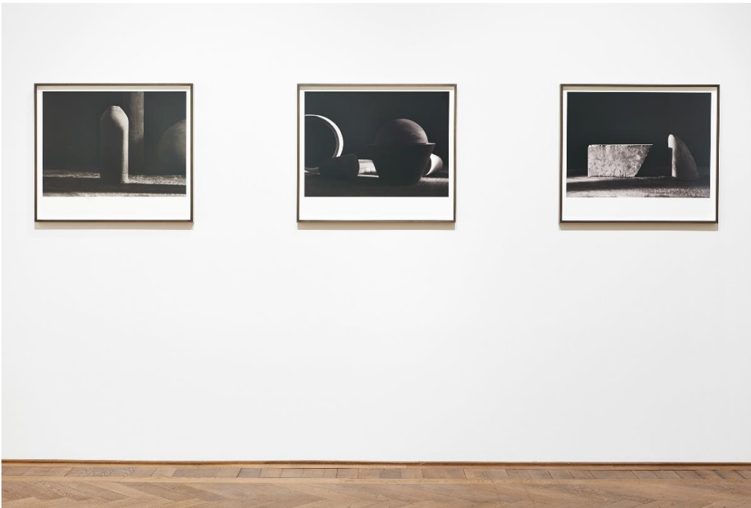
Erin Shirreff, Installationsansicht, Halves and Wholes , Blick auf Still (no. 3) und Still (no. 2) und Still (no.7) , 2016, Kunsthalle Basel, 2016. Foto: Philipp Hänger / Erin Shirreff, installation view, Halves and Wholes , view on Still (no. 3) and Still (no. 2) and Still (no.7) , 2016, Kunsthalle Basel, 2016. Photo: Philipp Hänger