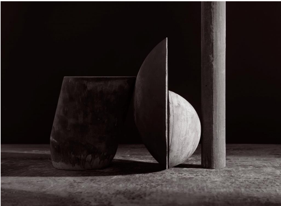
Erin Shirreff, Still (no. 5) , 2016 Archiv Pigmentdruck / archival pigment print