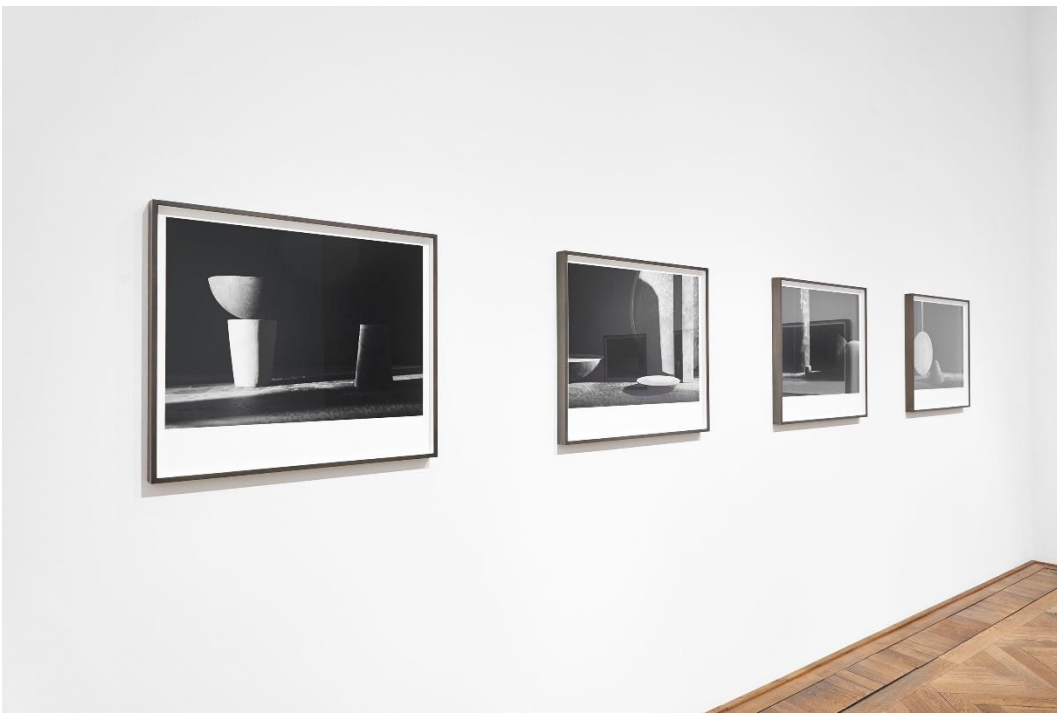
Erin Shirreff, Installationsansicht, Halves and Wholes , Kunsthalle Basel, 2016. Foto: Philipp Hänger / Erin Shirreff, installation view, Halves and Wholes , Kunsthalle Basel, 2016. Photo: Philipp Hänger