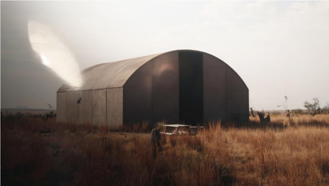
Erin Shirreff, Concrete Buildings , 2013-16 (Video Still)