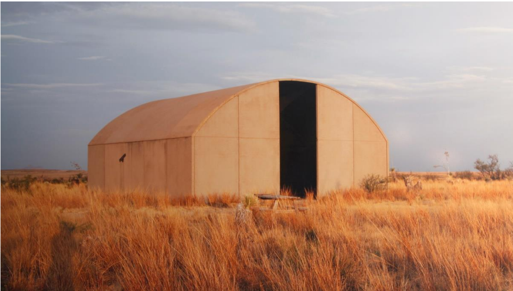
Erin Shirreff, Concrete Buildings , 2013-16 (Video Still)