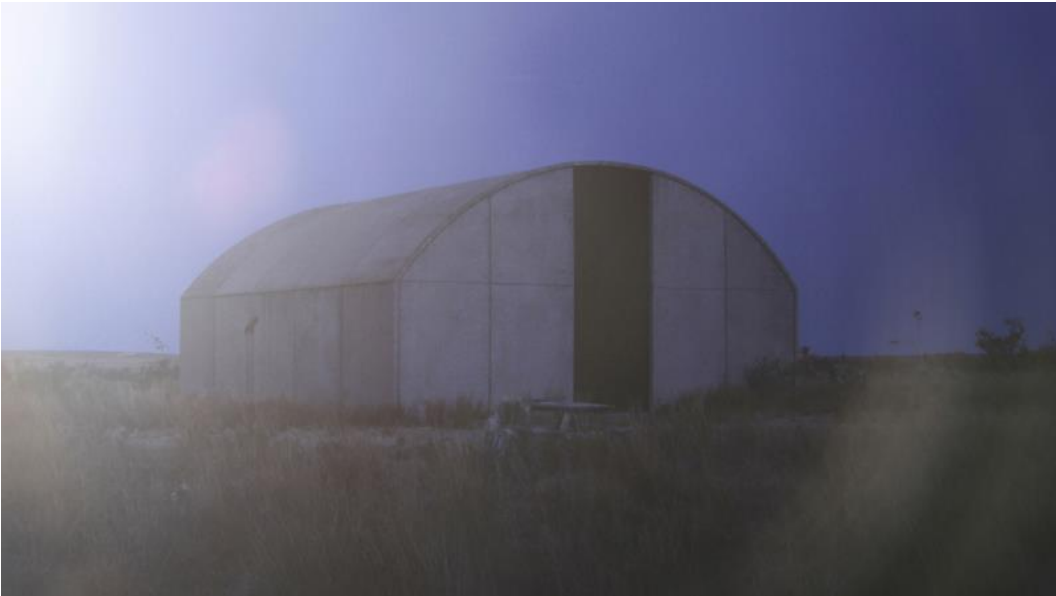
Erin Shirreff, Concrete Buildings , 2013-16 (Video Still)