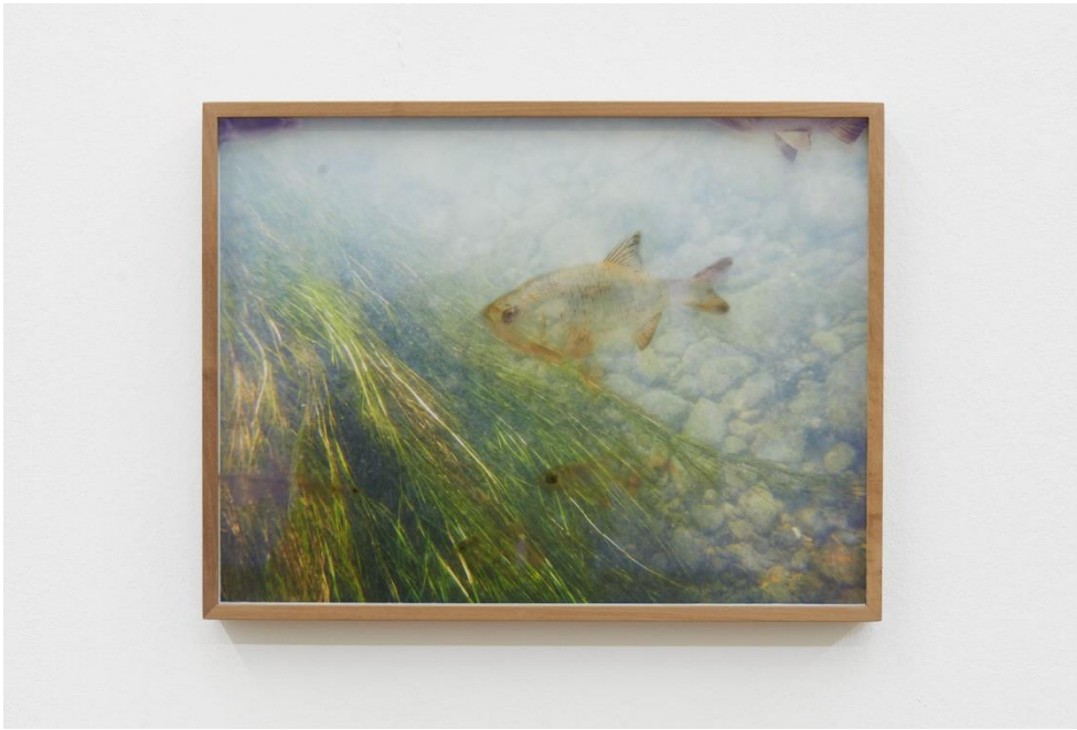
Marina Pinsky, Rhine Riverbed 29 , 2015, Kunsthalle Basel, 2016. Foto: Philipp Hänger / Marina Pinsky, Rhine Riverbed 29 , 2015, Kunsthalle Basel, 2016. Photo: Philipp Hänger