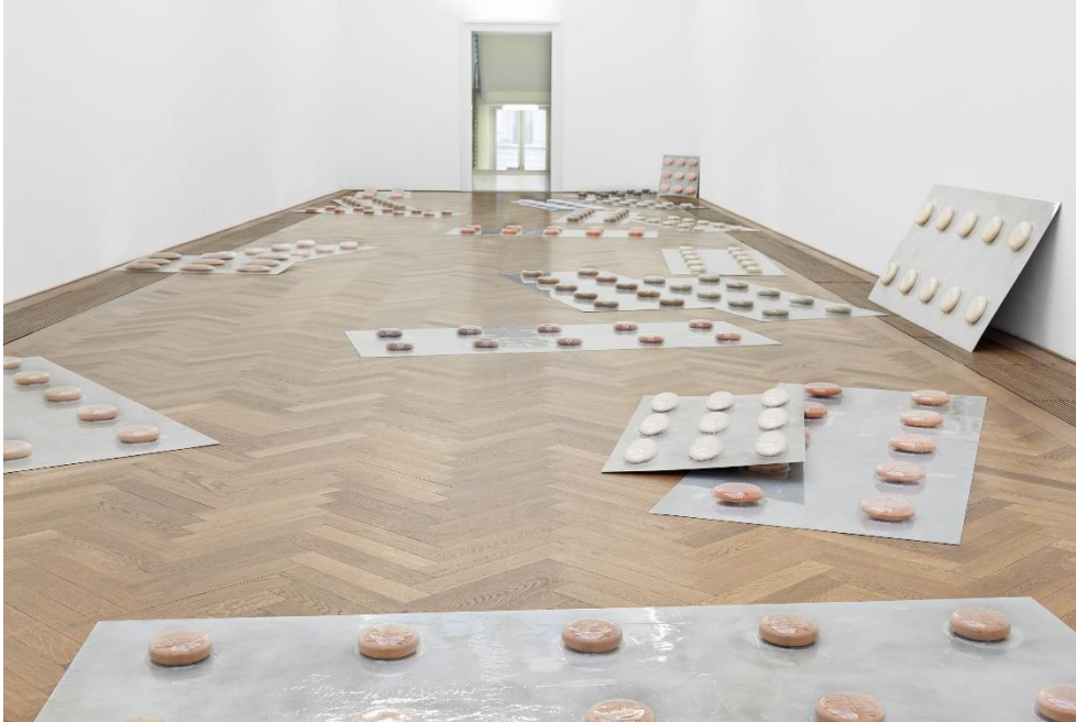
Marina Pinsky, Installationsansicht Dyed Channel , Blick auf Landscape (Pharmakon I-XXIV) , 2014-15, Kunsthalle Basel, 2016. Marina Pinsky, Installation view Dyed Channel , view on Landscape (Pharmakon I-XXIV) , 2014-15, Kunsthalle Basel, 2016.