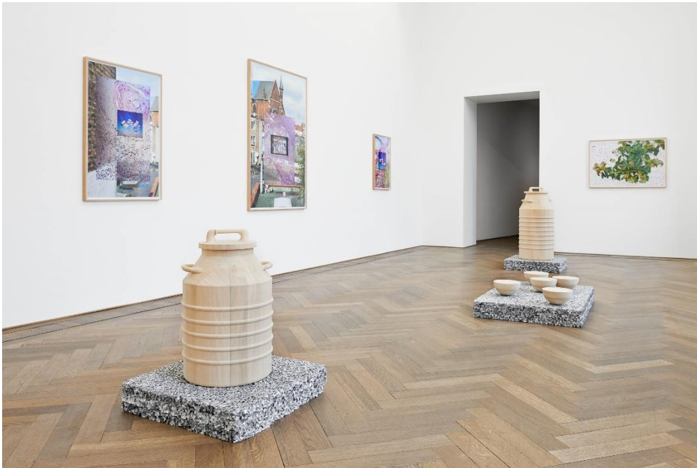
Marina Pinsky, Installationsansicht Dyed Channel , Kunsthalle Basel, 2016. Foto: Philipp Hänger / Marina Pinsky, Installation view Dyed Channel , Kunsthalle Basel, 2016. Photo: Philipp Hänger