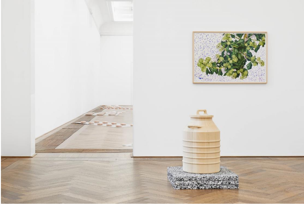
Marina Pinsky, Installationsansicht Dyed Channel , Kunsthalle Basel, 2016. / Marina Pinsky, Installation view Dyed Channel , Kunsthalle Basel, 2016.