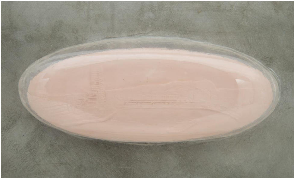
Marina Pinsky, Pharmakon XXIV , 2015 (Detail). Foto: Hugard & Vanoverschelde / Marina Pinsky, Pharmakon XXIV , 2015 (detail). Photo: Hugard & Vanoverschelde