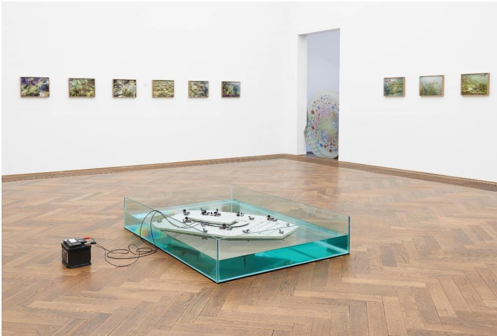
Marina Pinsky, Installationsansicht Dyed Channel , Kunsthalle Basel, 2016. Foto: Philipp Hänger / Marina Pinsky, Installation view Dyed Channel , Kunsthalle Basel, 2016. Photo: Philipp Hänger