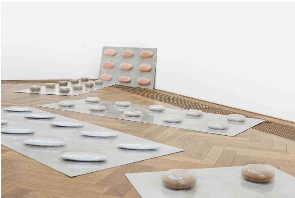
Marina Pinsky, Installationsansicht Dyed Channel , Blick auf Landscape (Pharmakon I-XXIV) , 2014-15, Kunsthalle Basel, 2016. Foto: Philipp Hänger / Marina Pinsky, Installation view Dyed Channel , view on Landscape (Pharmakon I-XXIV) , 2014-15, Kunsthalle Basel, 2016. Photo: Philipp Hänger