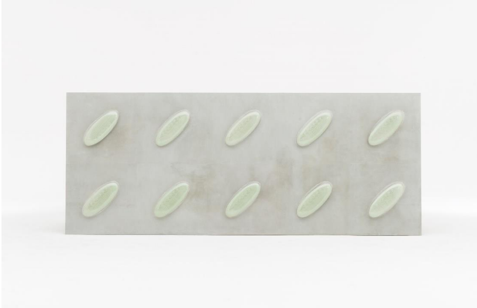
Marina Pinsky, Pharmakon XVI , 2015. Foto: Hugard & Vanoverschelde / Marina Pinsky, Pharmakon XVI , 2015. Photo: Hugard & Vanoverschelde