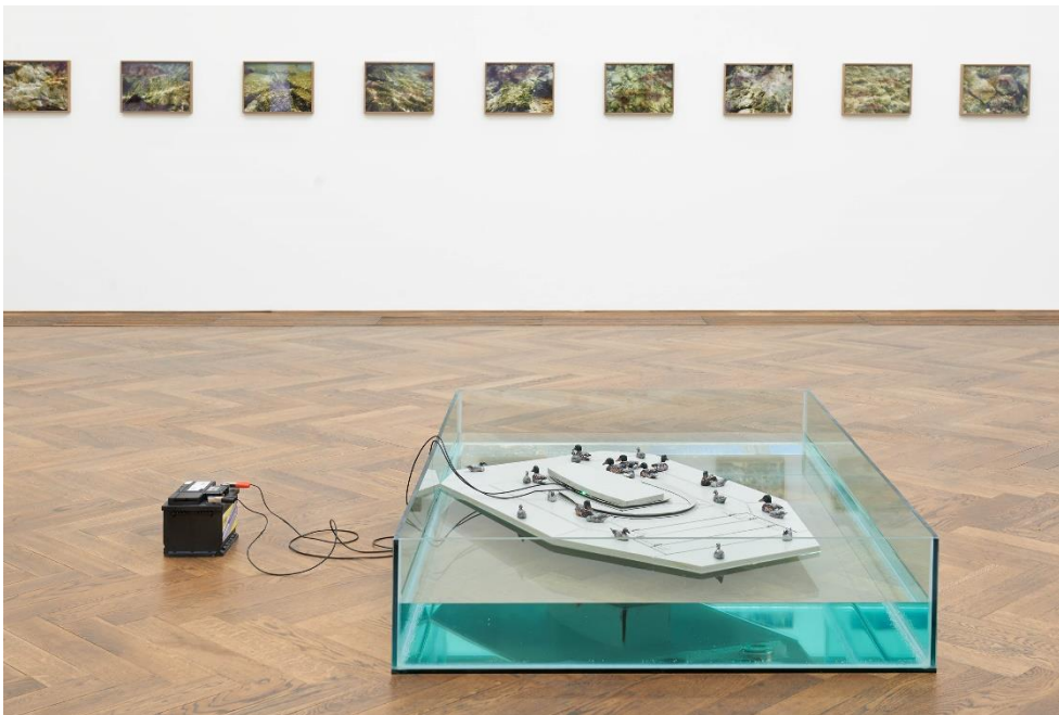
Marina Pinsky, Installationsansicht Dyed Channel , Kunsthalle Basel, 2016. Foto: Philipp Hänger / Marina Pinsky, Installation view Dyed Channel , Kunsthalle Basel, 2016. Photo: Philipp Hänger