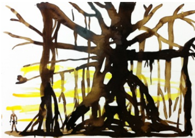
Alexis Rockman, Study for Island (Island), 2009. Watercolor and ink on paper, 8.5 x 12 inches (21.6 x 30.5 cm).