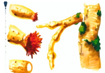
Alexis Rockman, Study for Island (Island – Root Tip and Trunk), 2009. Watercolor on paper, 8.5 x 12 inches (21.6 x 30.5 cm). Courtesy of the artist.