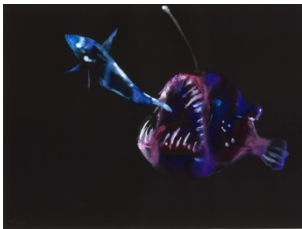
Alexis Rockman, Study for Tiger Vision (22 TV 1 9/20/11), 2011, Gouache on black paper, 9 x 12 inches (22.9 x 30.5 cm)

New York – The Drawing Center will present Alexis Rockman: Drawings from Life of Pi from September 27 to November 3, 2013, in the Drawing Room and The Lab. Alexis Rockman’s watercolor drawings were the first stage in the development of the fantastical, imaginary world of Life of Pi , the 2012 Academy Award-winning feature film directed by Ang Lee. Lee sought out Rockman’s vision as an artist with a specific commitment to hand drawing to bring a human scale to the project. Though most artistic contributions to cinema are dependent on photo-realism or cartoon-like illustration, Rockman’s images are fluid, intimate, and dynamic in a way that only drawing can capture. The exhibition will provide The Drawing Center with a unique opportunity to explore the relationship between visual art—specifically drawing—and commercial filmmaking. Co-curated by Brett Littman, Executive Director and Nova Benway, Curatorial Assistant.