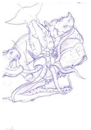
Alexis Rockman, Study for French Chef (Squid Whale Detail), 2010. Prismacolor Pencil on Paper, 8 1/2 x 11 inches (21.6 x 27.9 cm).