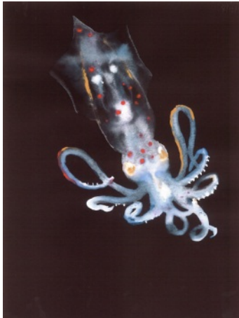
Alexis Rockman, Study for Tiger Vision , 2011. Gouache on black paper, 9 x 12 inches (23.9 x 30.5 cm).

For further information and images, please contact Molly Gross, Communications Director , The Drawing Center 212 219 2166 x119 | mgross@drawingcenter.org