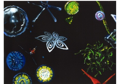
Alexis Rockman, Study for Tiger Vision , 2011. Gouache on black paper, 9 x 12 inches (22.9 x 30.5 cm).